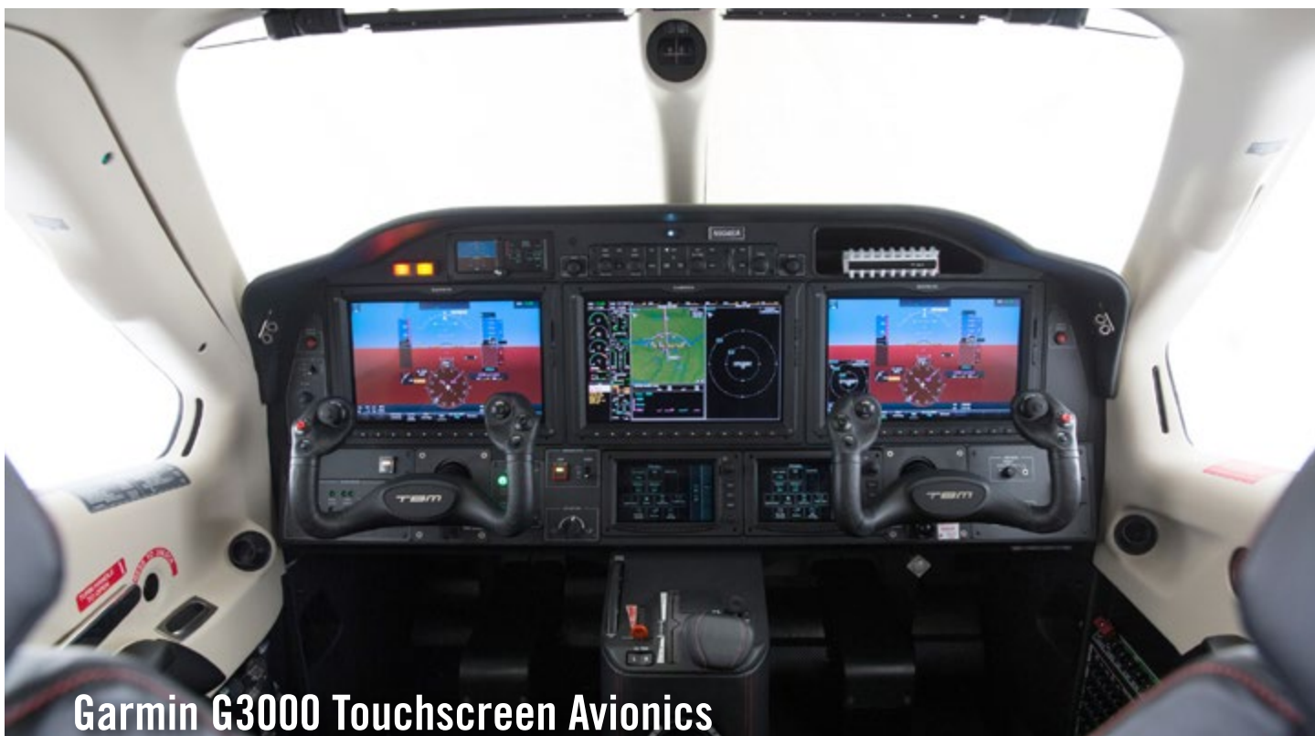
Garmin G3000 Touchscreen Avionics