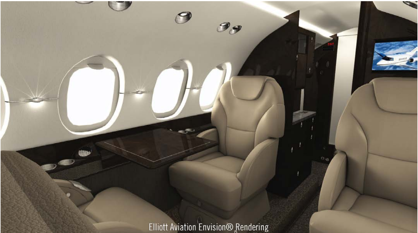
Elliott Aviation Envision® Rendering