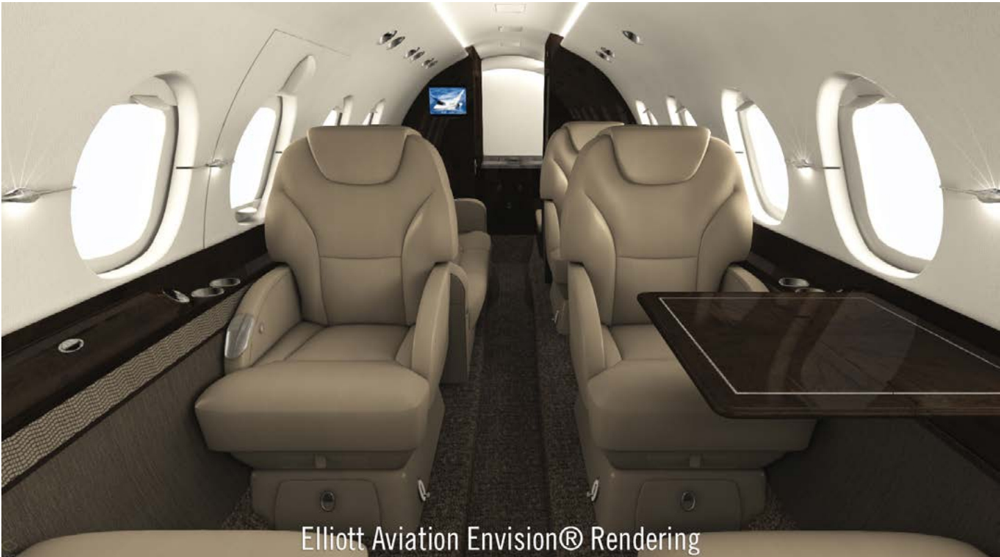
Elliott Aviation Envision® Rendering