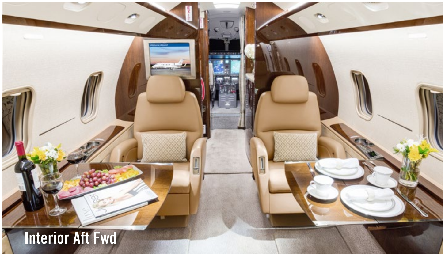
Interior Aft Fwd