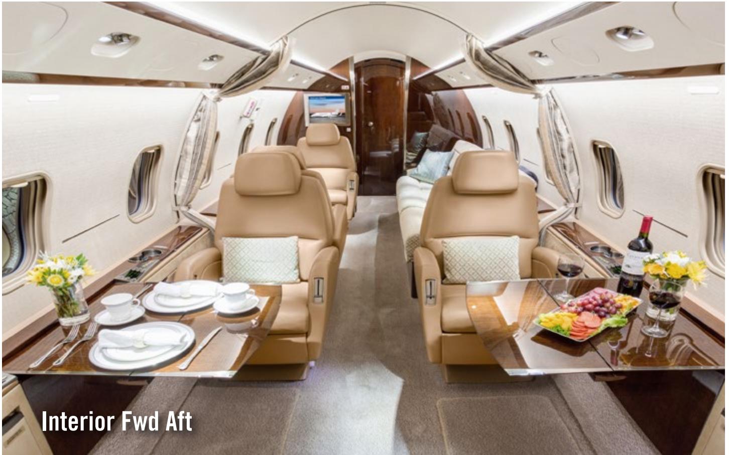
Interior Fwd Aft