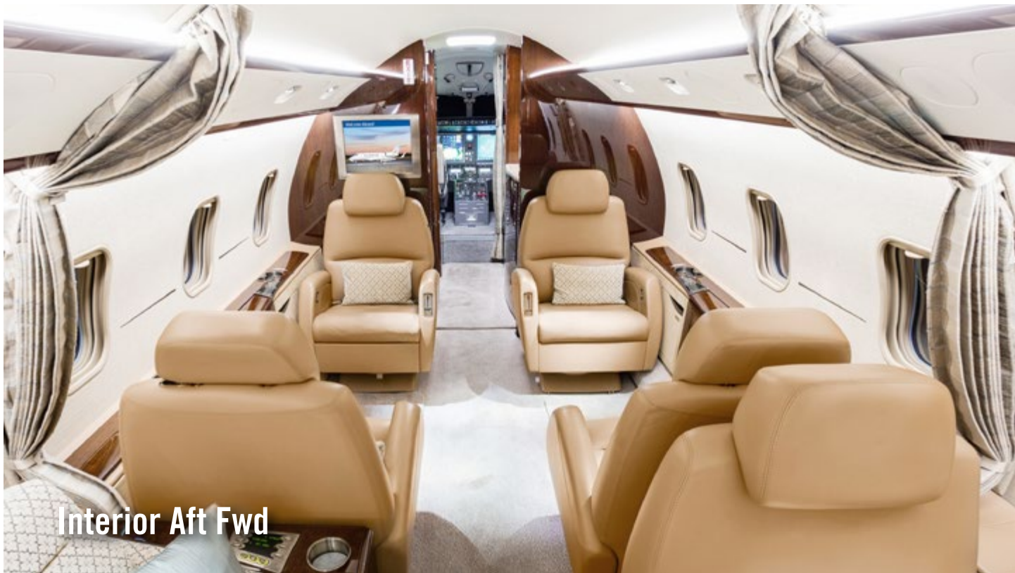
Interior Aft Fwd