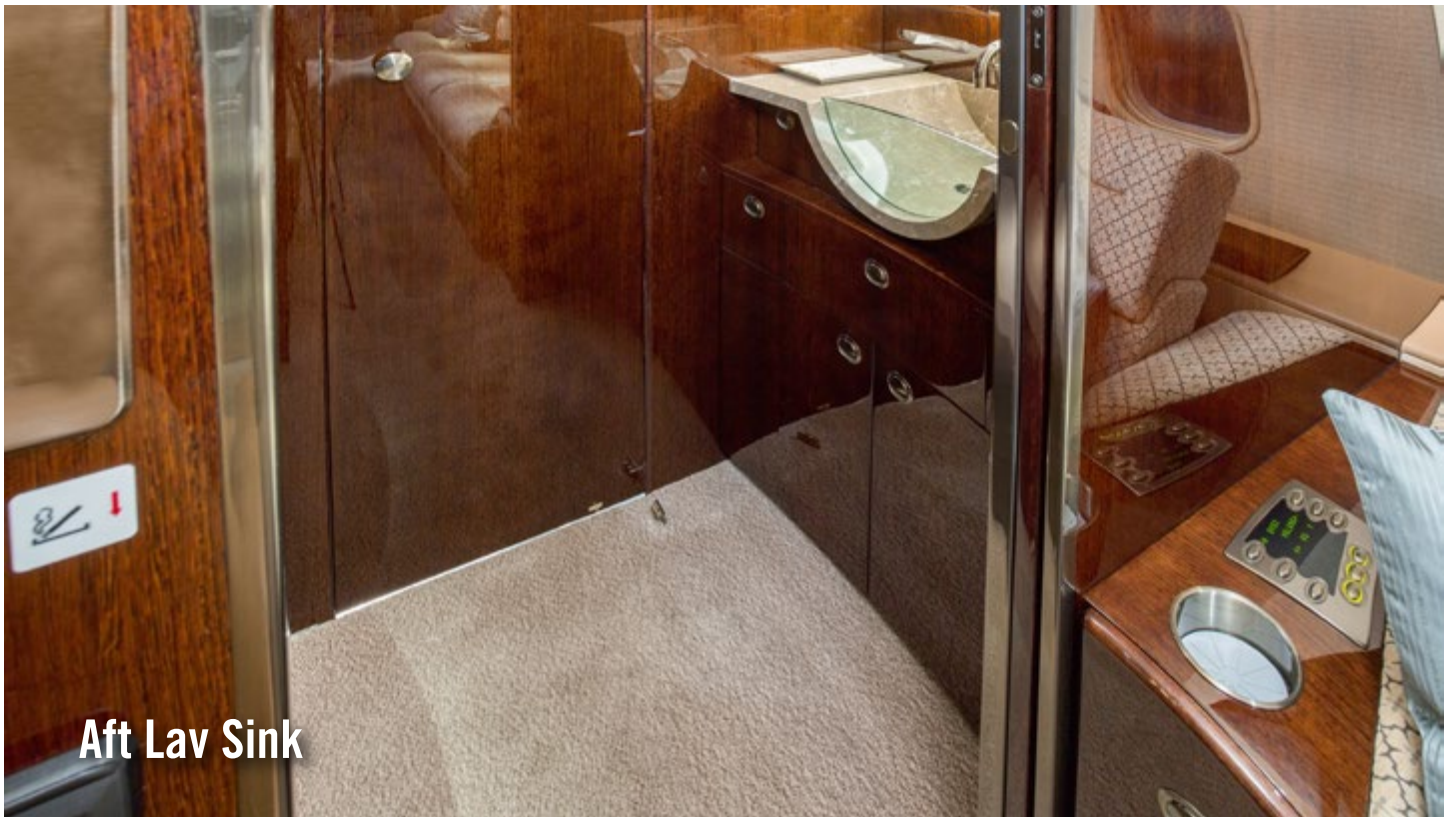
Aft Lav Sink