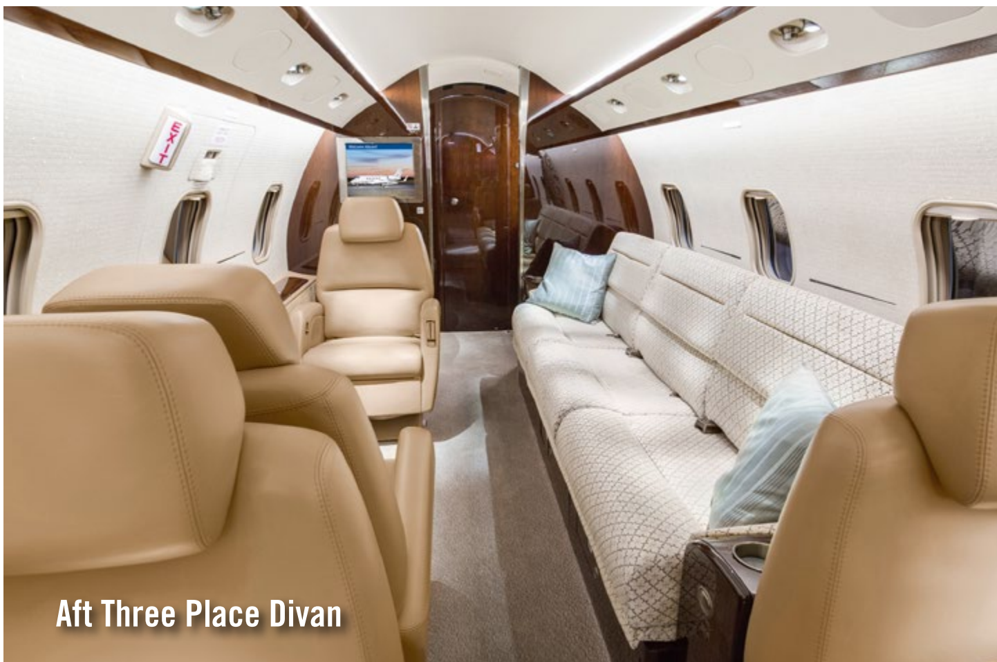
Aft Three Place Divan