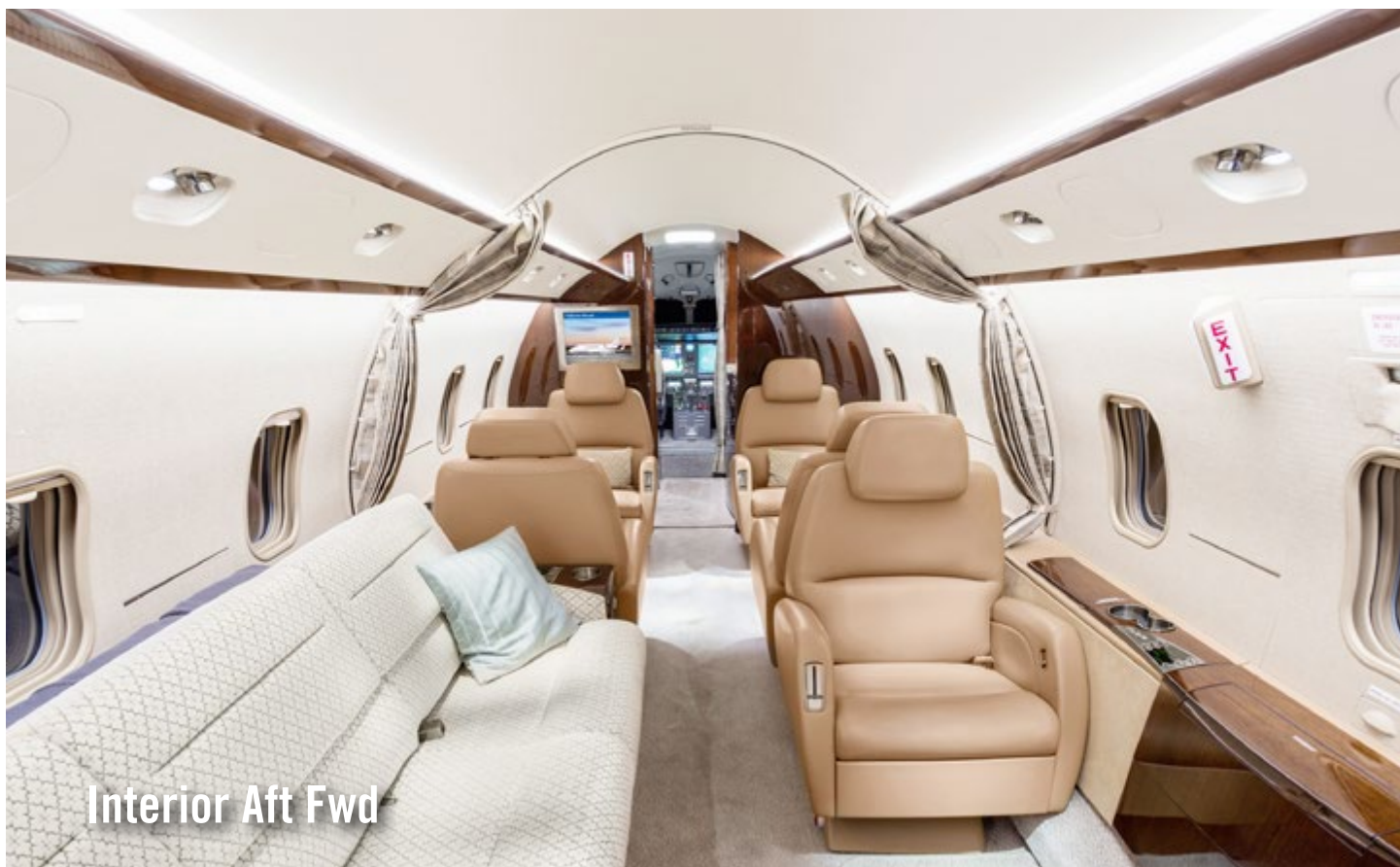
Interior Aft Fwd