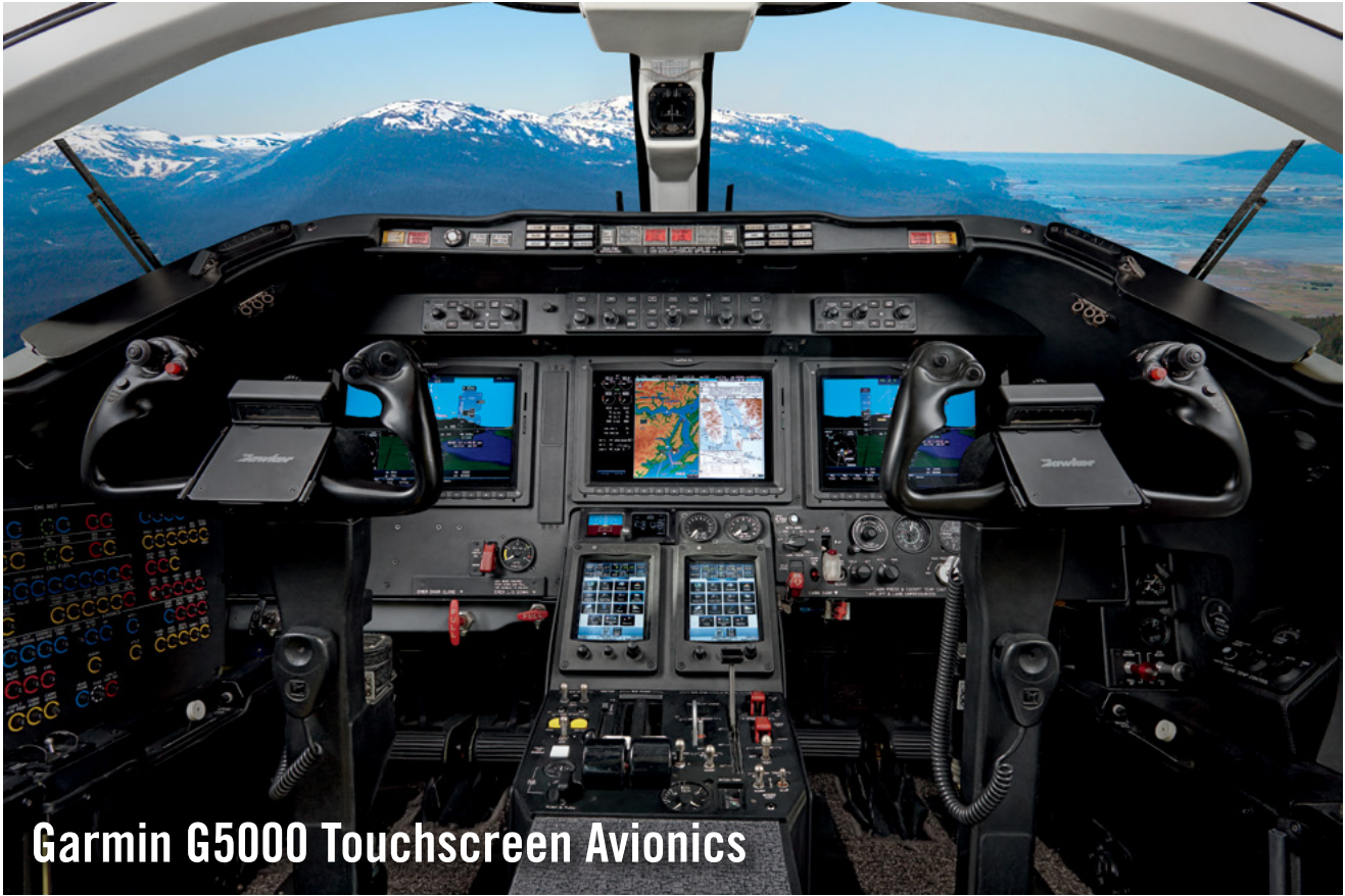
Garmin G5000 Touchscreen Avionics