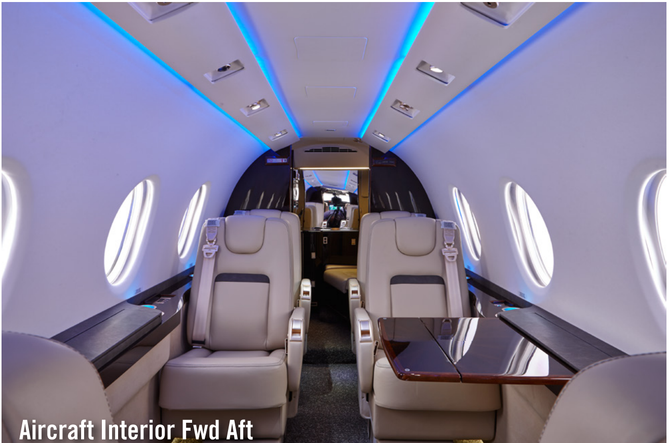
Aircraft Interior Fwd Aft