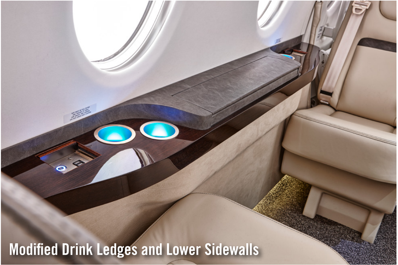
Modified Drink Ledges and Lower Sidewalls