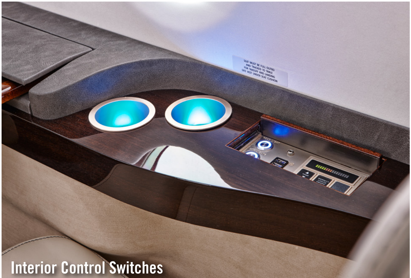
Interior Control Switches