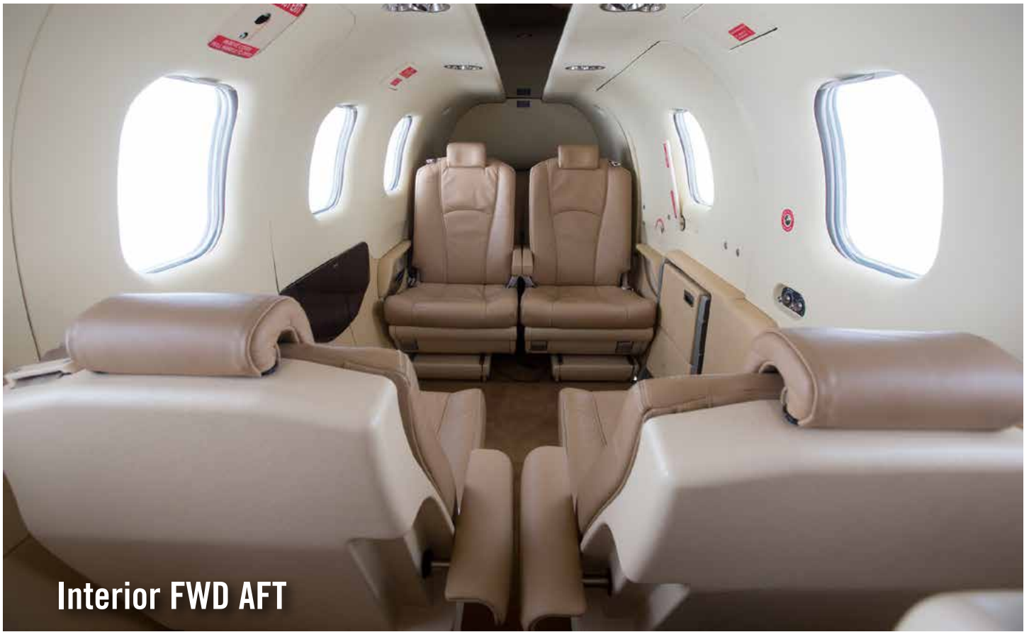
Interior FWD AFT