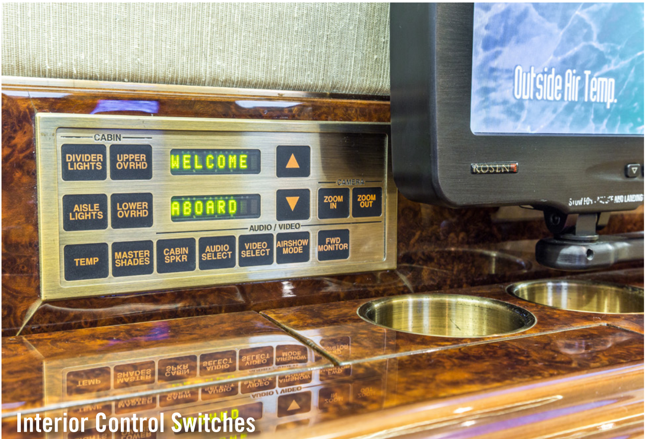
Interior Control Switches