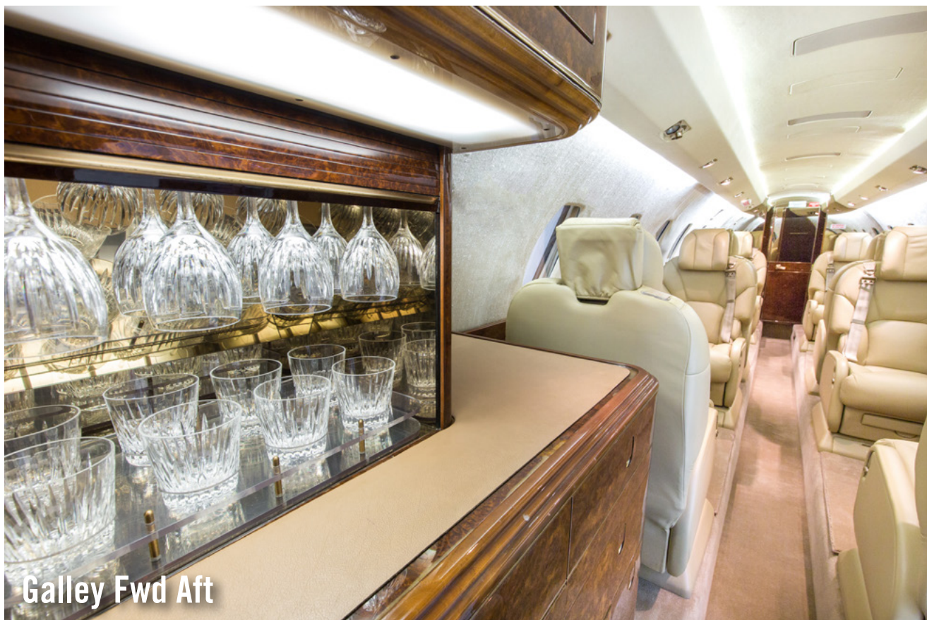
Galley Fwd Aft