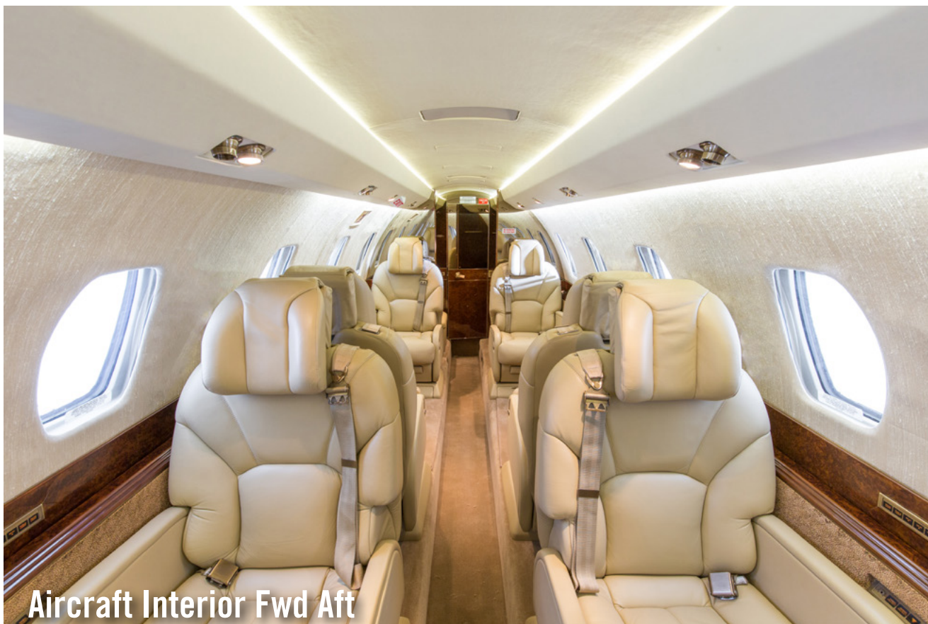
Aircraft Interior Fwd Aft