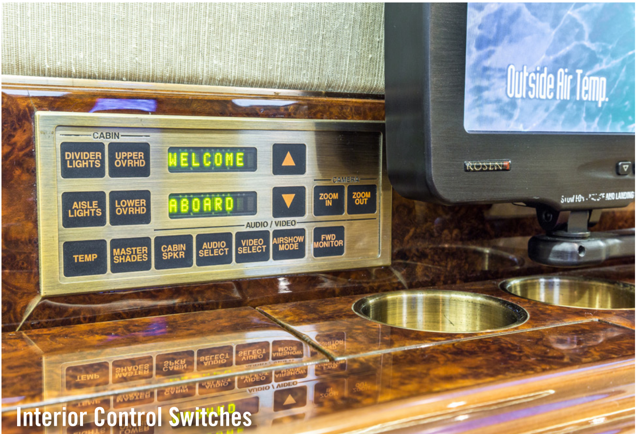
Interior Control Switches