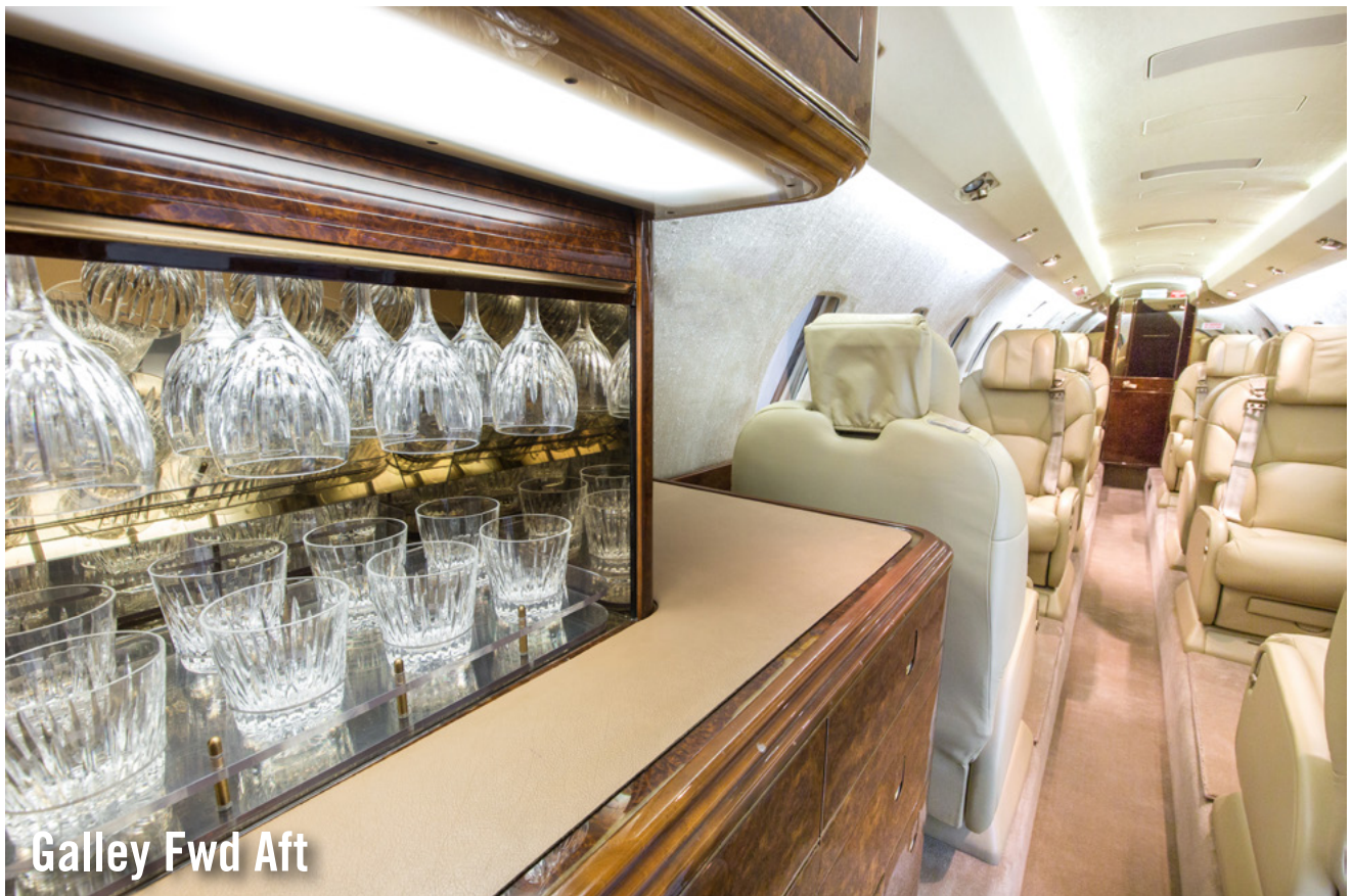
Galley Fwd Aft