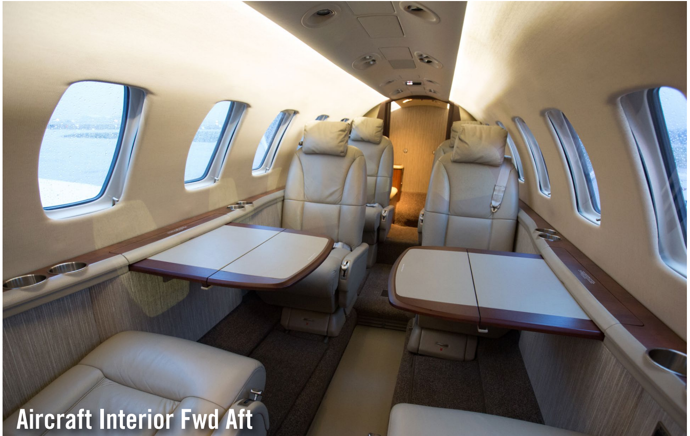
Aircraft Interior Fwd Aft