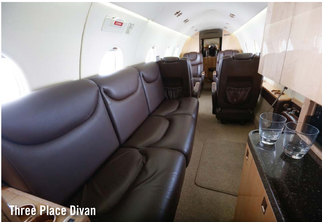
Three Place Divan