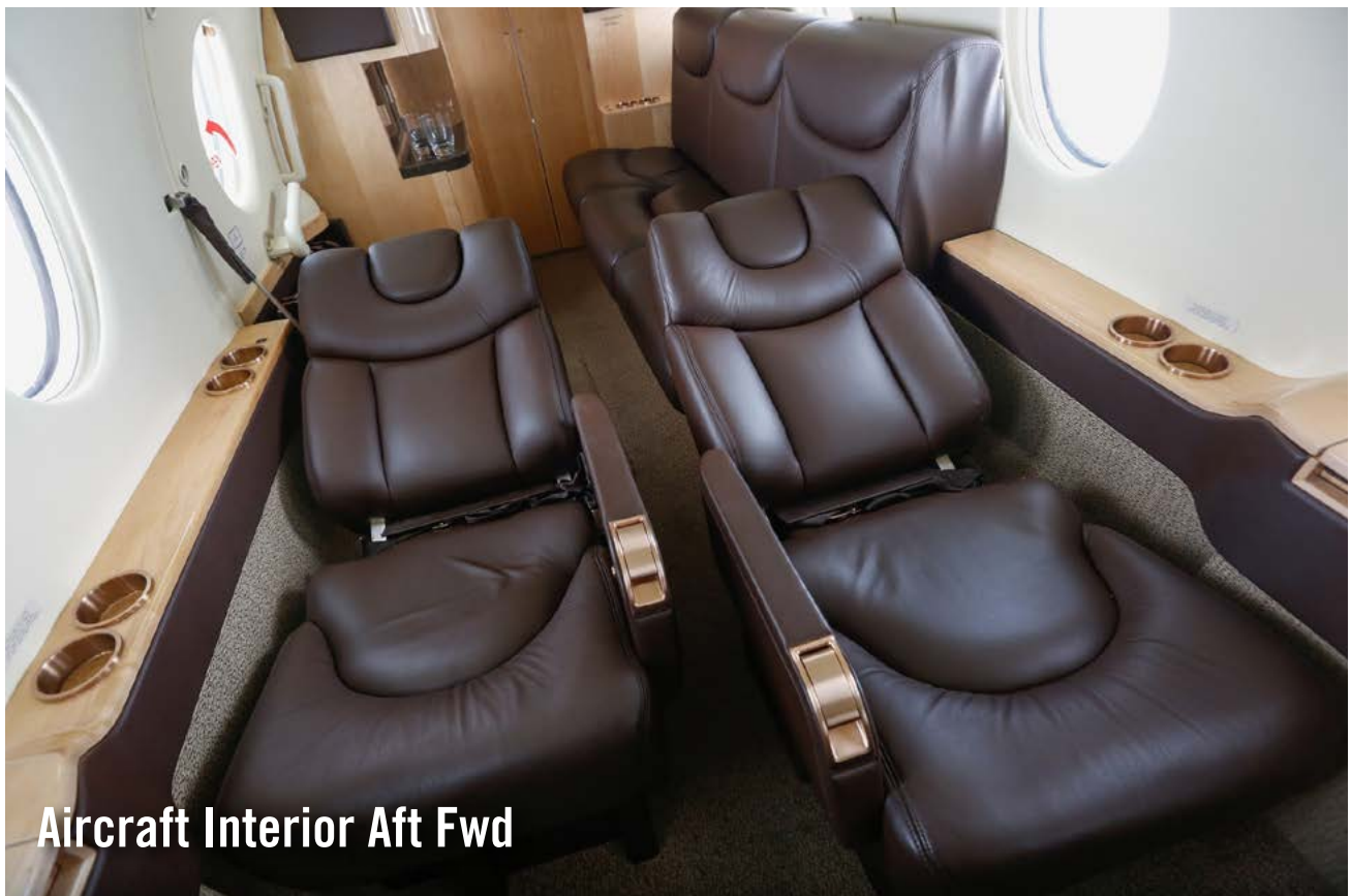
Aircraft Interior Aft Fwd