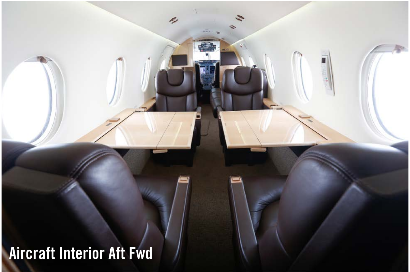
Aircraft Interior Aft Fwd