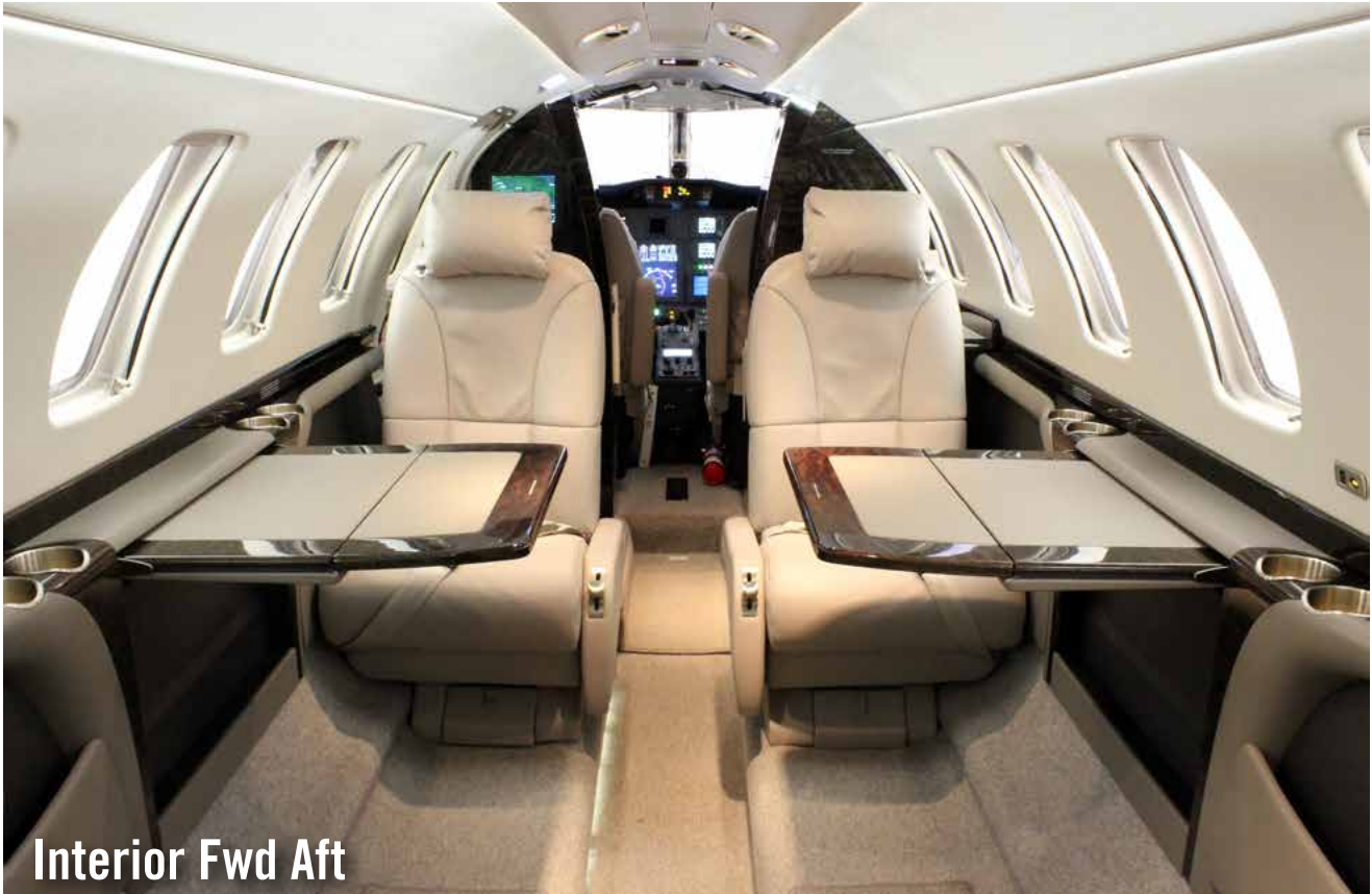
Interior Fwd Aft