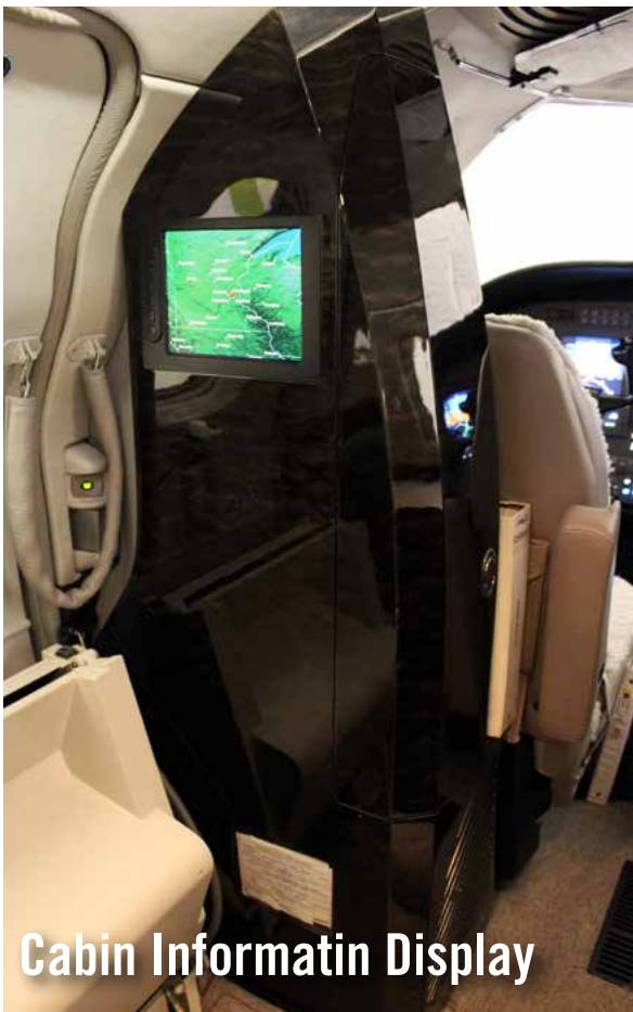
Cabin Informatin Display