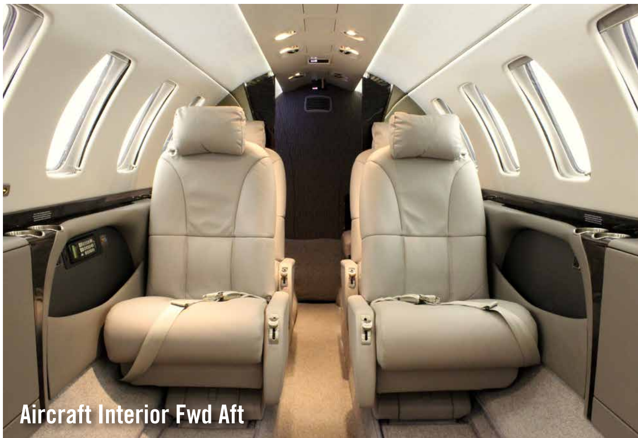
Aircraft Interior Fwd Aft