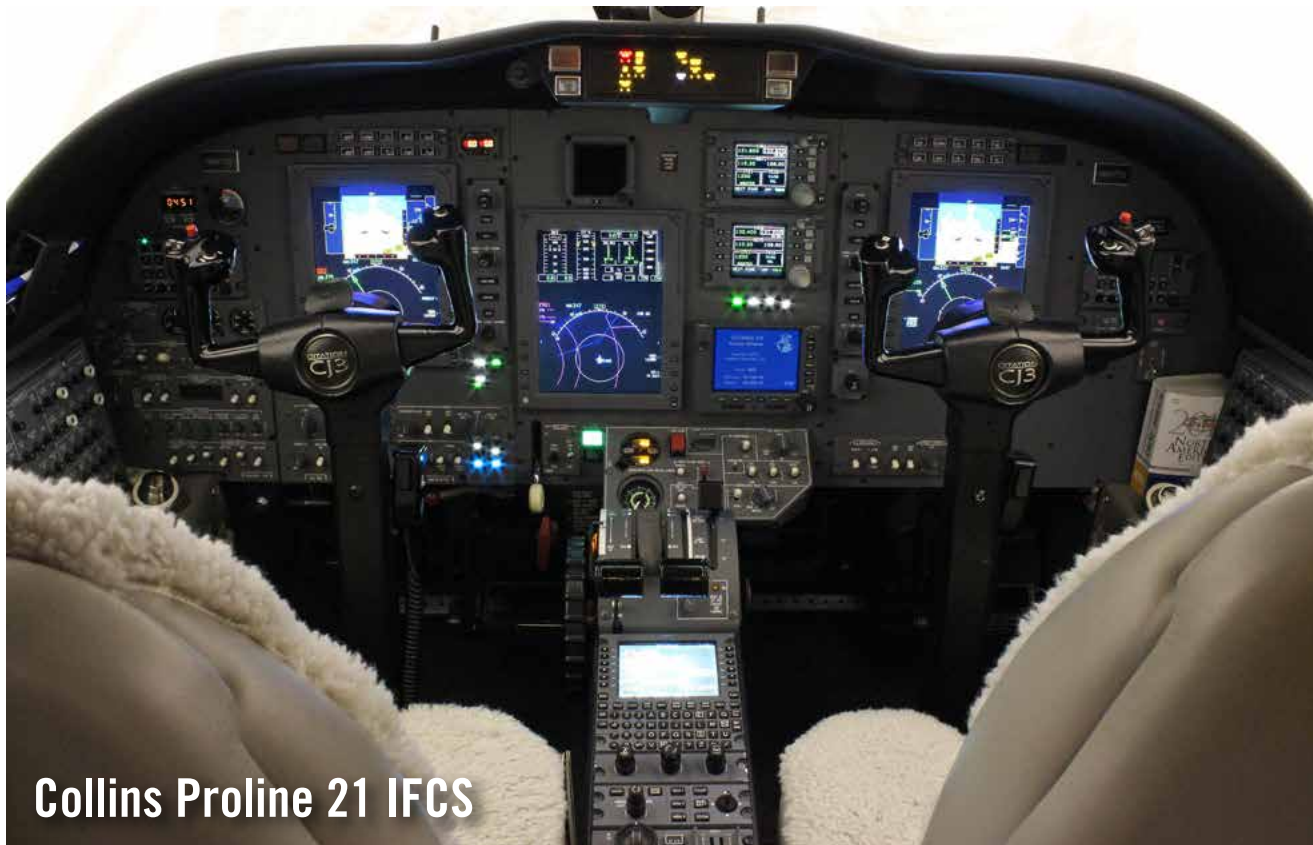
Collins Proline 21 IFCS