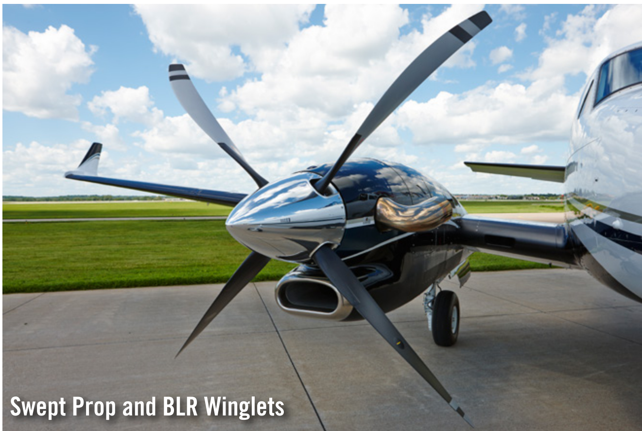
Swept Prop and BLR Winglets