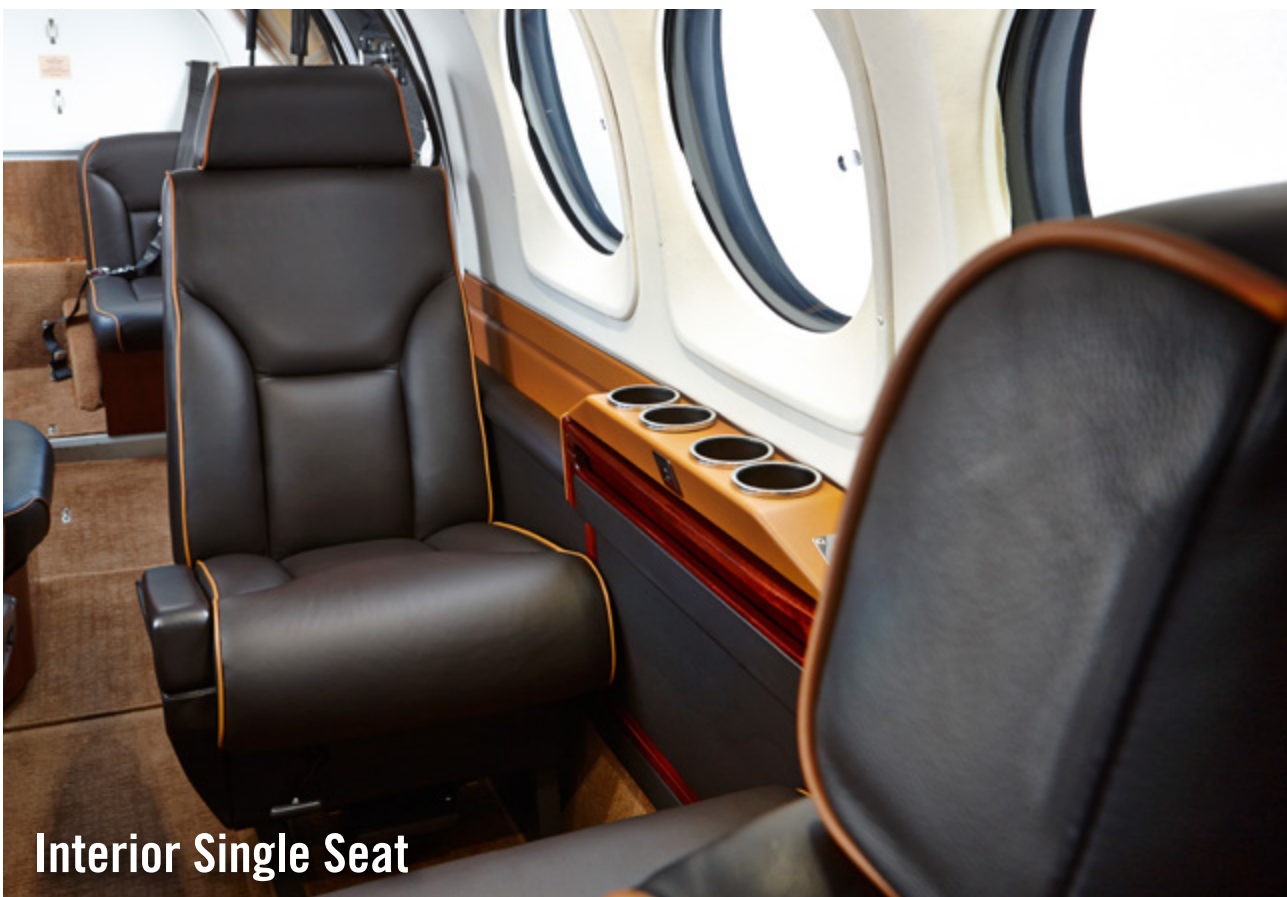
Interior Single Seat