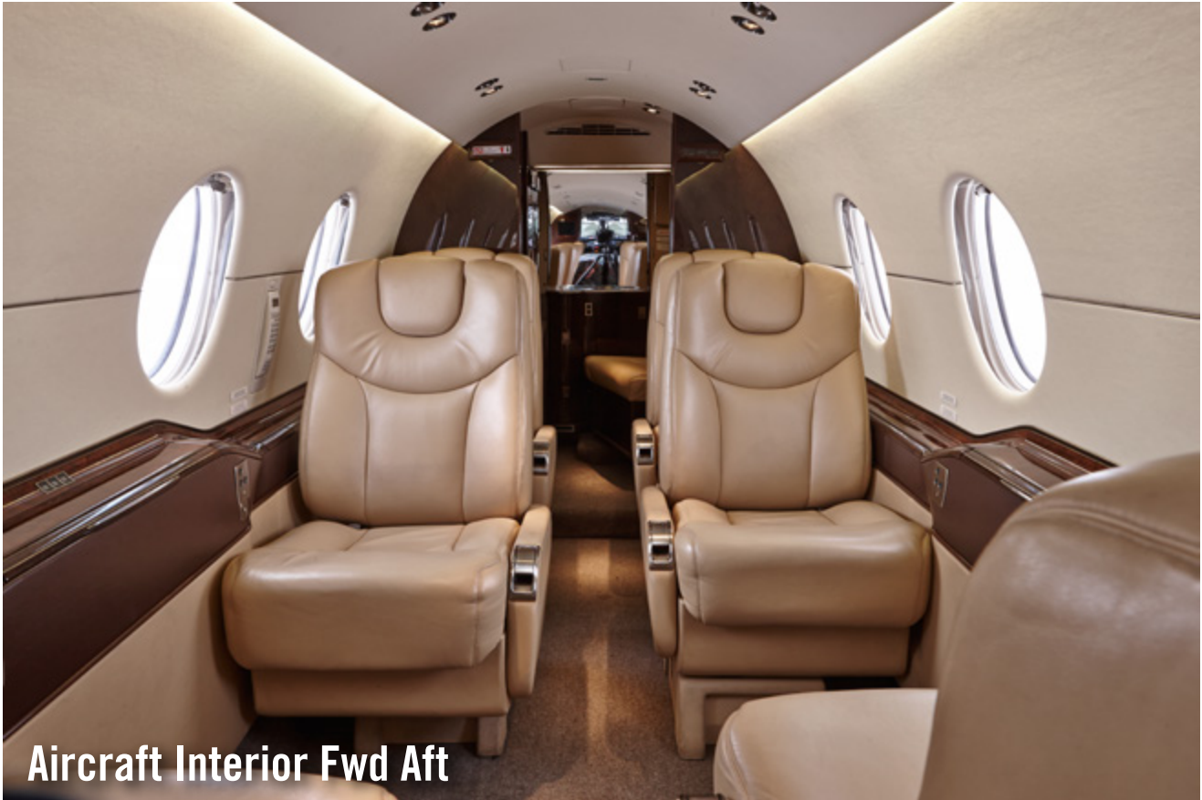
Aircraft Interior Fwd Aft