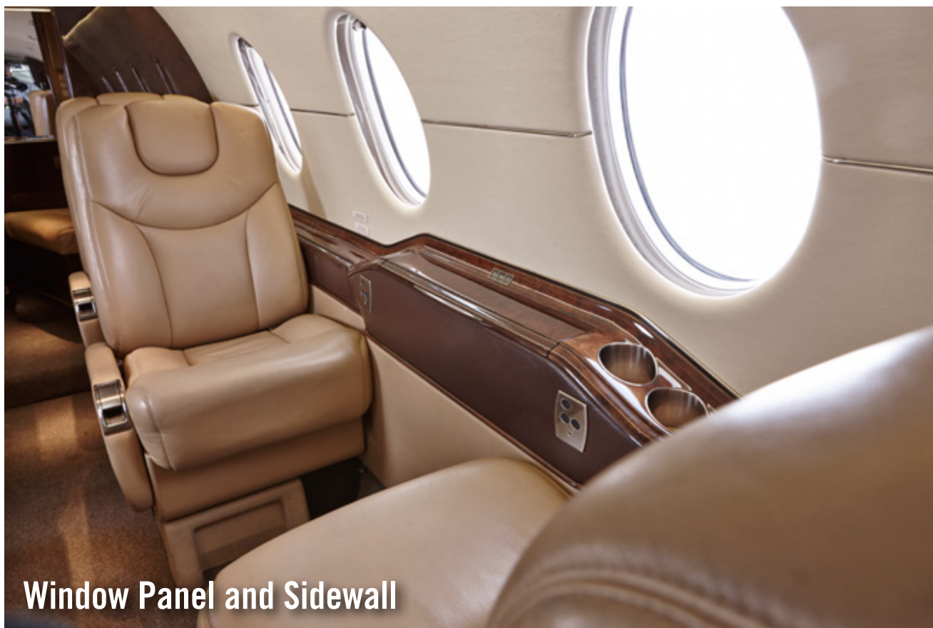
Window Panel and Sidewall