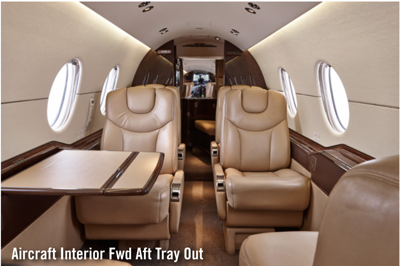
Aircraft Interior Fwd Aft Tray Out