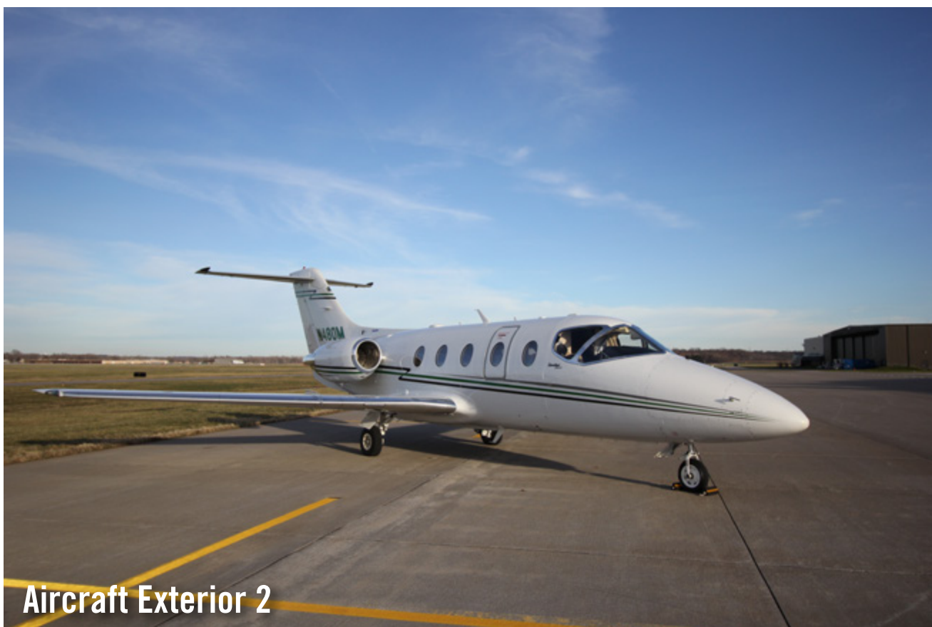
Aircraft Exterior 2