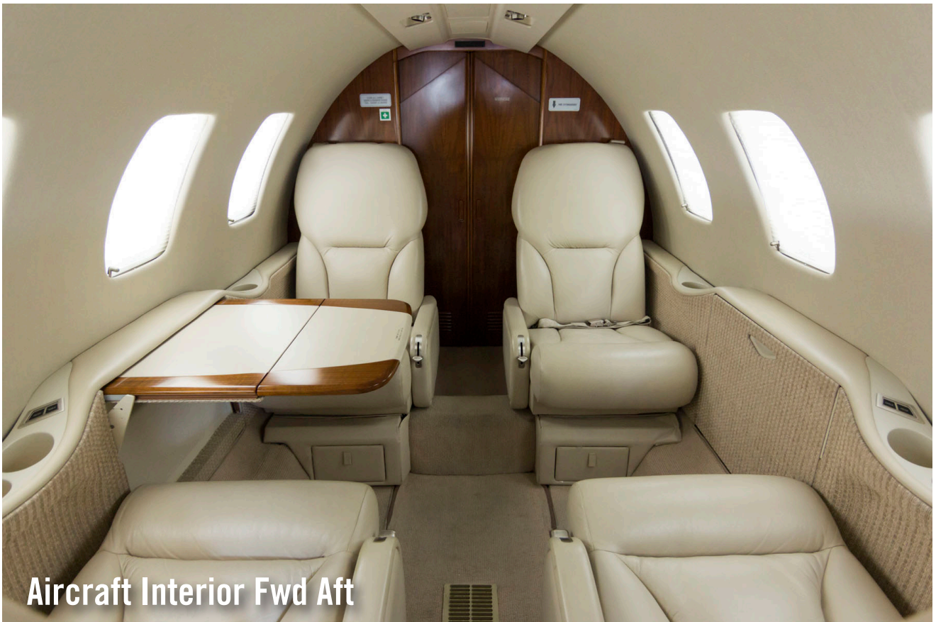
Aircraft Interior Fwd Aft