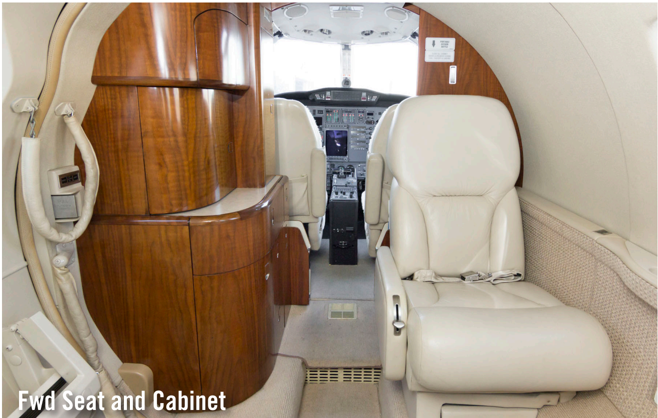
Fwd Seat and Cabinet