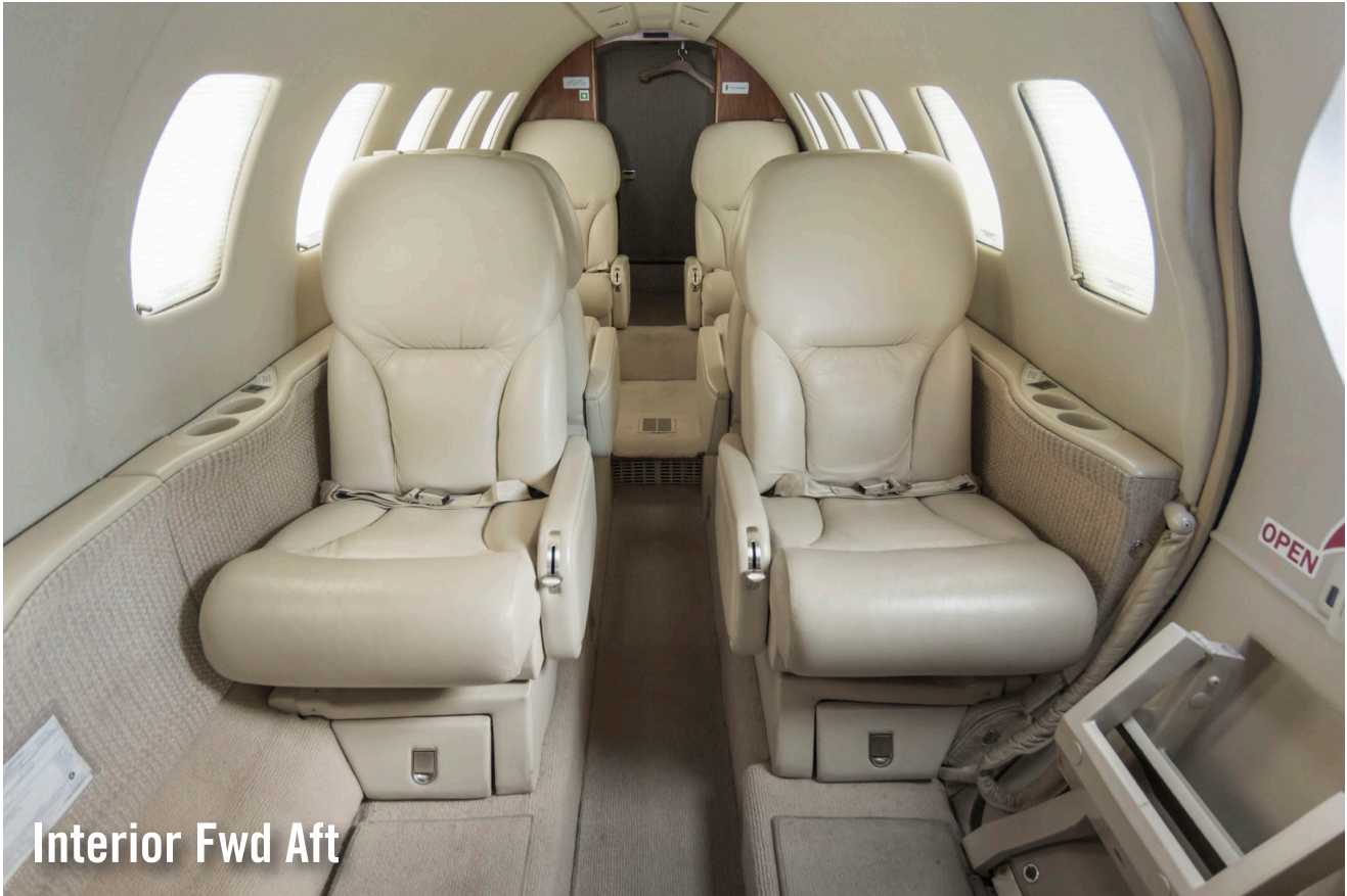
Interior Fwd Aft