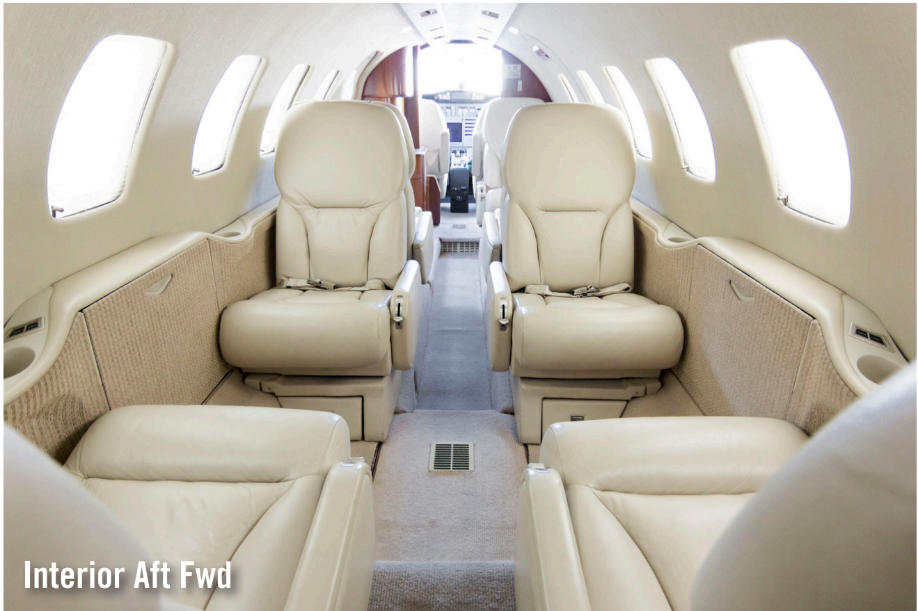
Interior Aft Fwd