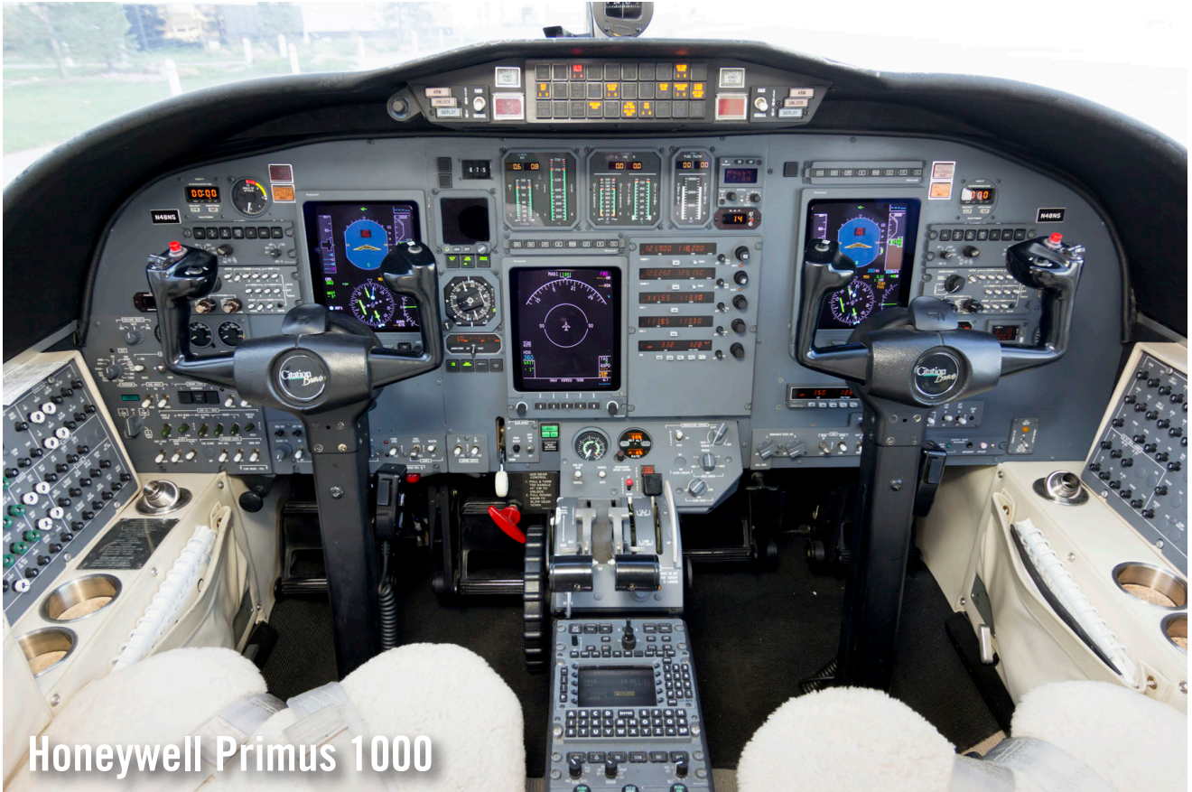
Honeywell Primus 1000