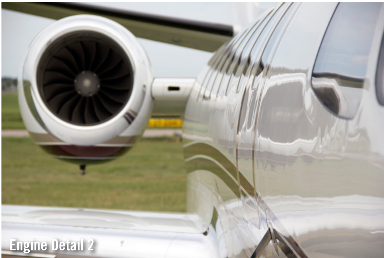
Engine Detail 2