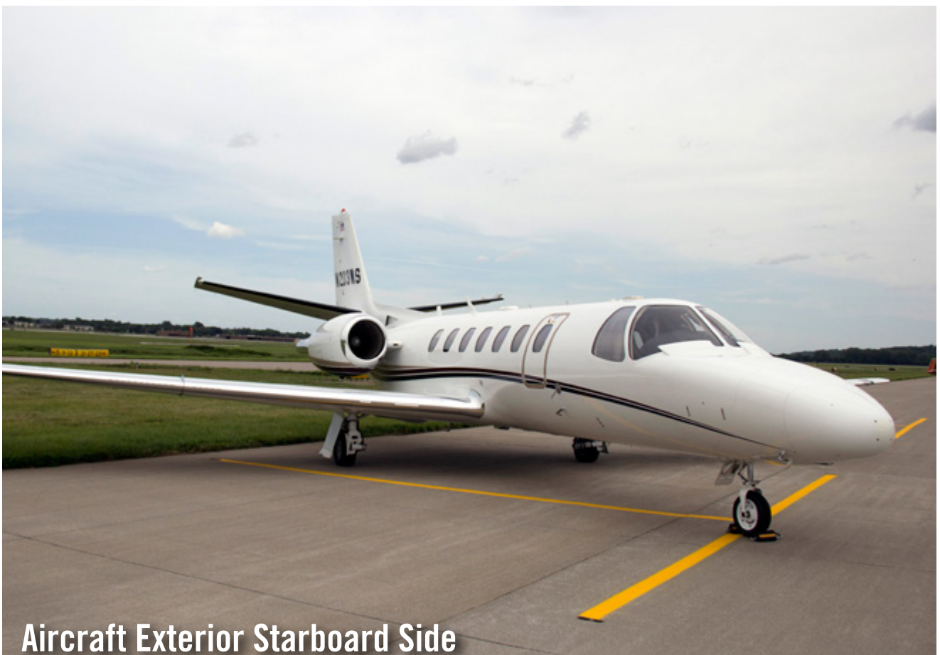
Aircraft Exterior Starboard Side