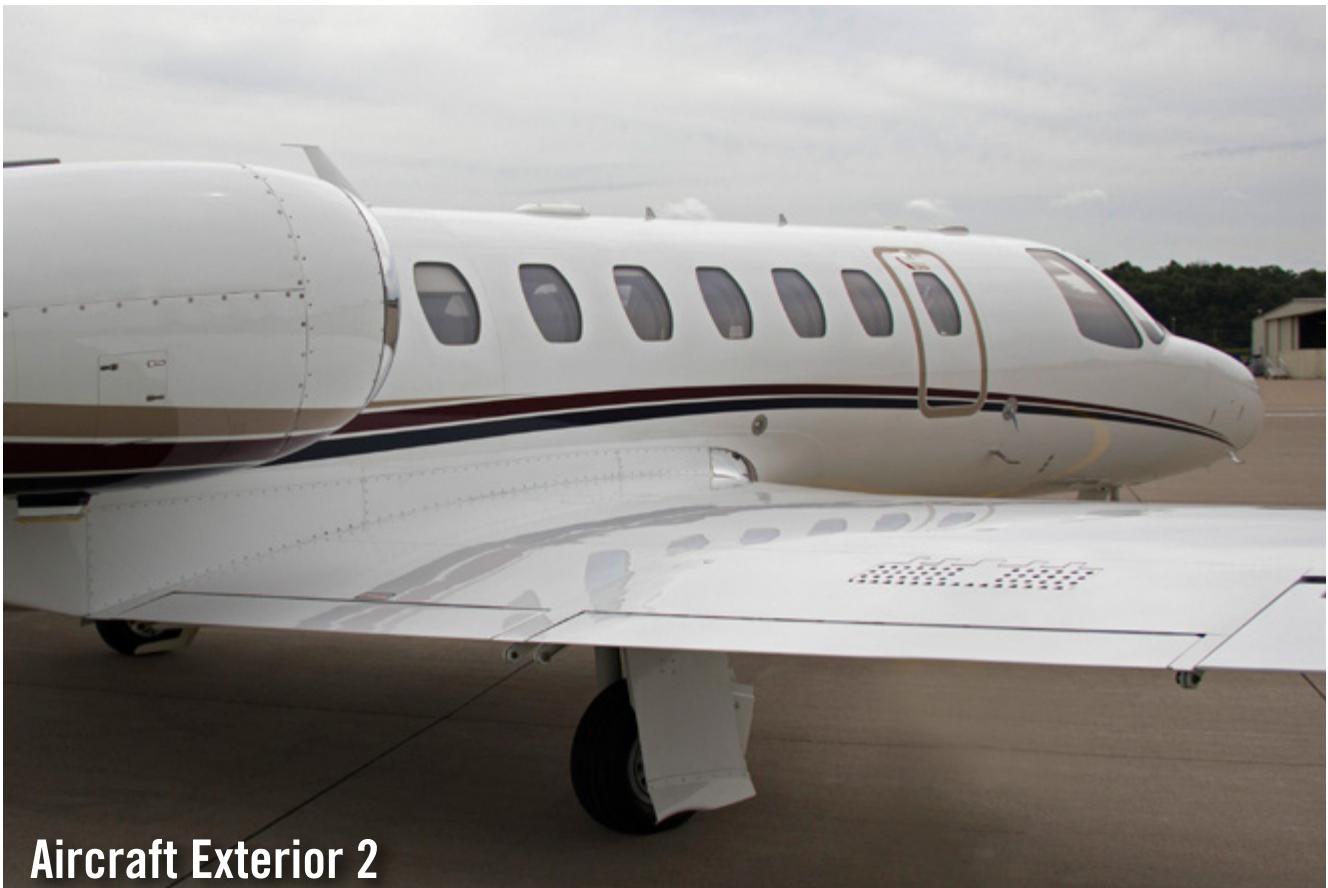
Aircraft Exterior 2