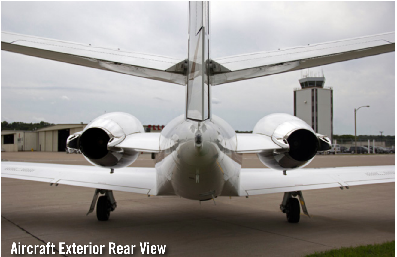
Aircraft Exterior Rear View