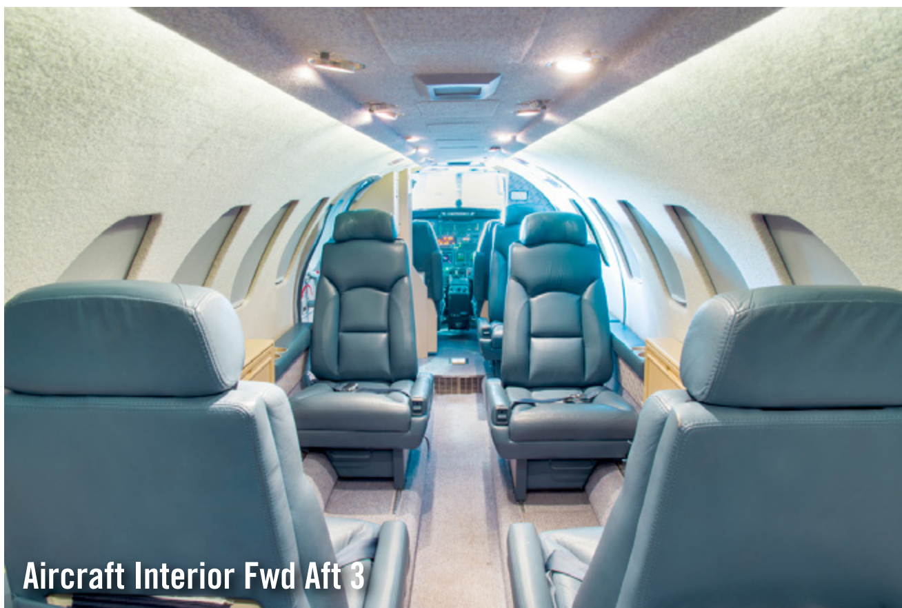
Aircraft Interior Fwd Aft 3