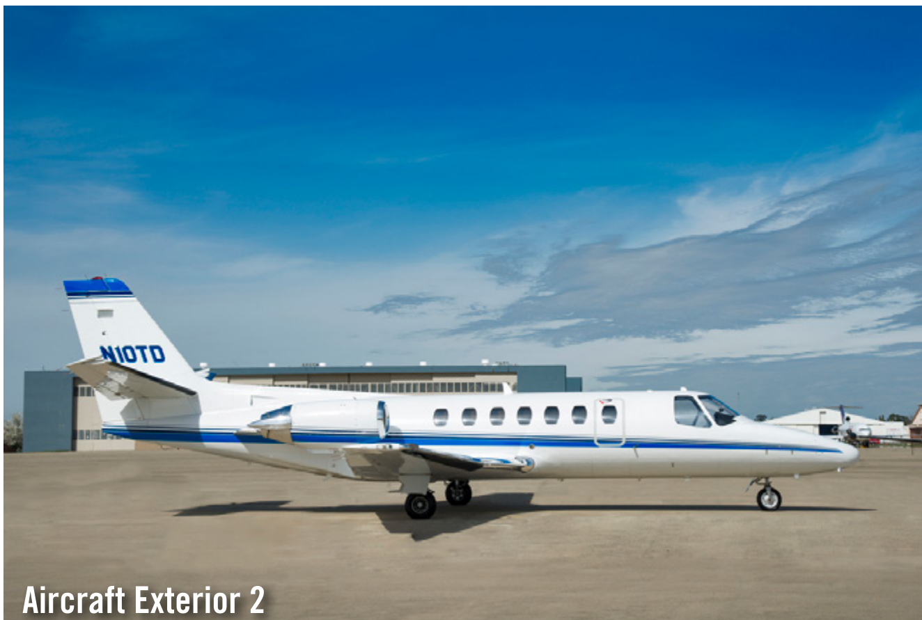
Aircraft Exterior 2