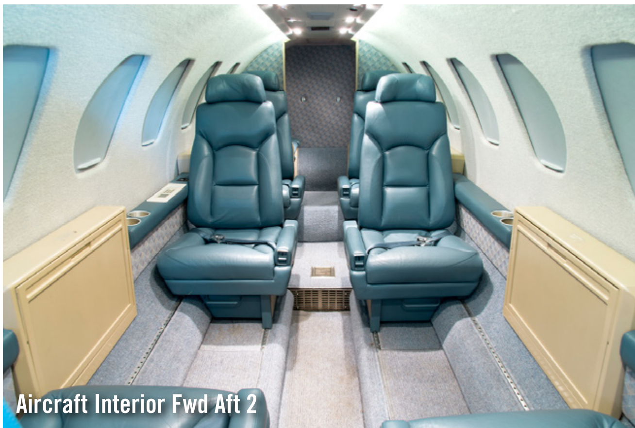
Aircraft Interior Fwd Aft 2