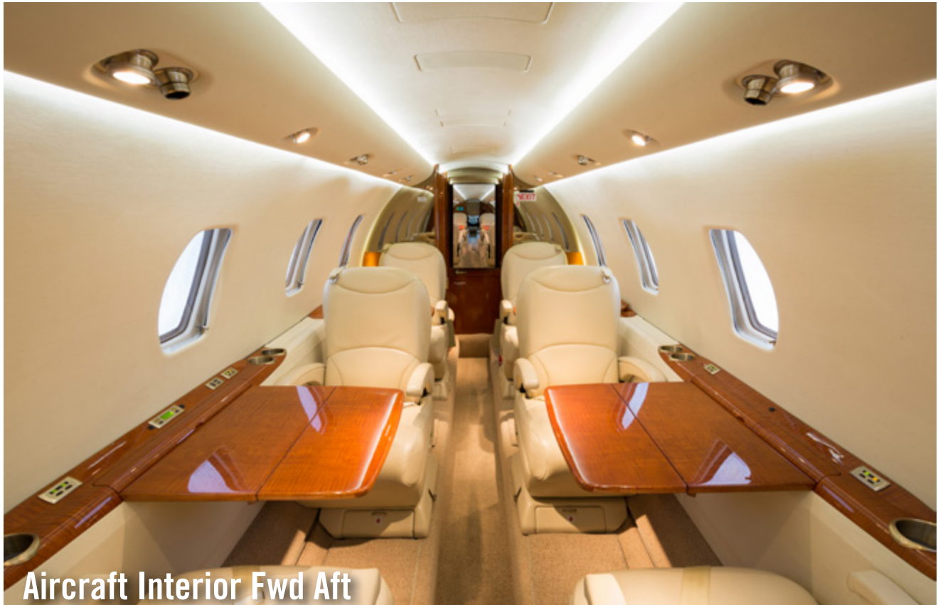
Aircraft Interior Fwd Aft