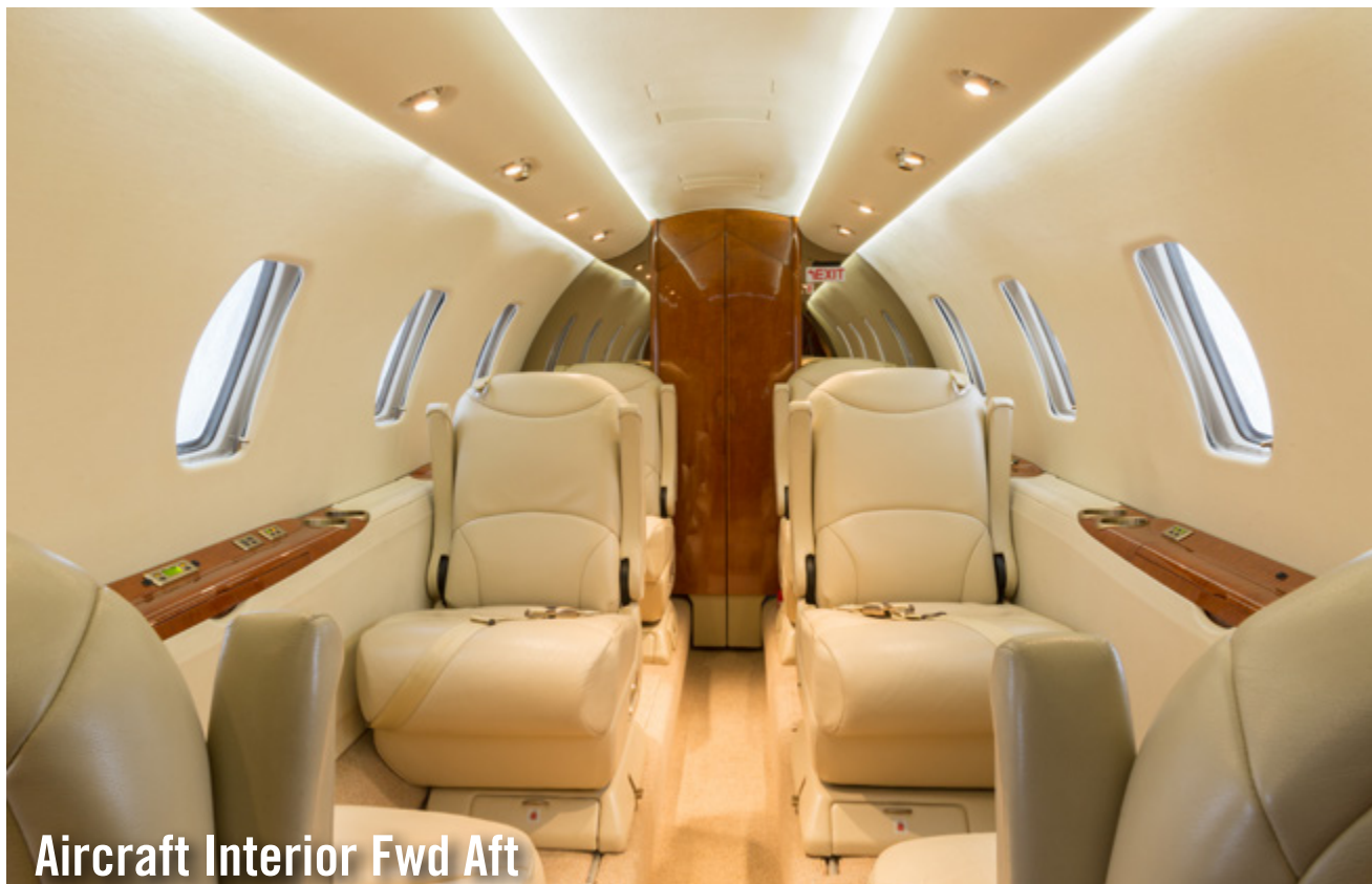
Aircraft Interior Fwd Aft