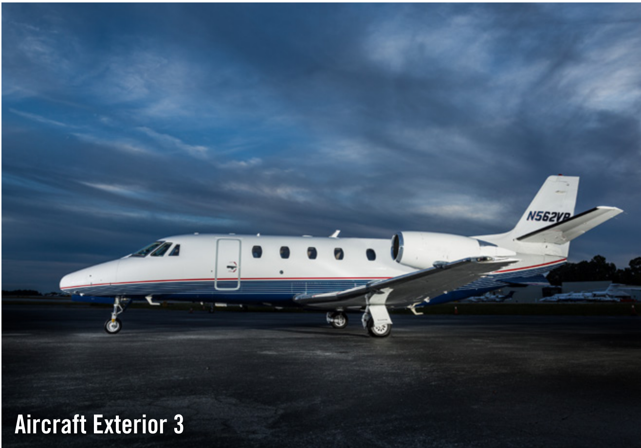
Aircraft Exterior 3