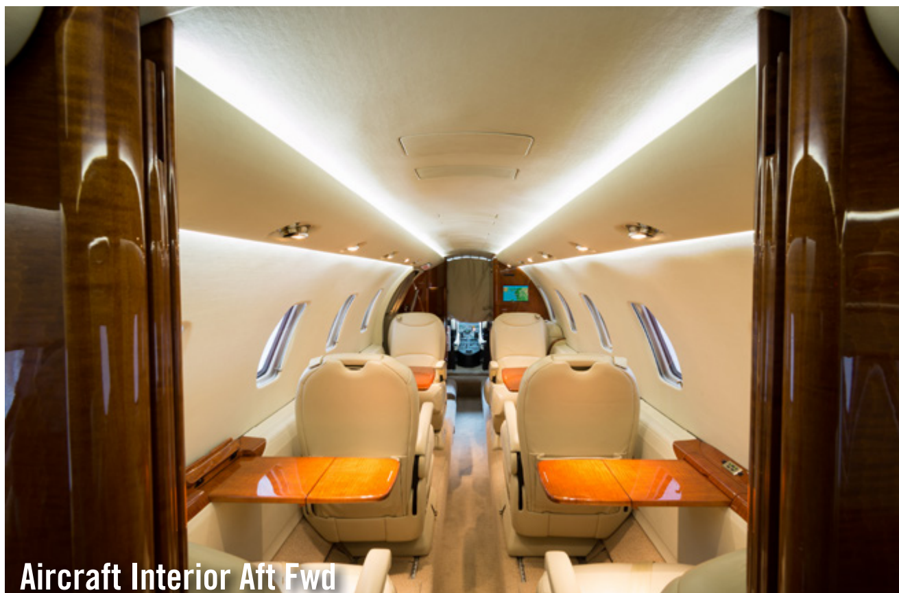
Aircraft Interior Aft Fwd