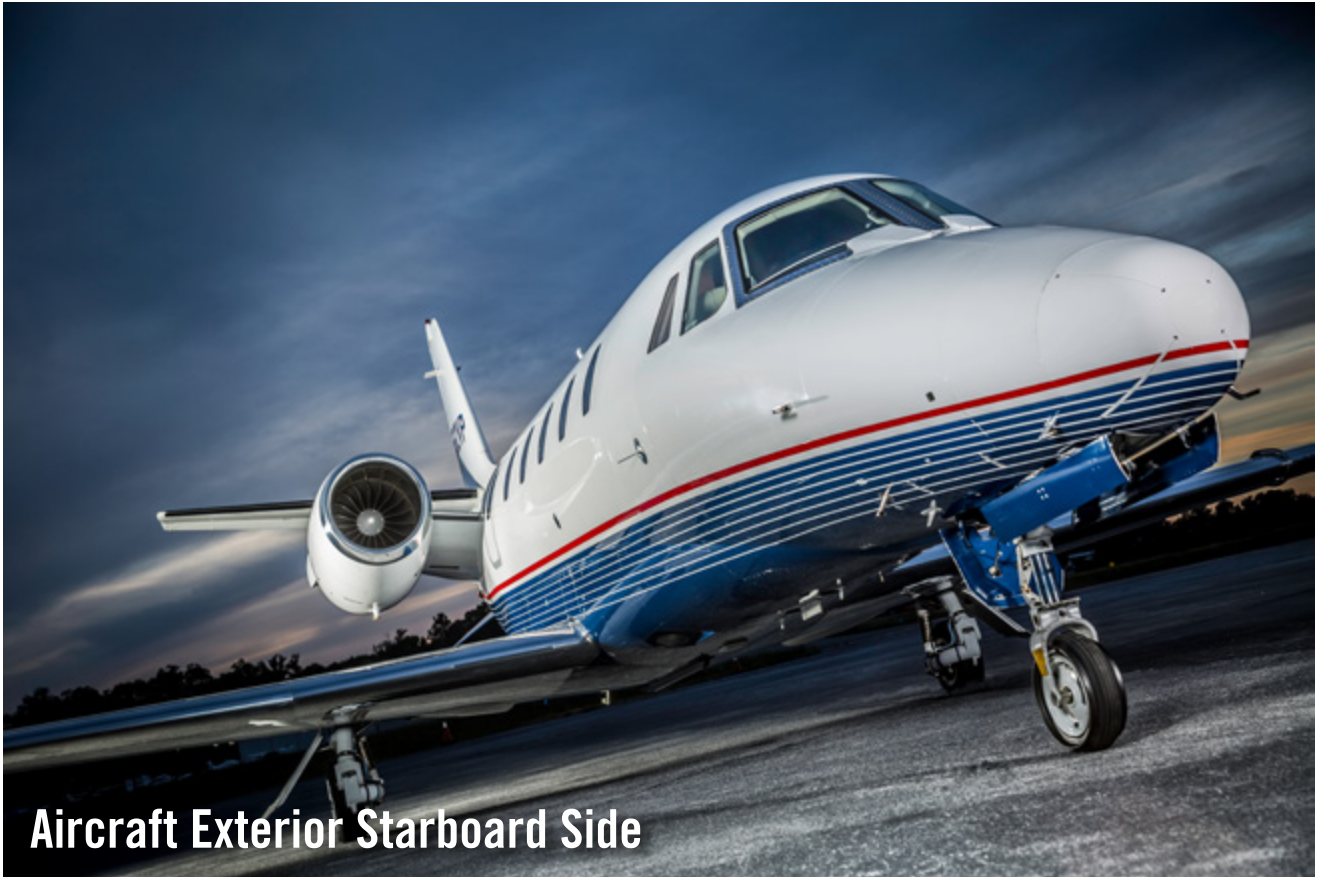
Aircraft Exterior Starboard Side