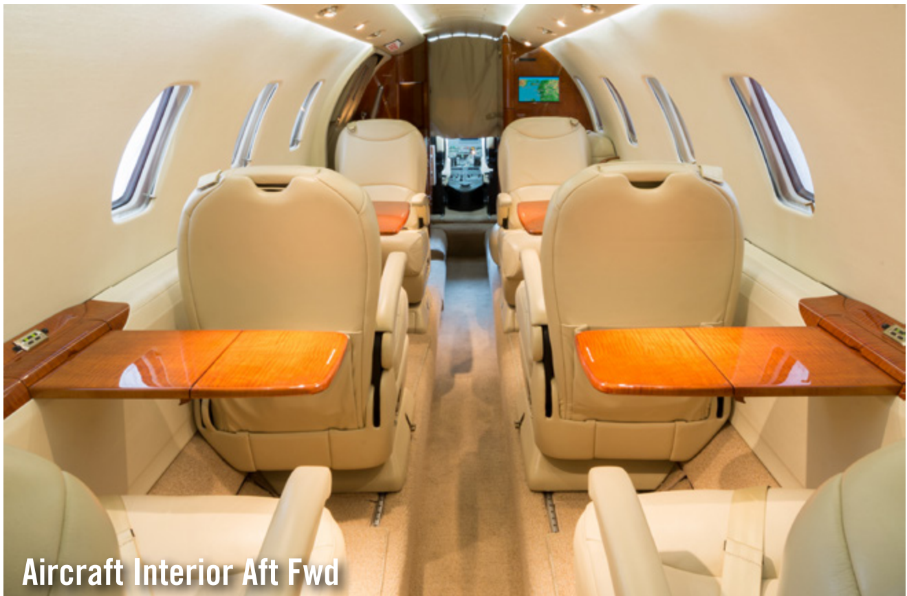
Aircraft Interior Aft Fwd