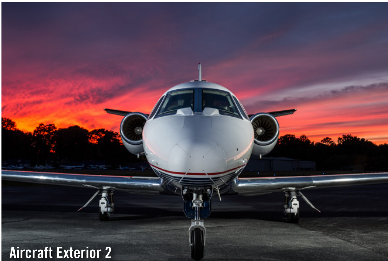
Aircraft Exterior 2