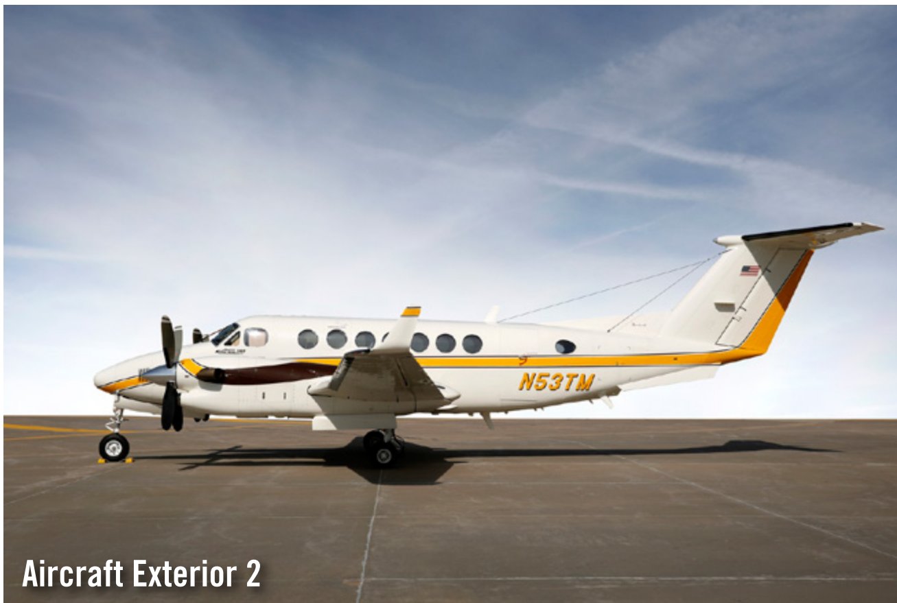
Aircraft Exterior 2