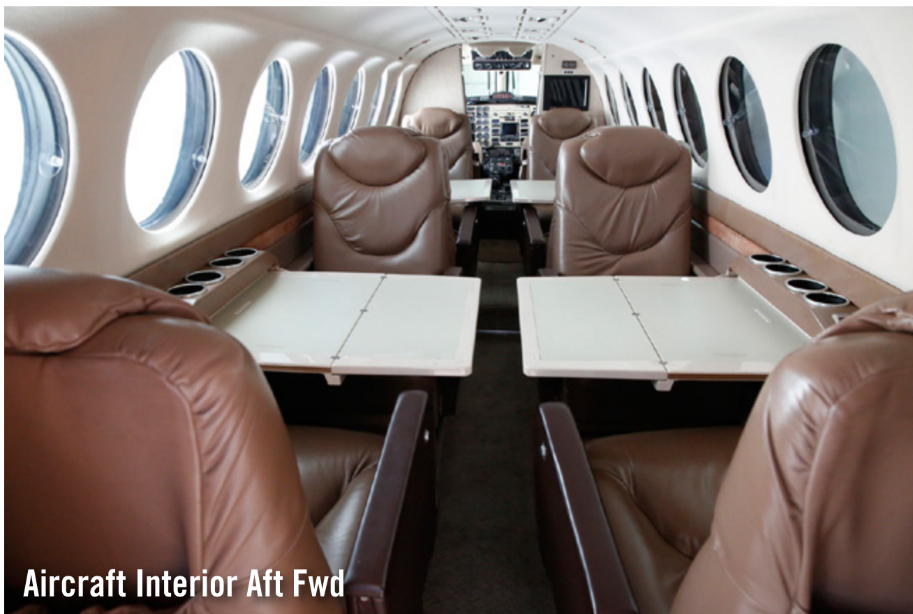
Aircraft Interior Aft Fwd