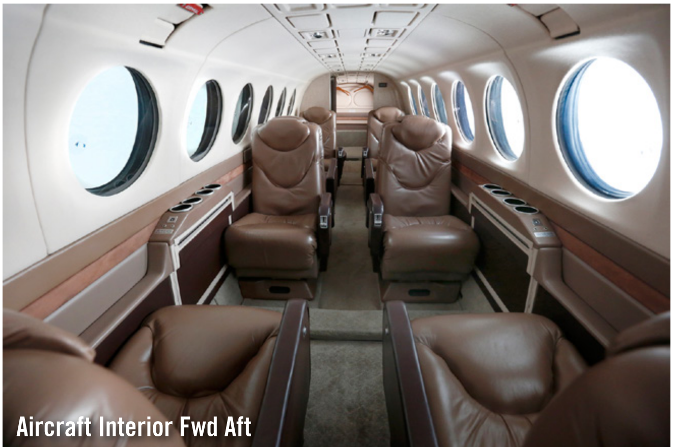
Aircraft Interior Fwd Aft