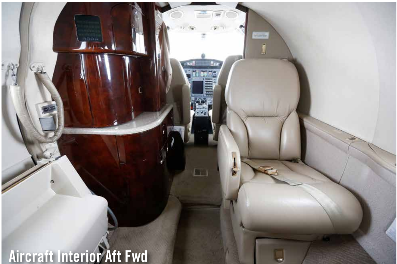
Aircraft Interior Aft Fwd