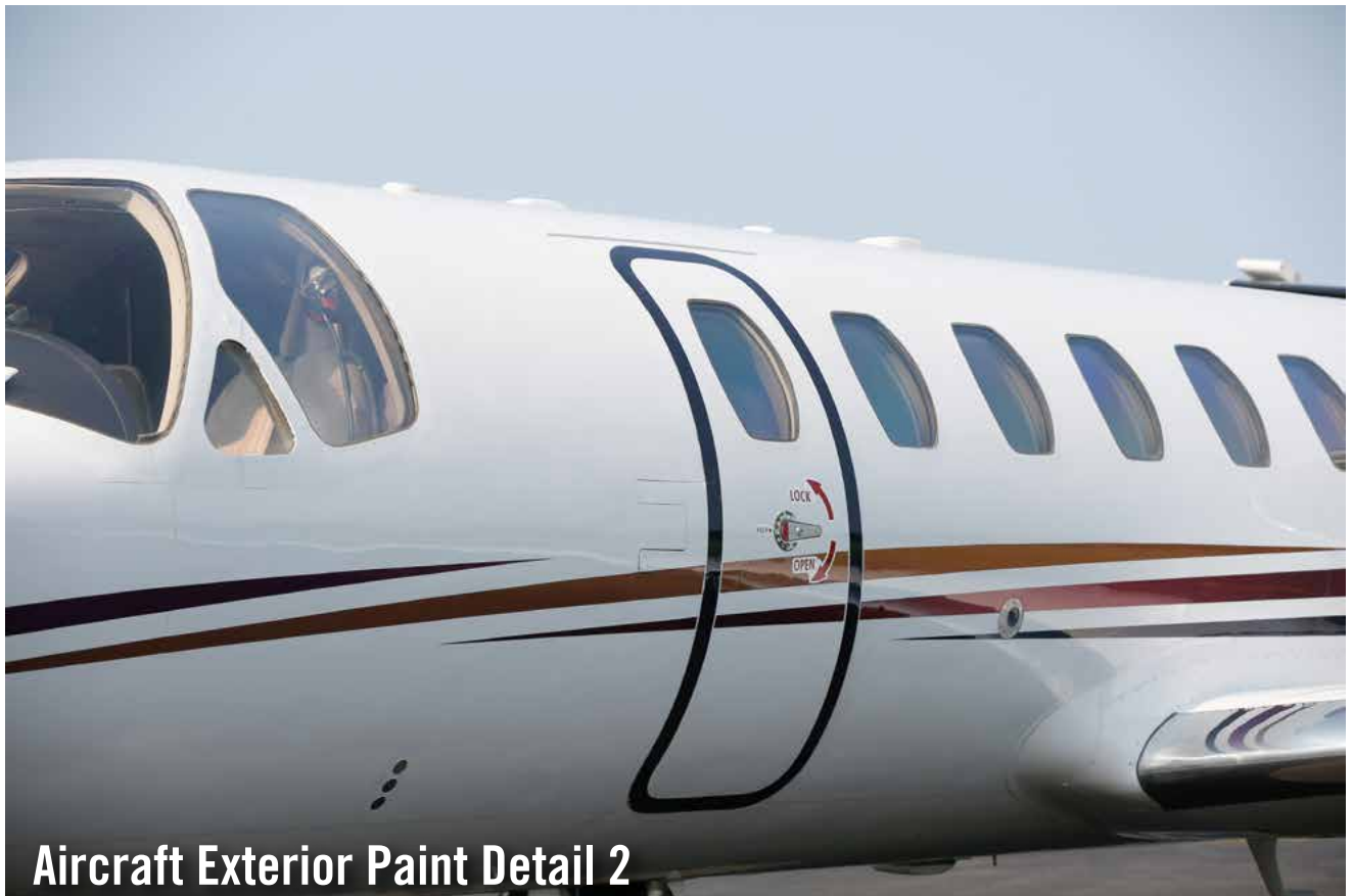
Aircraft Exterior Paint Detail 2