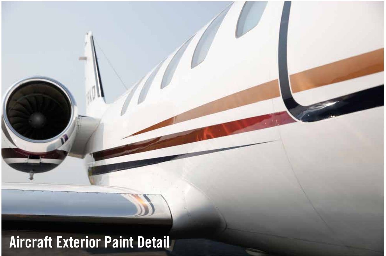
Aircraft Exterior Paint Detail