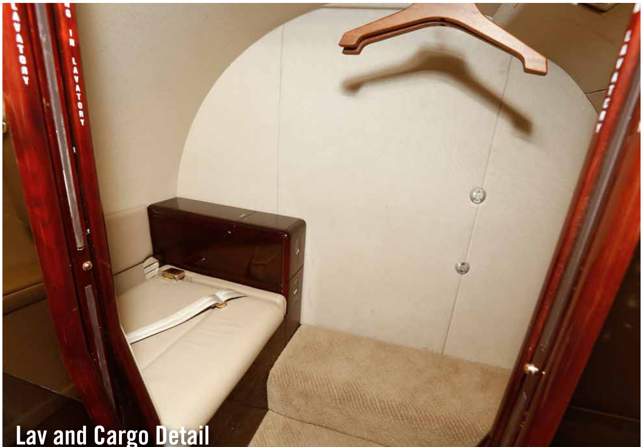
Lav and Cargo Detail