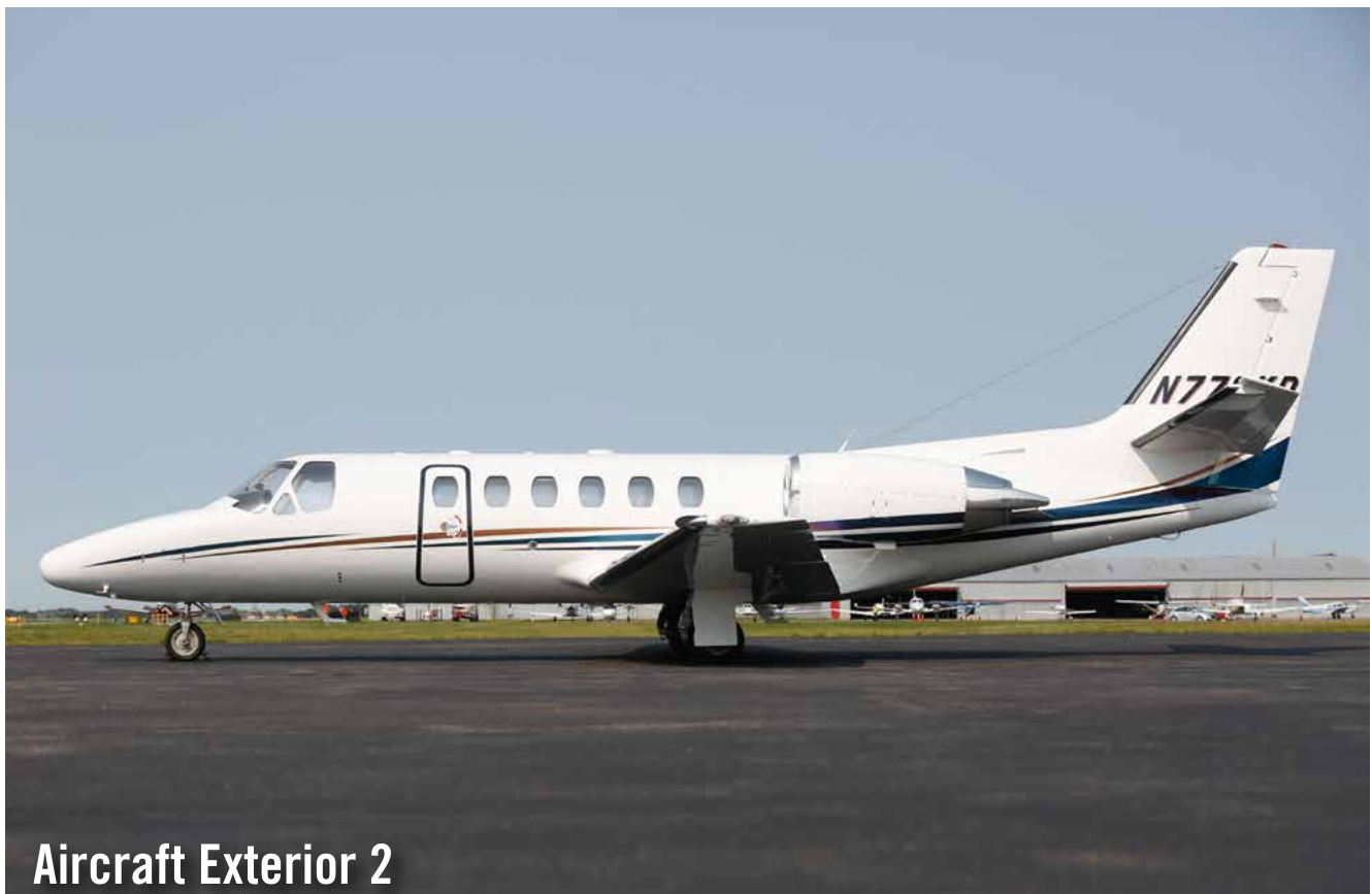
Aircraft Exterior 2