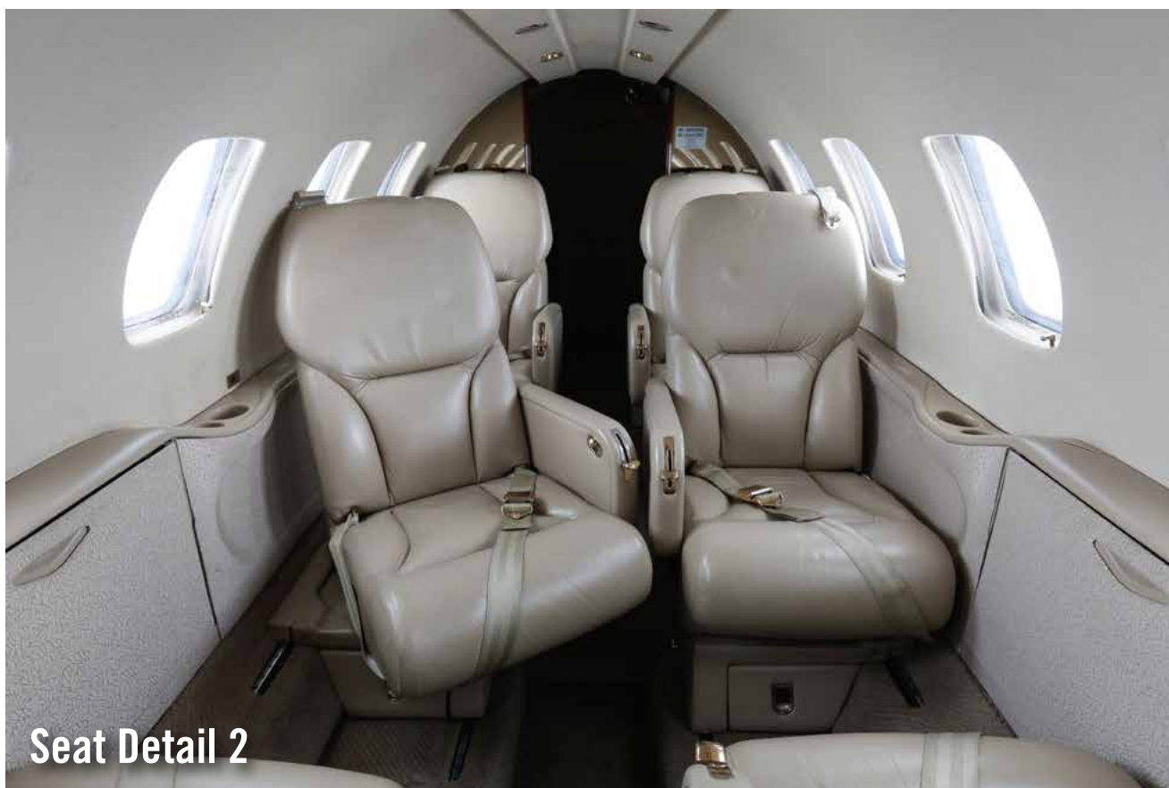
Seat Detail 2