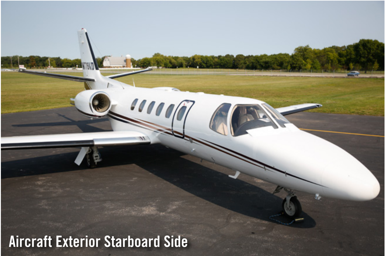
Aircraft Exterior Starboard Side