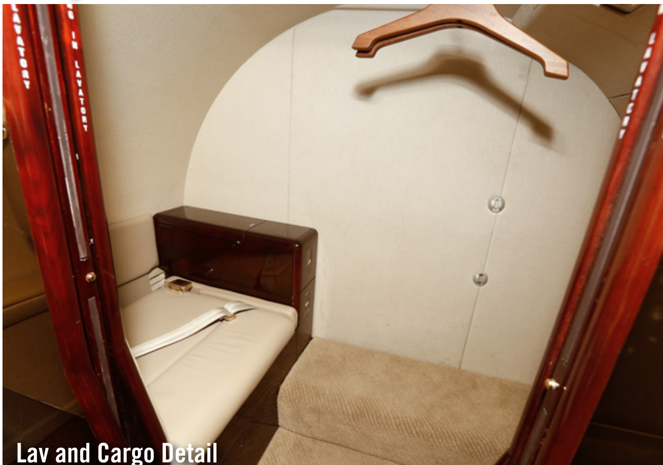
Lav and Cargo Detail