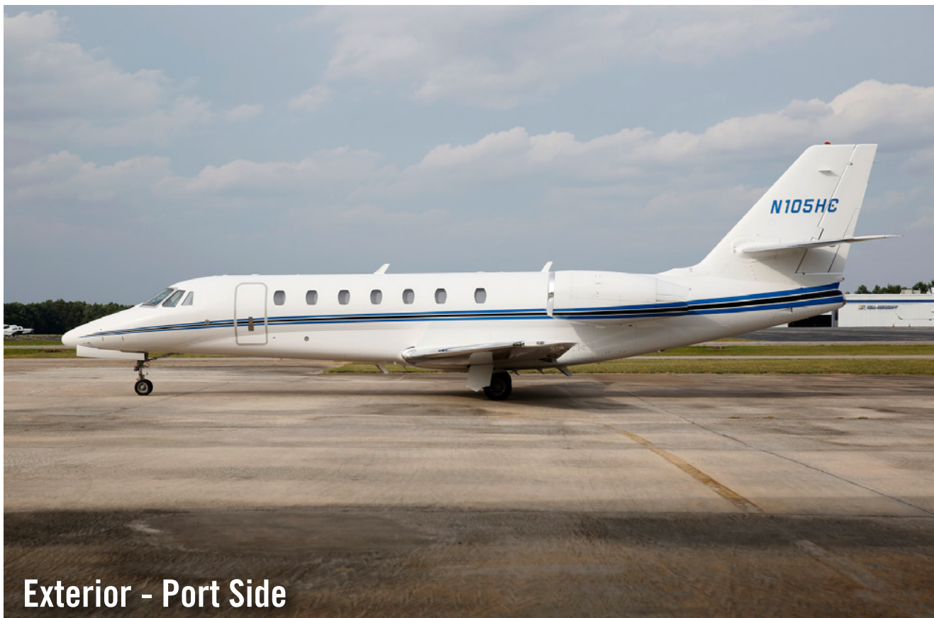
Exterior - Port Side