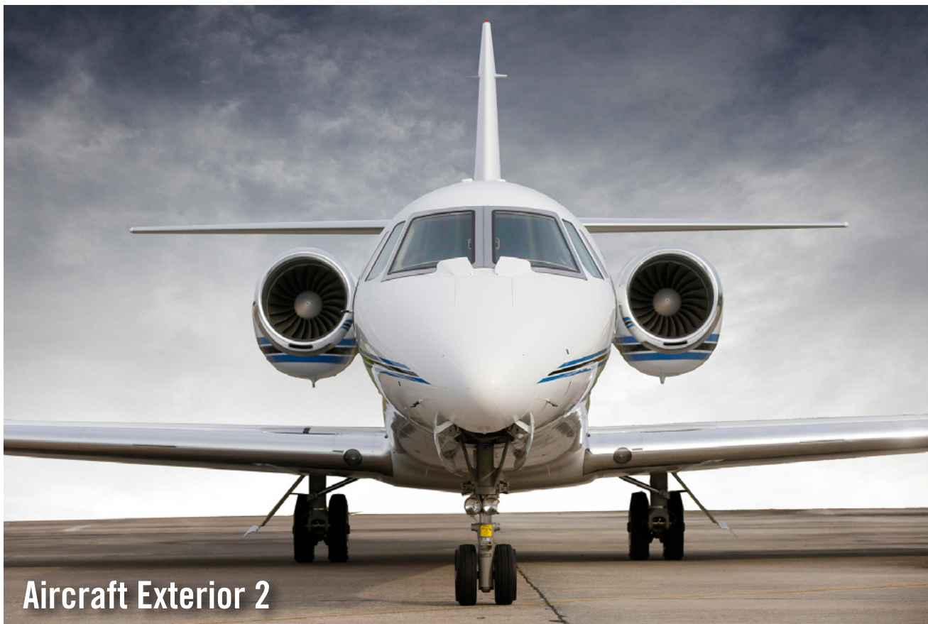
Aircraft Exterior 2