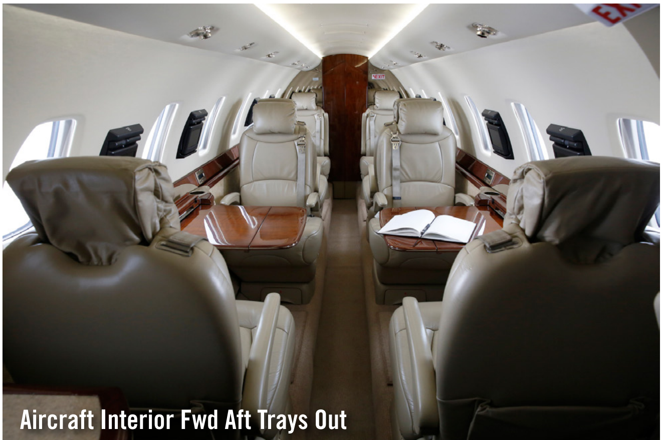
Aircraft Interior Fwd Aft Trays Out