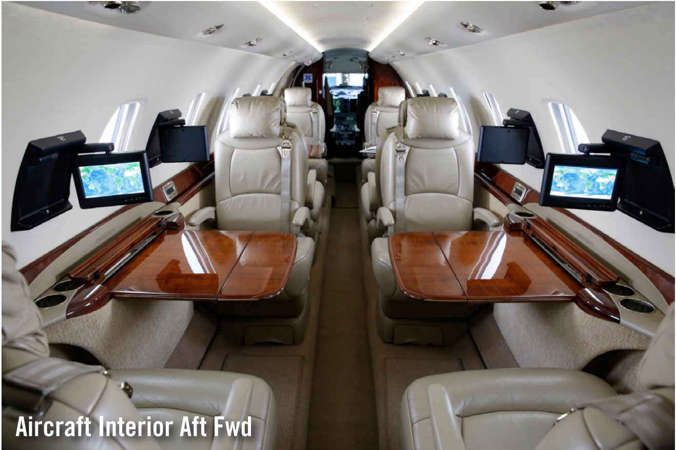
Aircraft Interior Aft Fwd