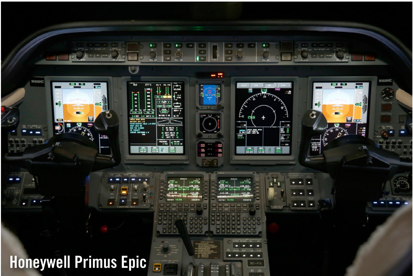
Honeywell Primus Epic