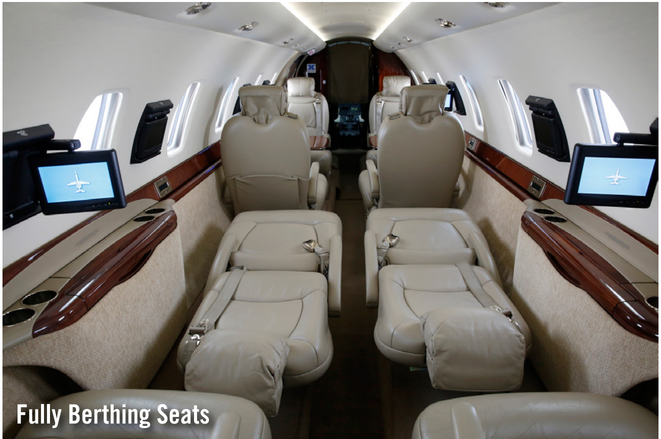
Fully Berthing Seats