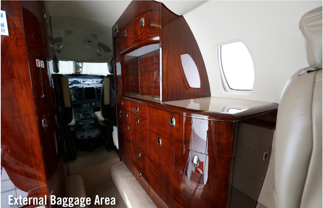
External Baggage Area