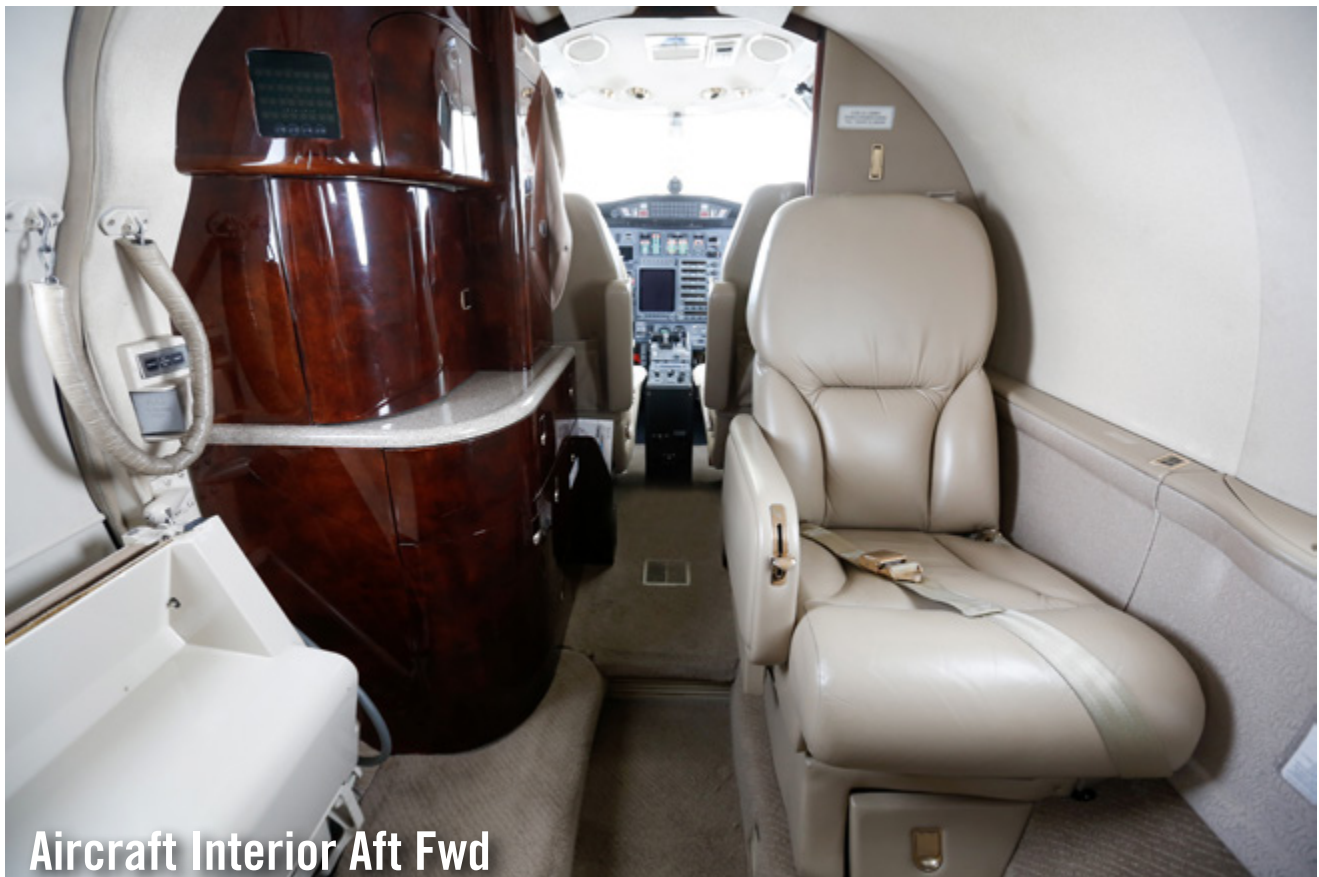
Aircraft Interior Aft Fwd