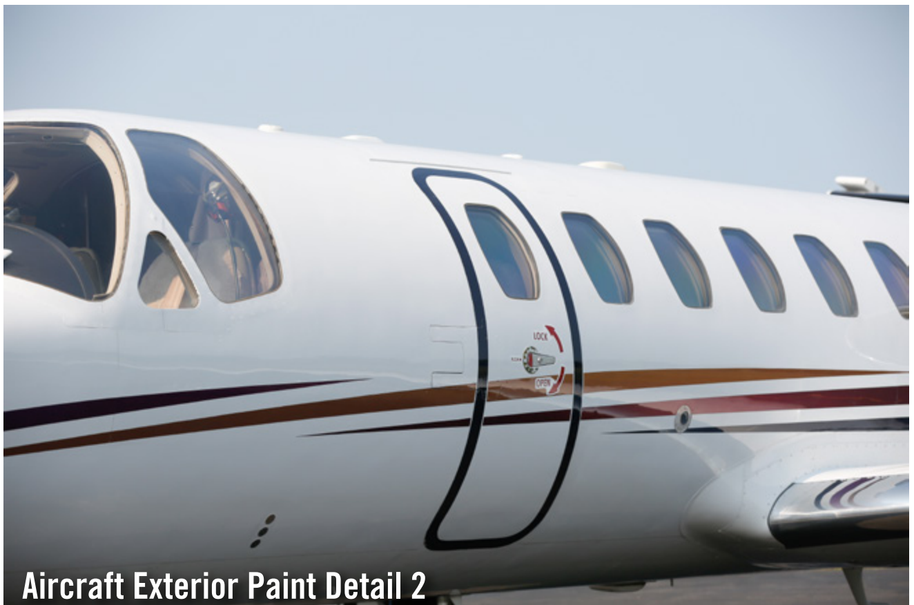
Aircraft Exterior Paint Detail 2