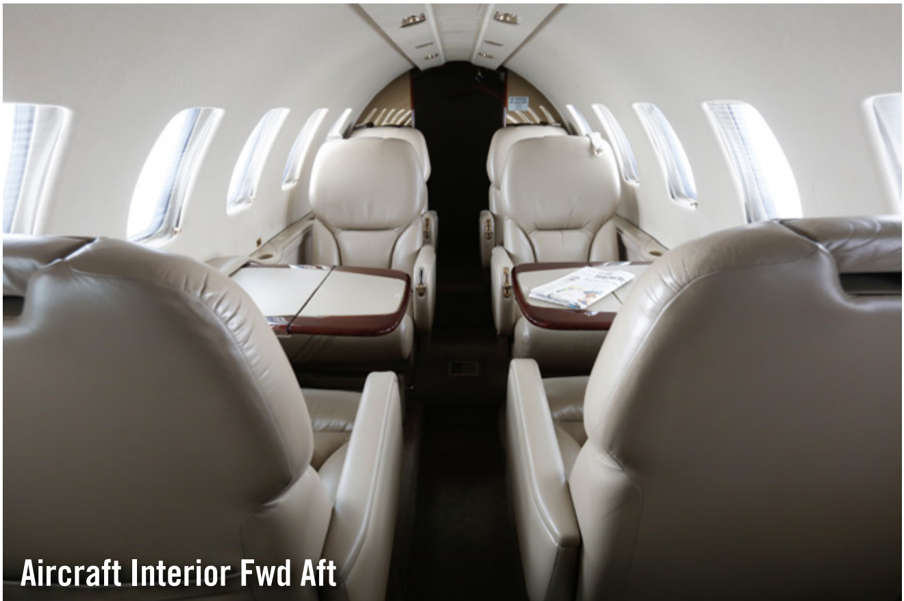
Aircraft Interior Fwd Aft