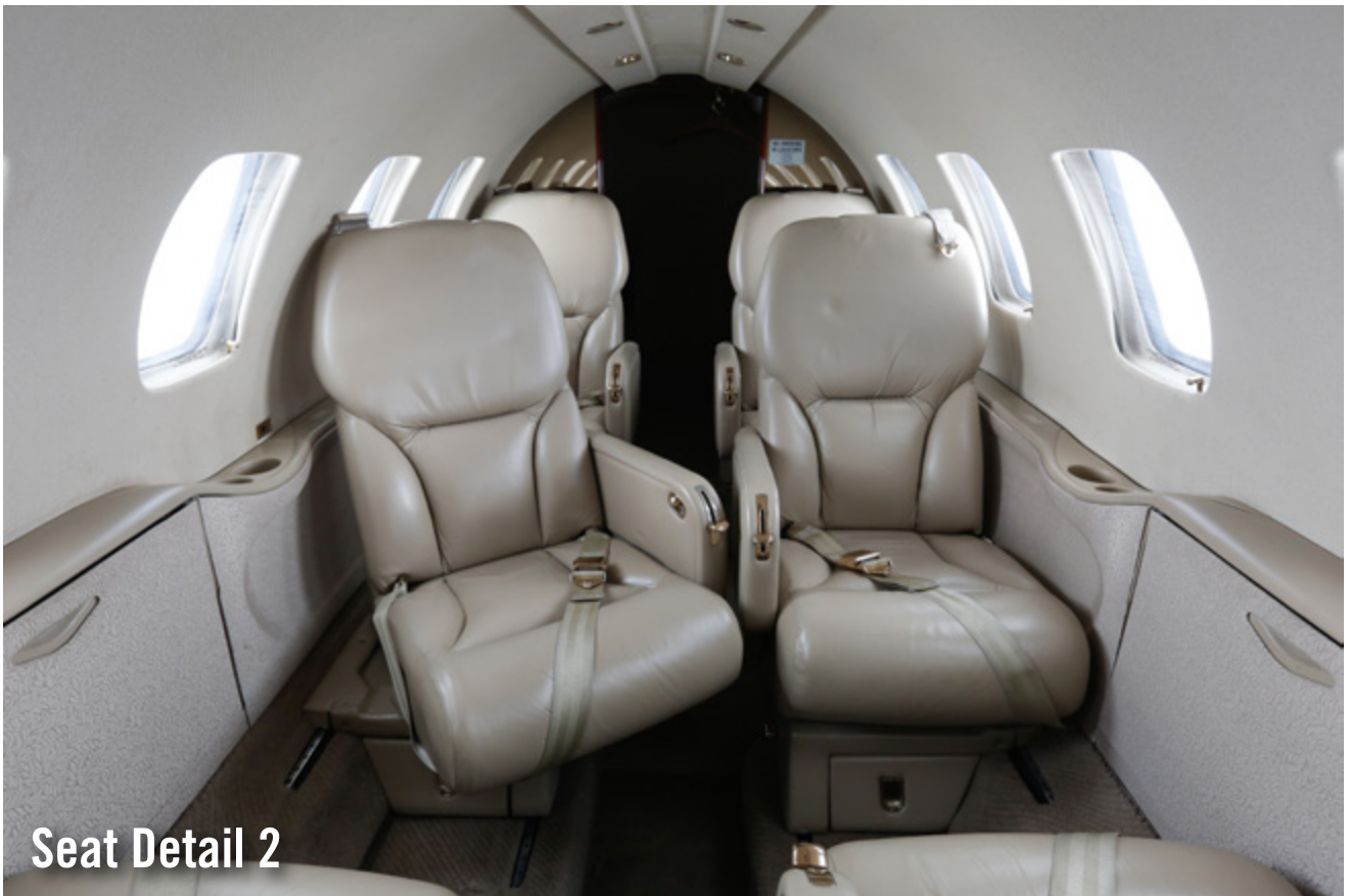
Seat Detail 2