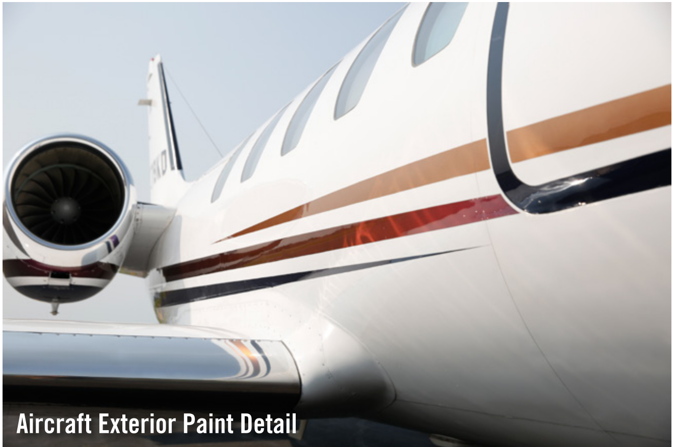
Aircraft Exterior Paint Detail