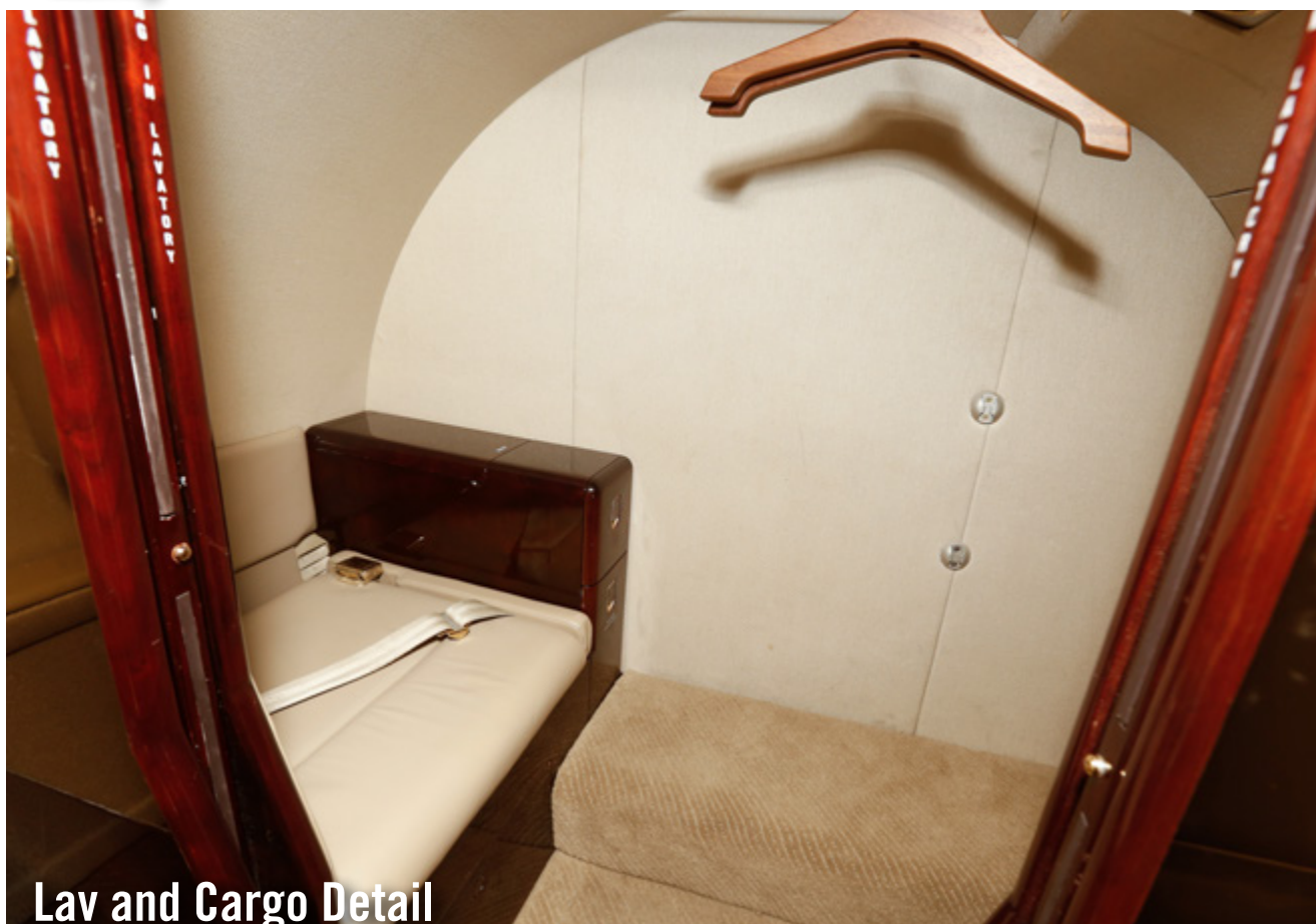
Lav and Cargo Detail