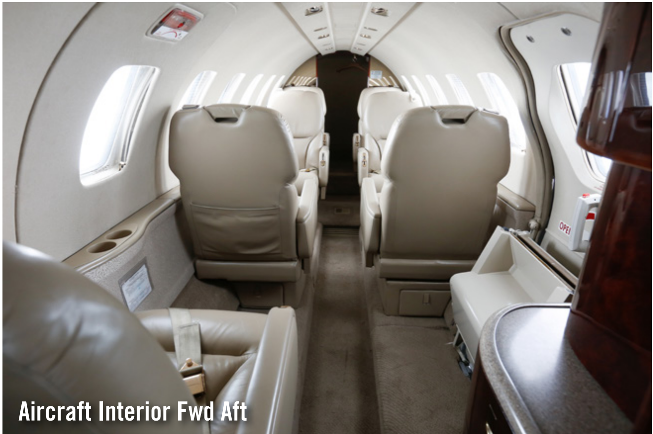
Aircraft Interior Fwd Aft