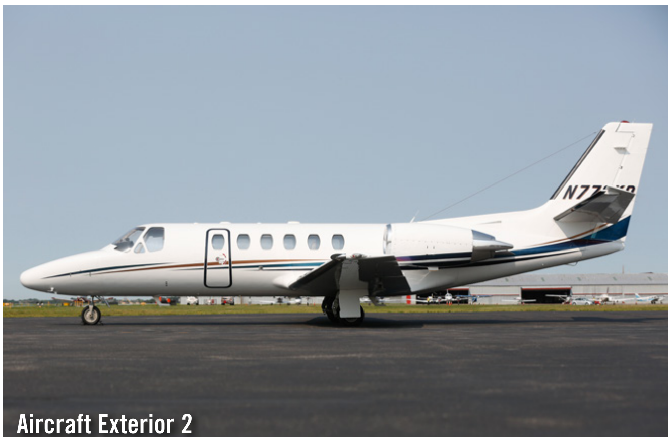
Aircraft Exterior 2