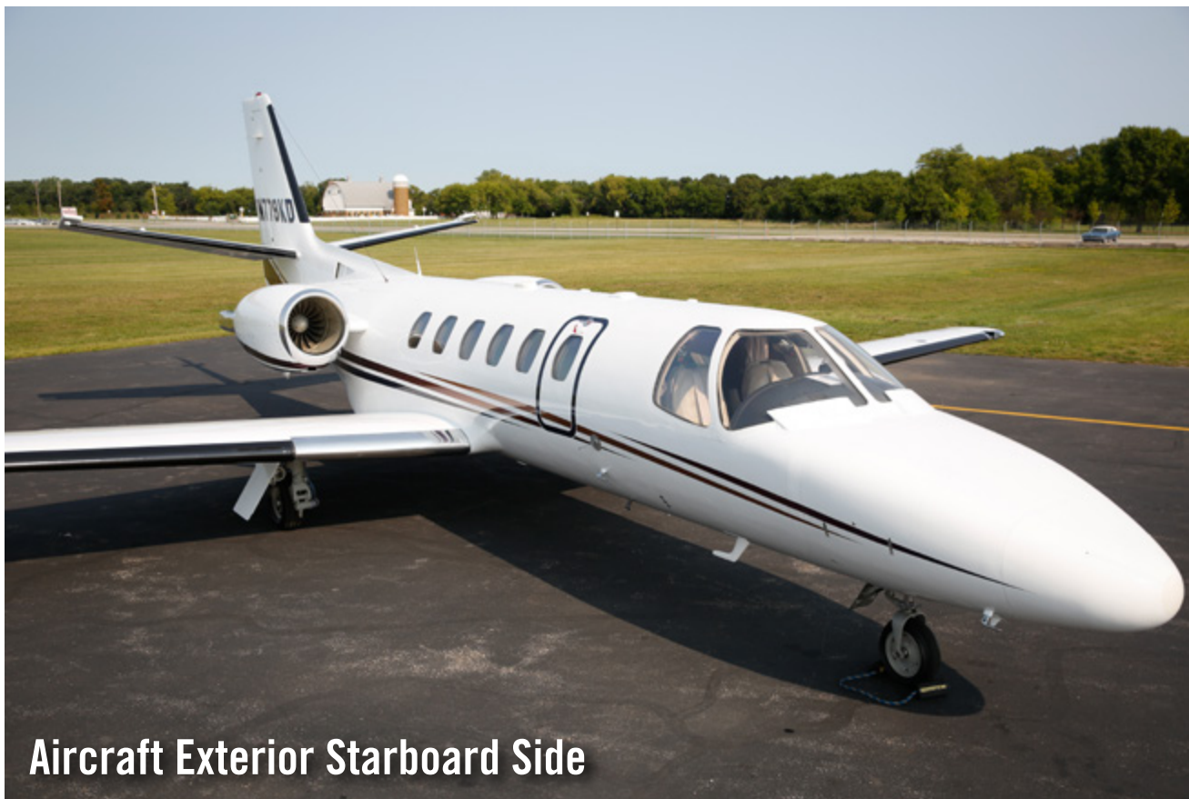
Aircraft Exterior Starboard Side