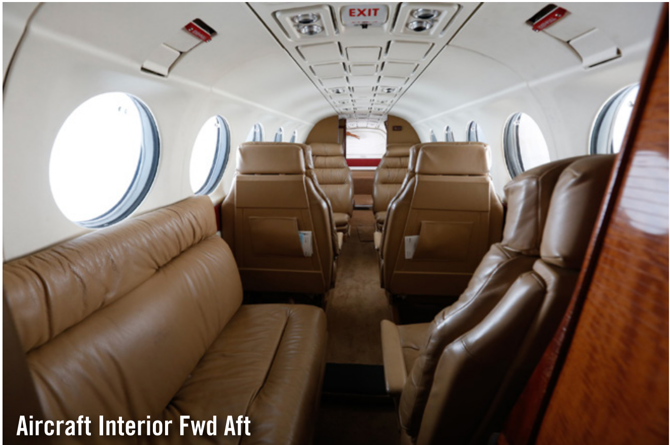
Aircraft Interior Fwd Aft