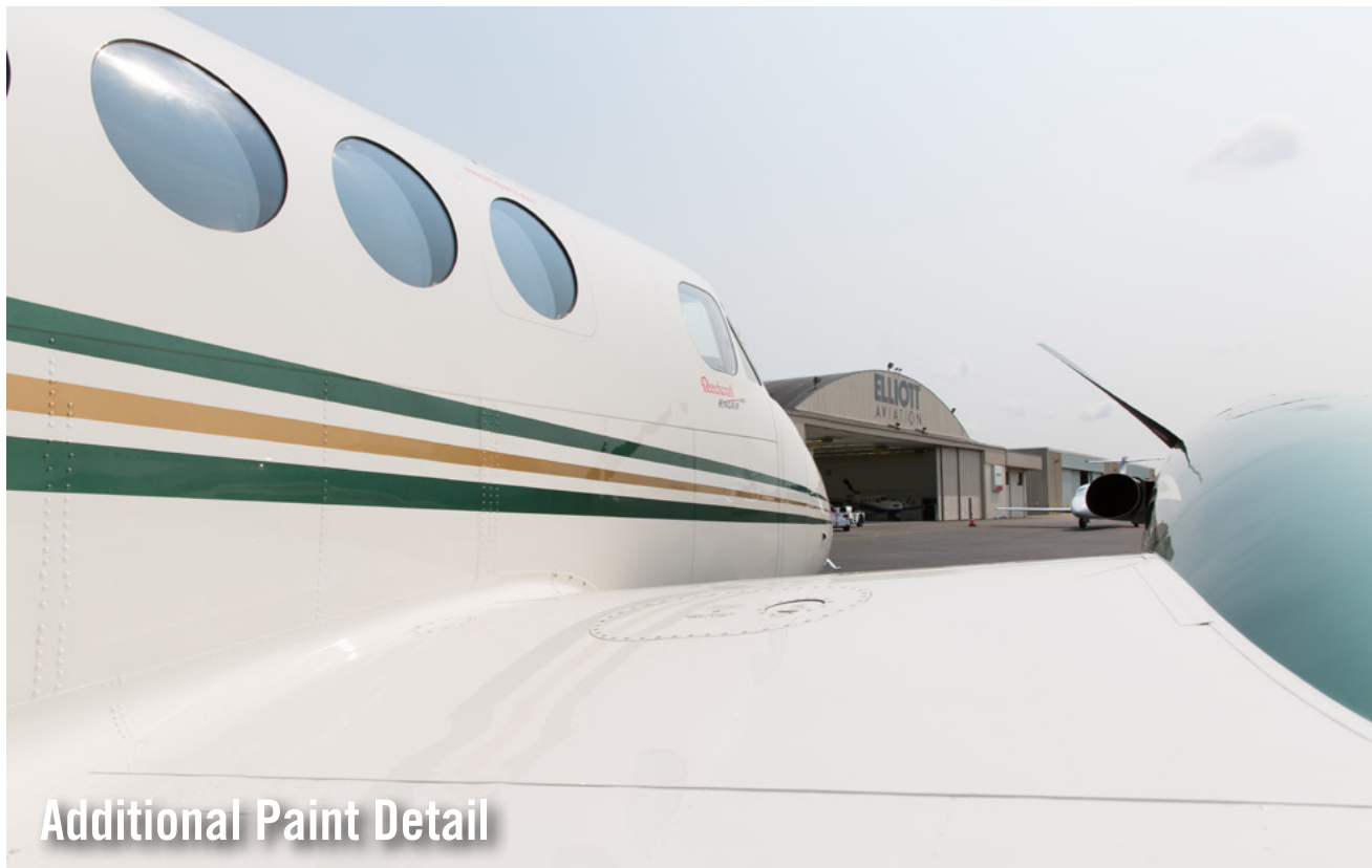
Additional Paint Detail