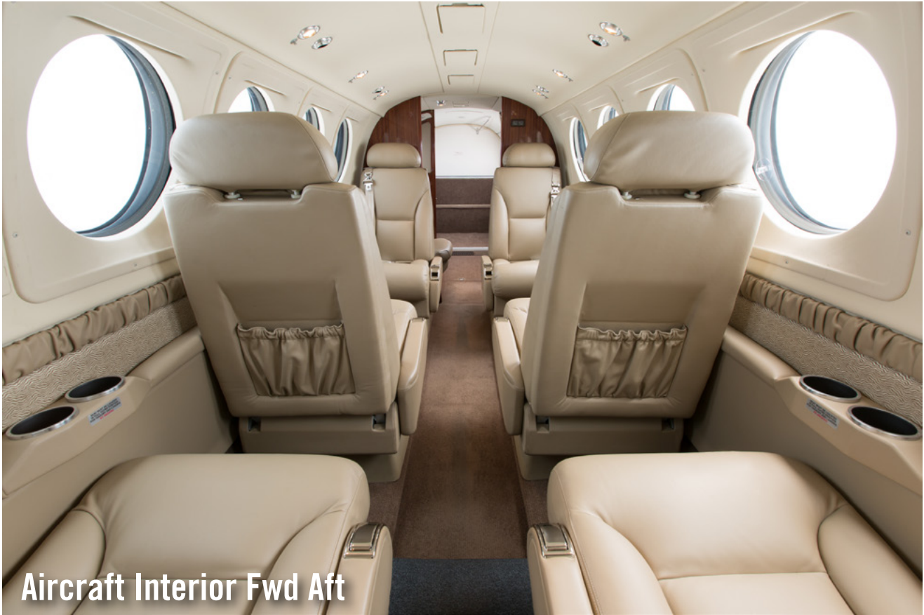
Aircraft Interior Fwd Aft