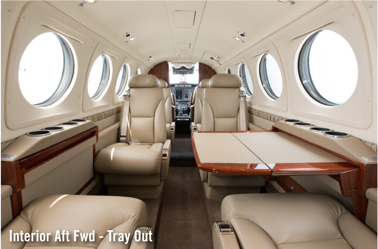
Interior Aft Fwd - Tray Out