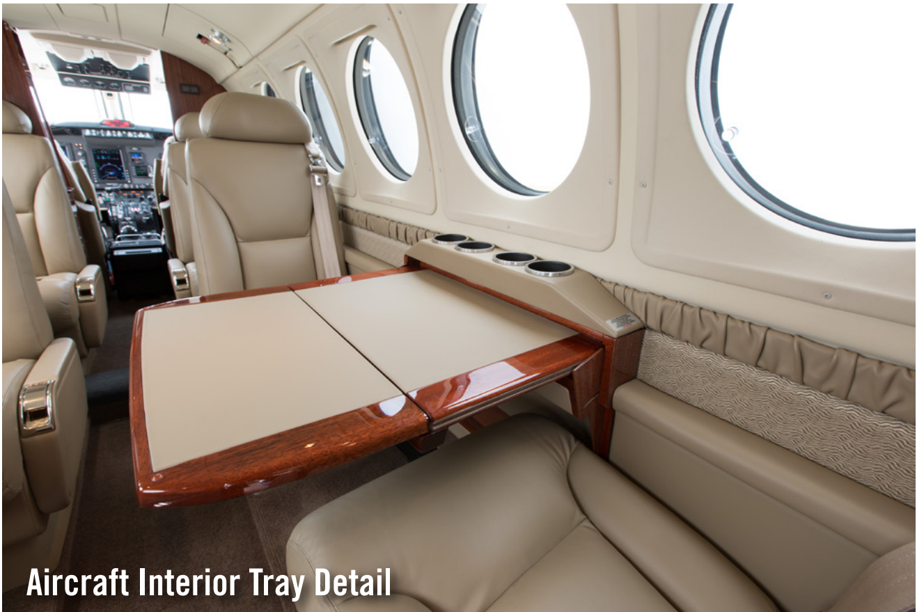
Aircraft Interior Tray Detail