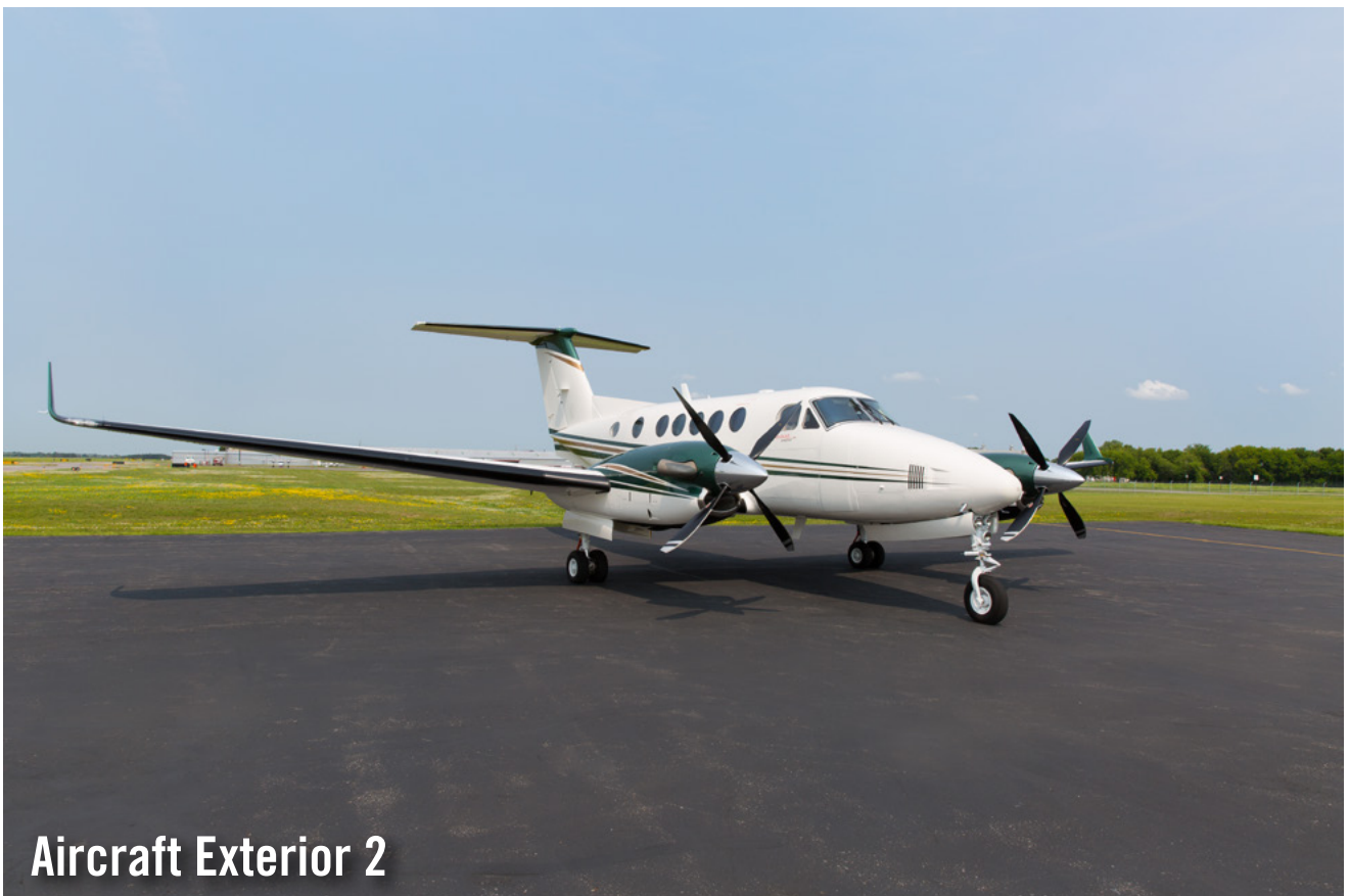
Aircraft Exterior 2