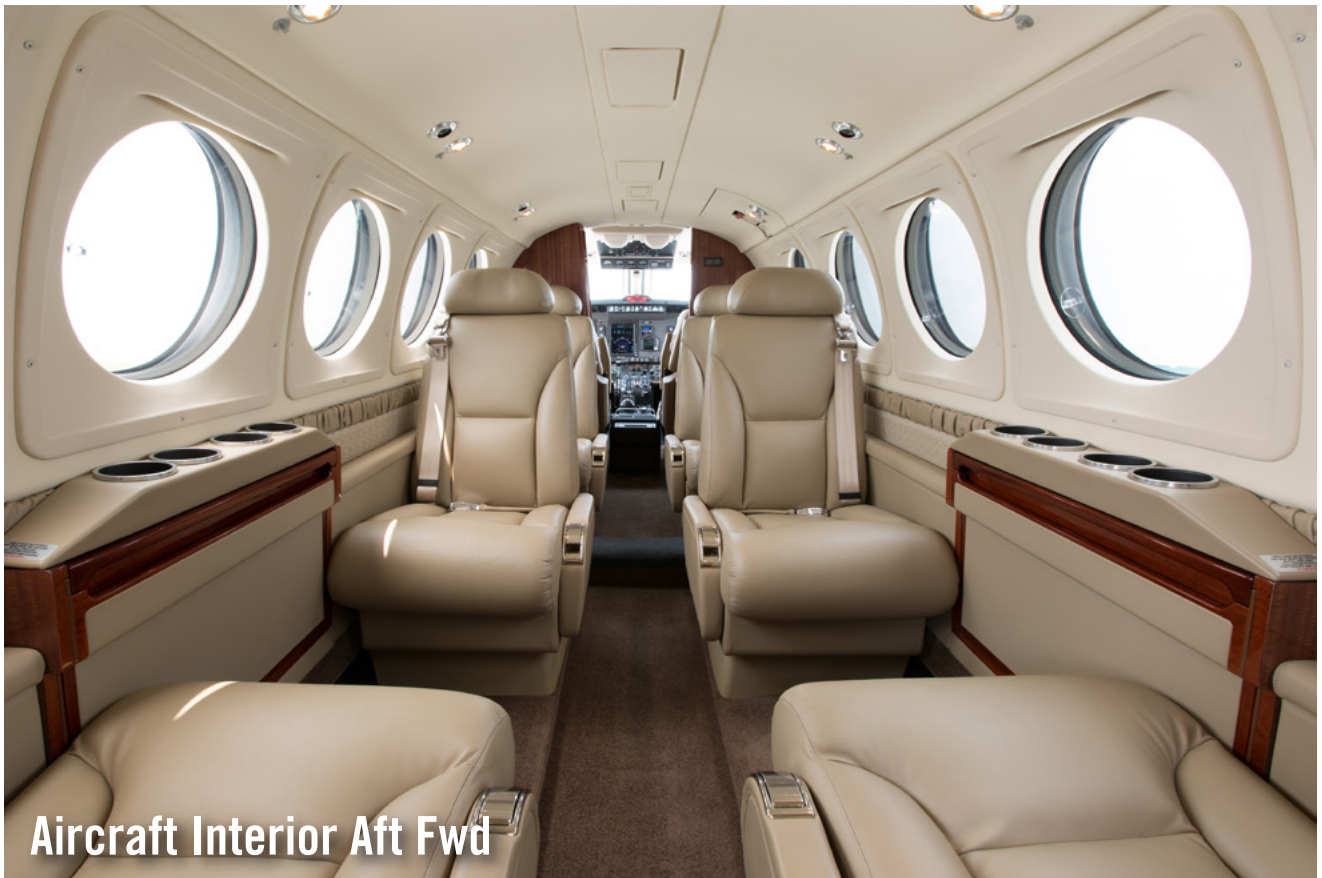
Aircraft Interior Aft Fwd