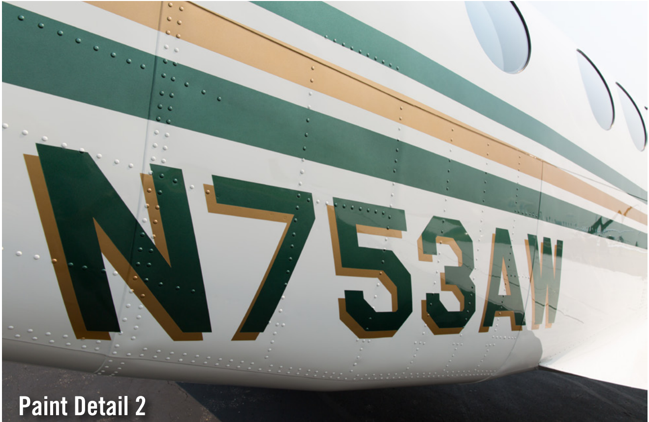
Paint Detail 2