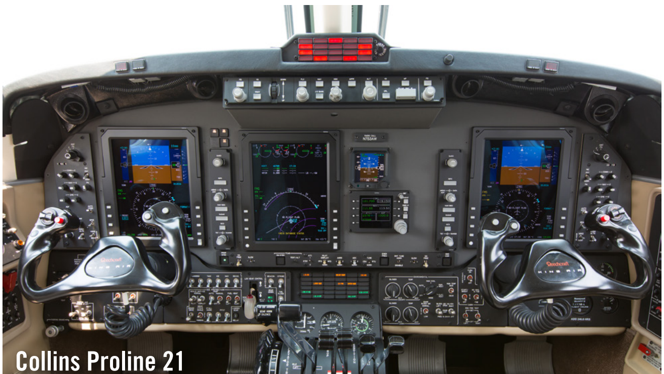
Collins Proline 21