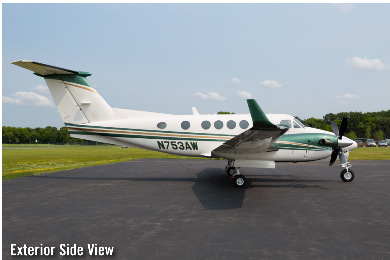
Exterior Side View