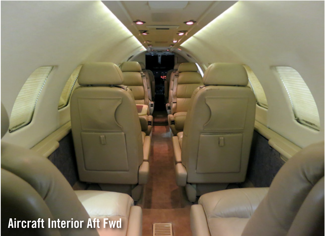
Aircraft Interior Aft Fwd