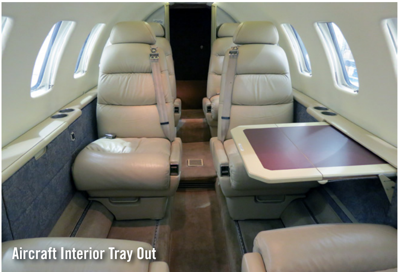
Aircraft Interior Tray Out