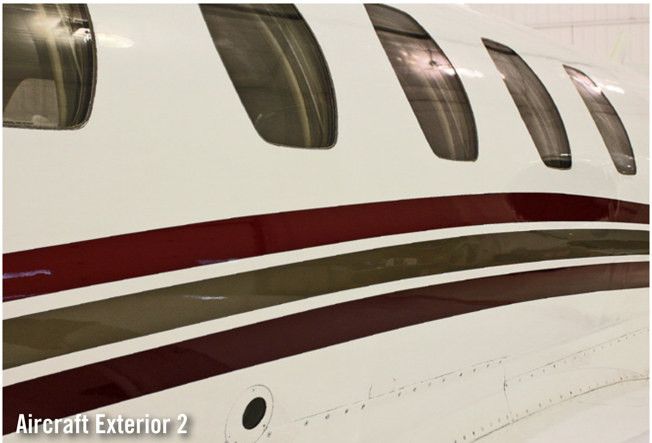
Aircraft Exterior 2