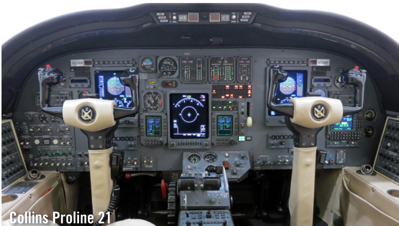
Collins Proline 21