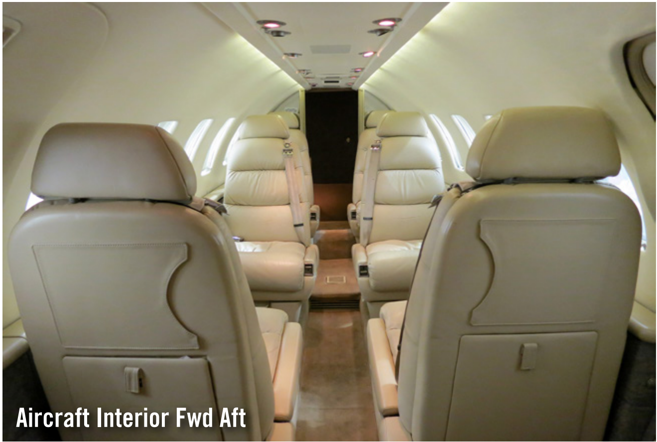
Aircraft Interior Fwd Aft