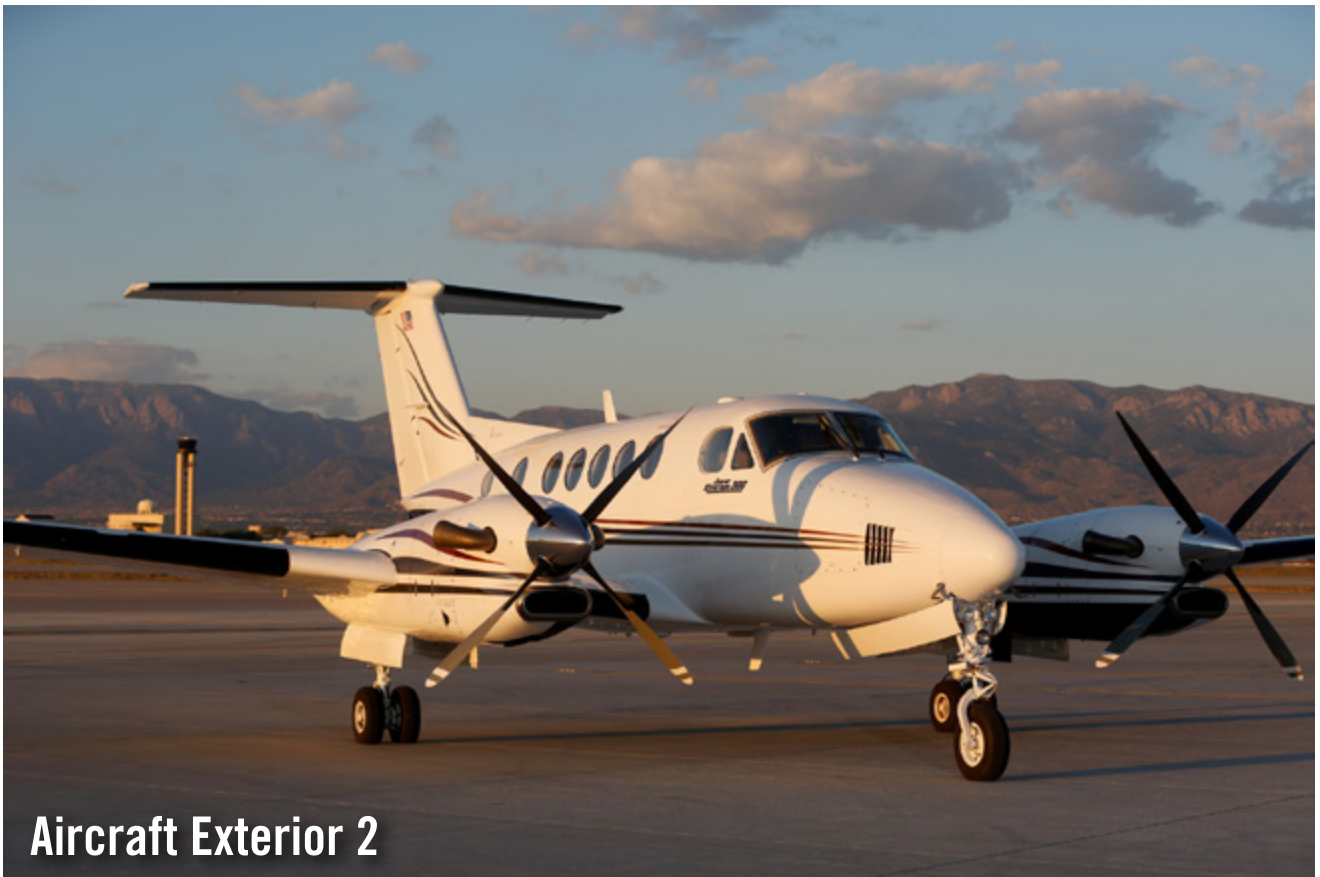
Aircraft Exterior 2