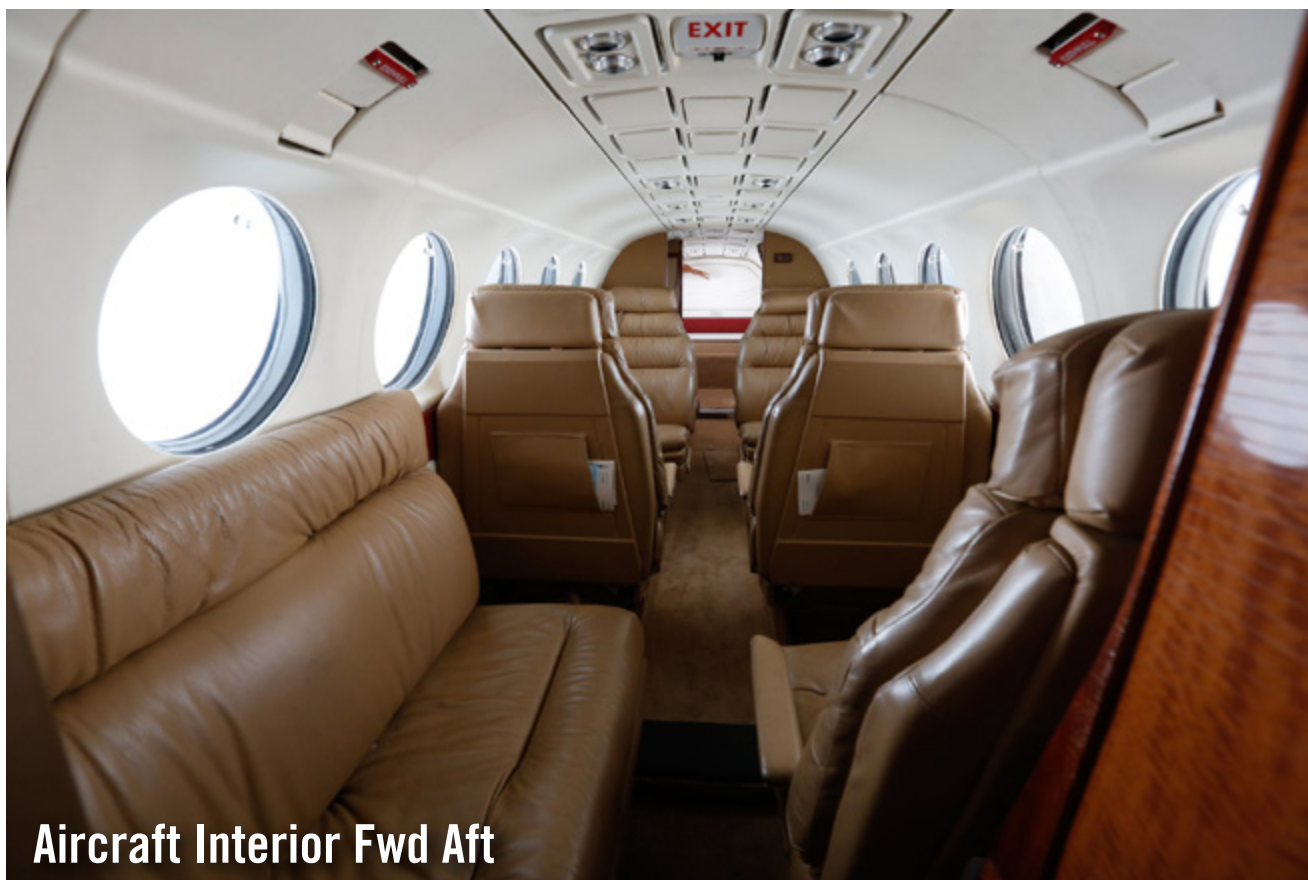
Aircraft Interior Fwd Aft