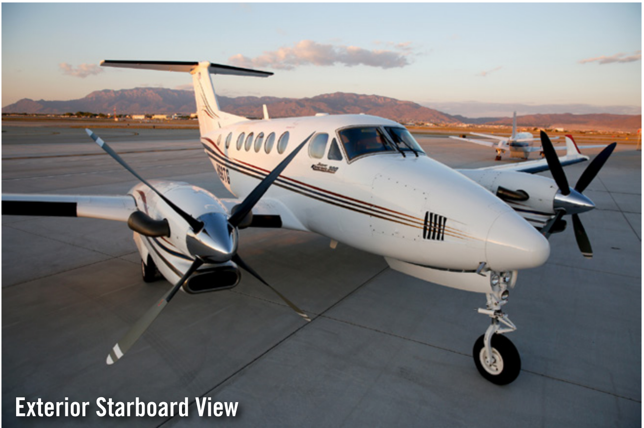
Exterior Starboard View