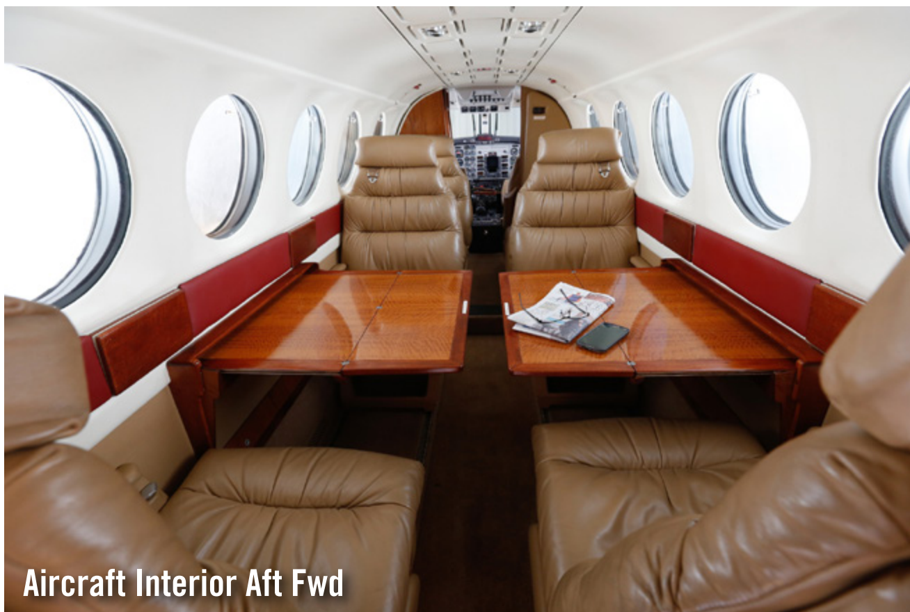
Aircraft Interior Aft Fwd