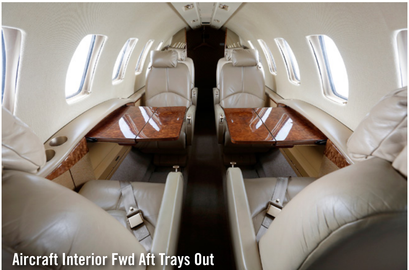
Aircraft Interior Fwd Aft Trays Out