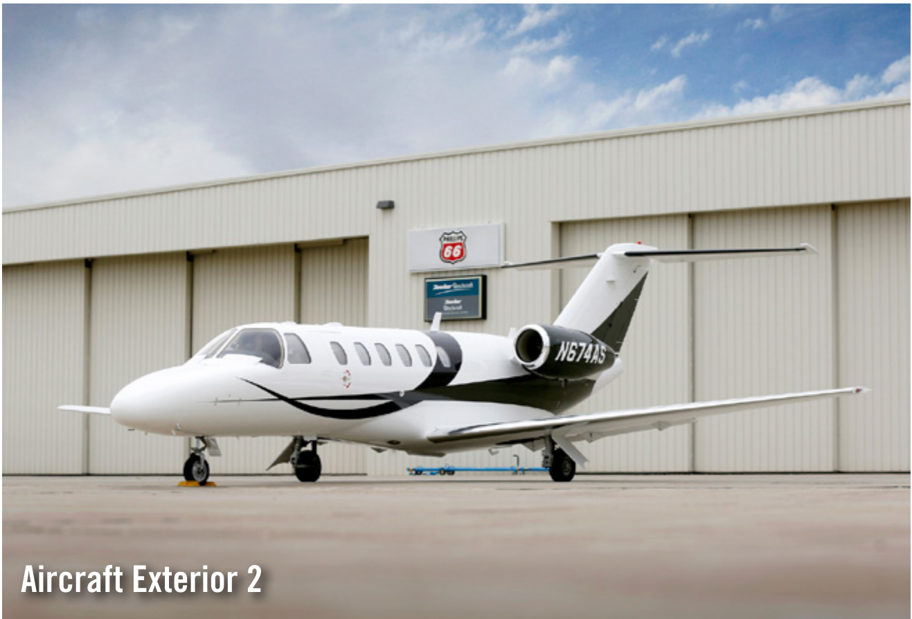
Aircraft Exterior 2