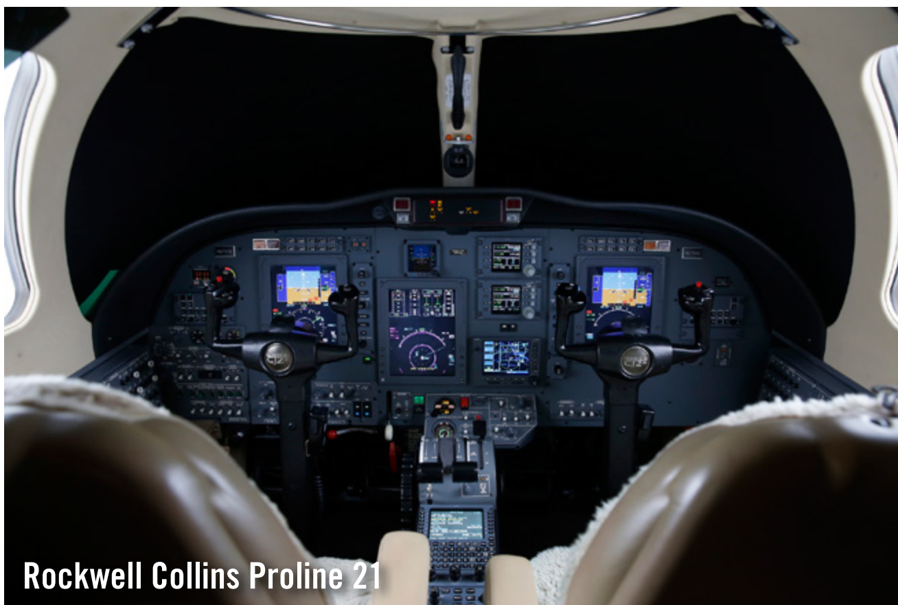
Rockwell Collins Proline 21