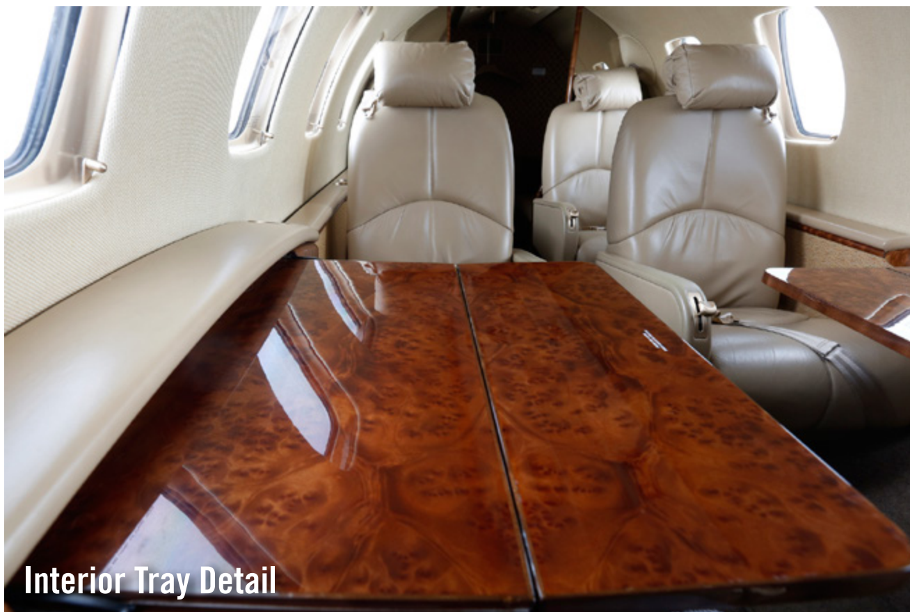
Interior Tray Detail