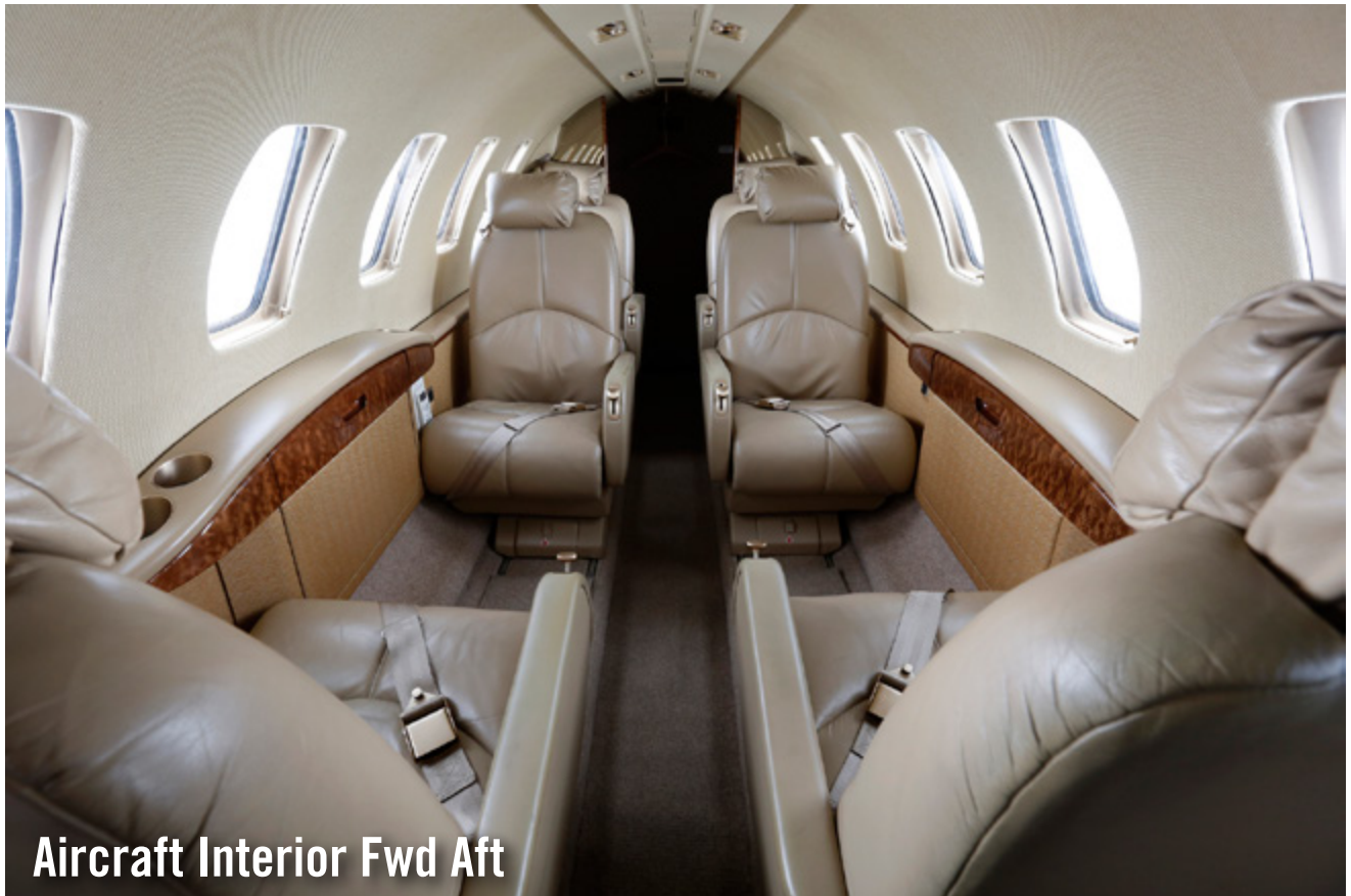
Aircraft Interior Fwd Aft