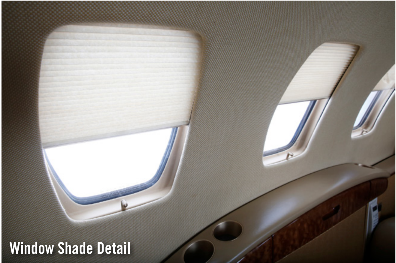
Window Shade Detail