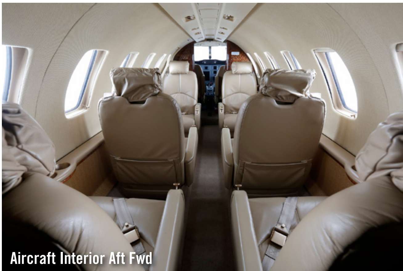
Aircraft Interior Aft Fwd