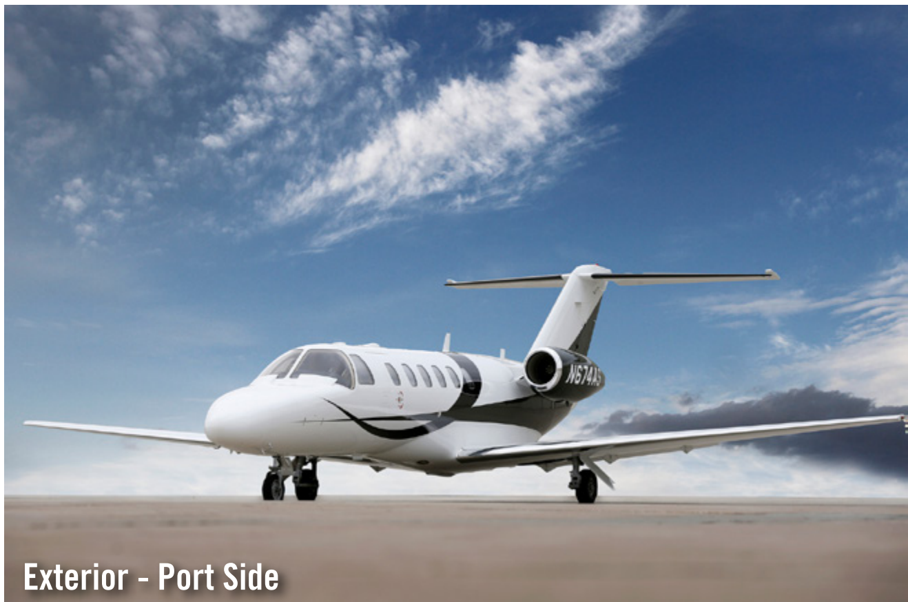
Exterior - Port Side