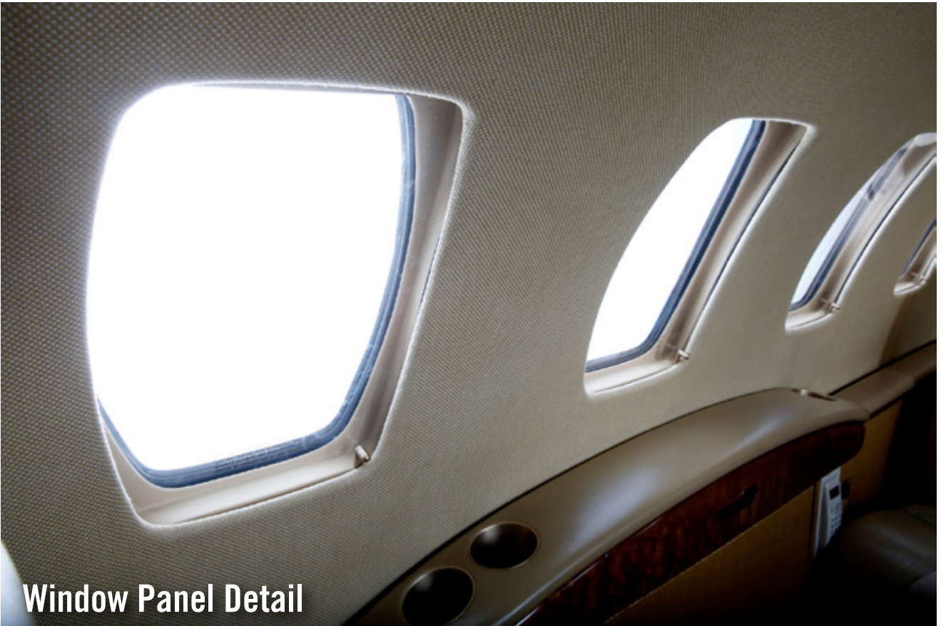
Window Panel Detail