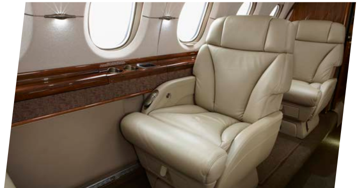
Hawker 850XP Transactions