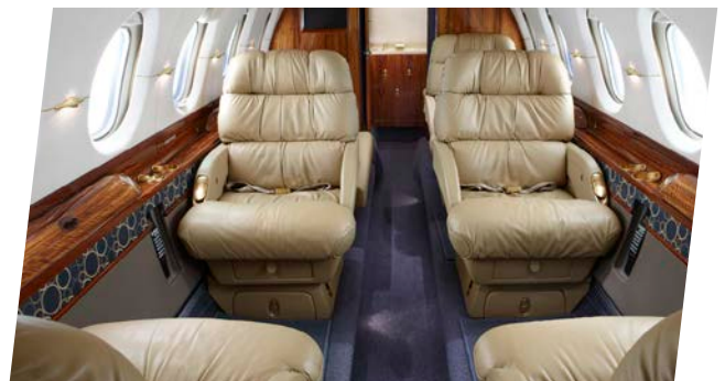
Hawker 800XP Transactions