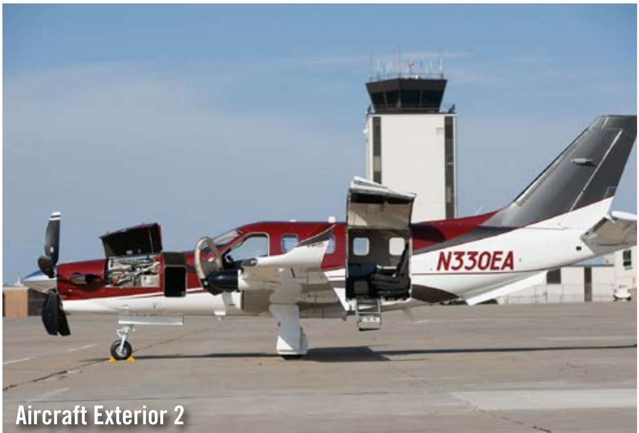
Aircraft Exterior 2