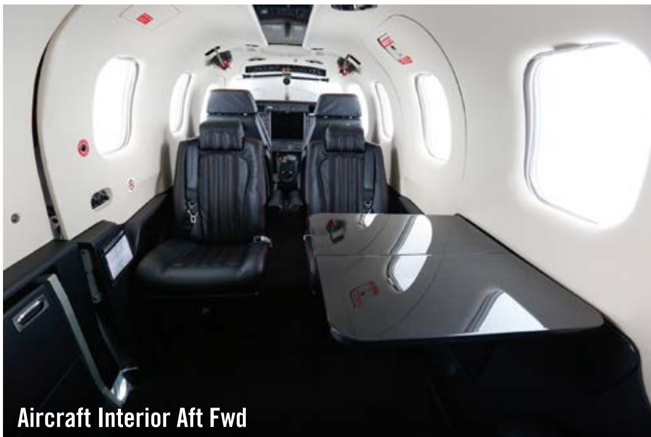
Aircraft Interior Aft Fwd