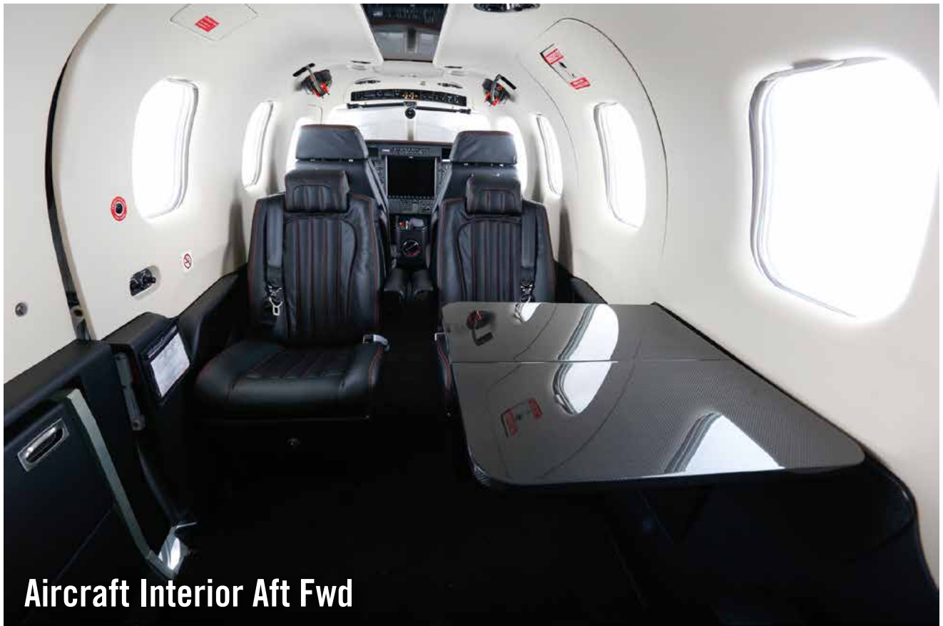
Aircraft Interior Aft Fwd