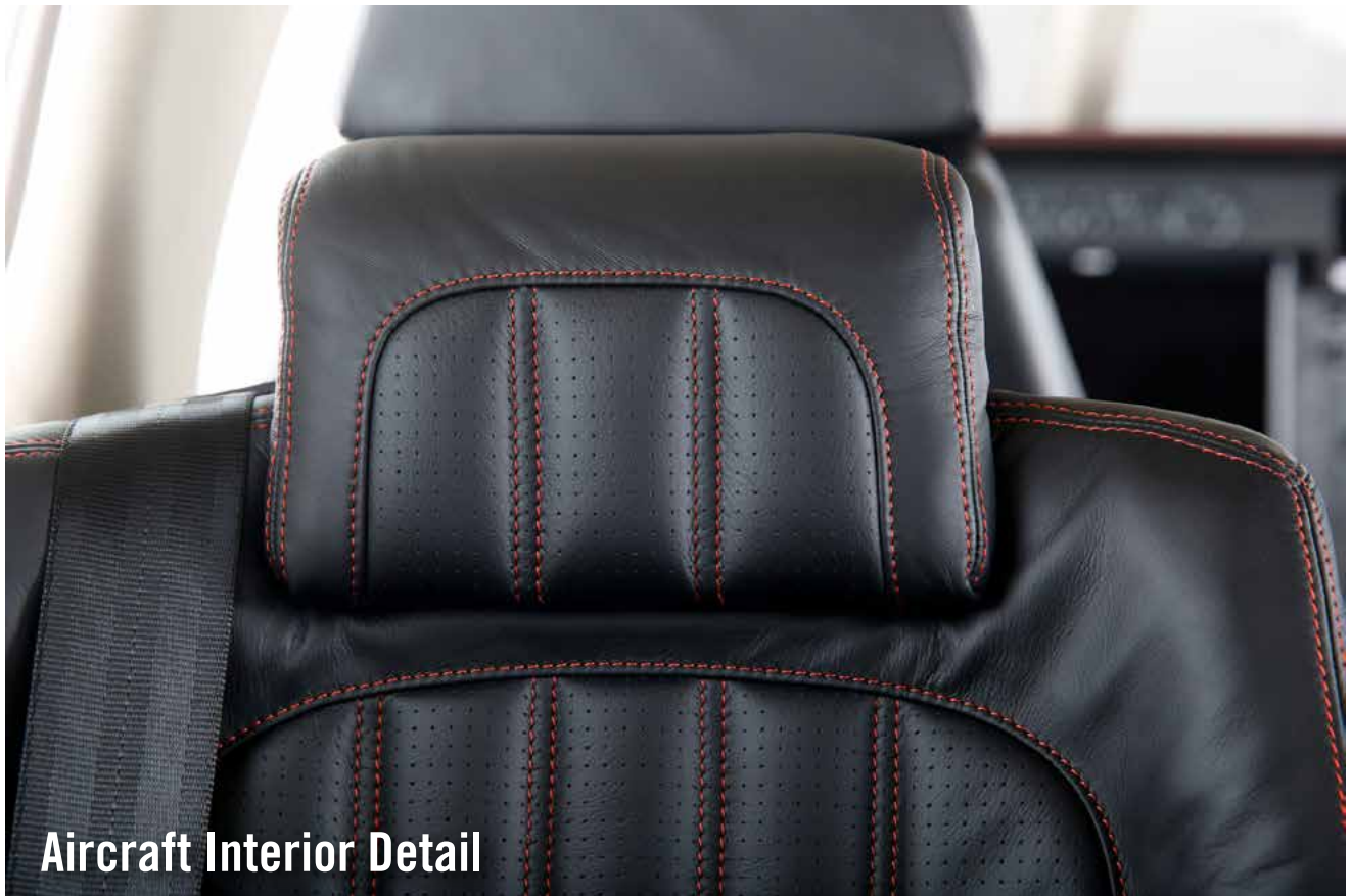
Aircraft Interior Detail