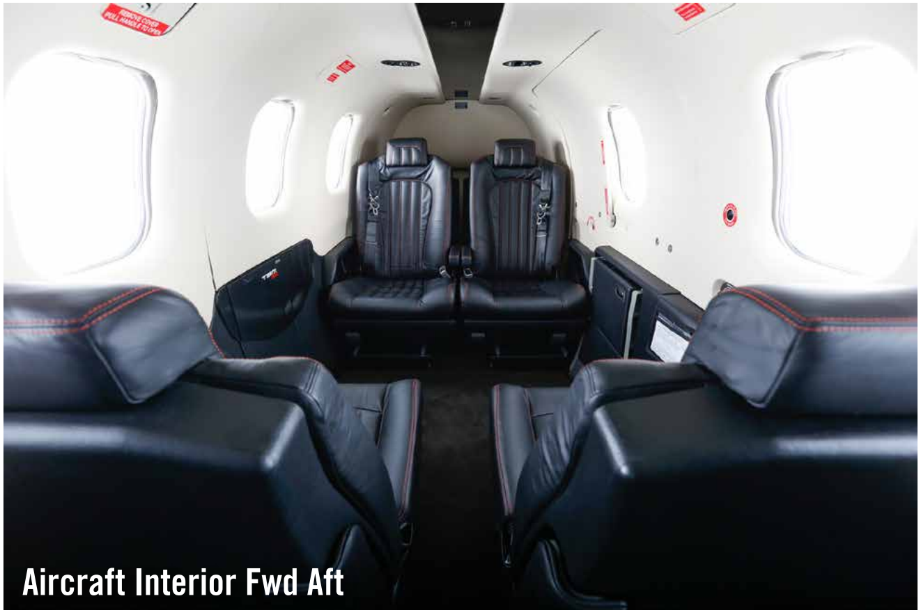
Aircraft Interior Fwd Aft