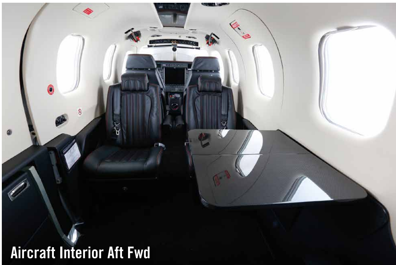
Aircraft Interior Aft Fwd