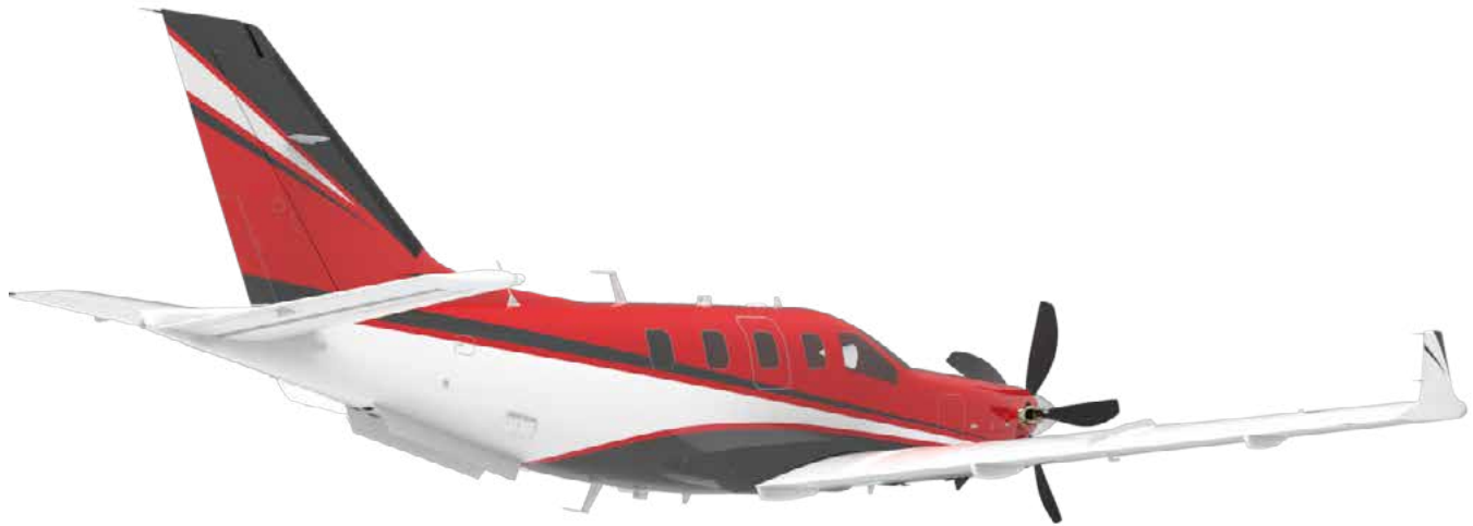
Aircraft Exterior 2