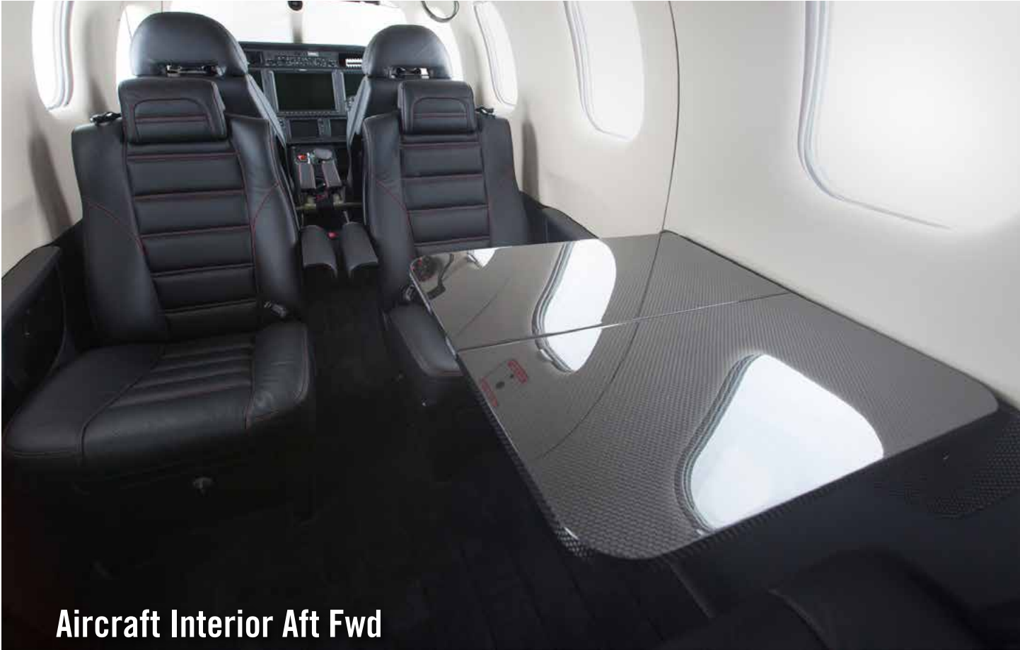
Aircraft Interior Aft Fwd