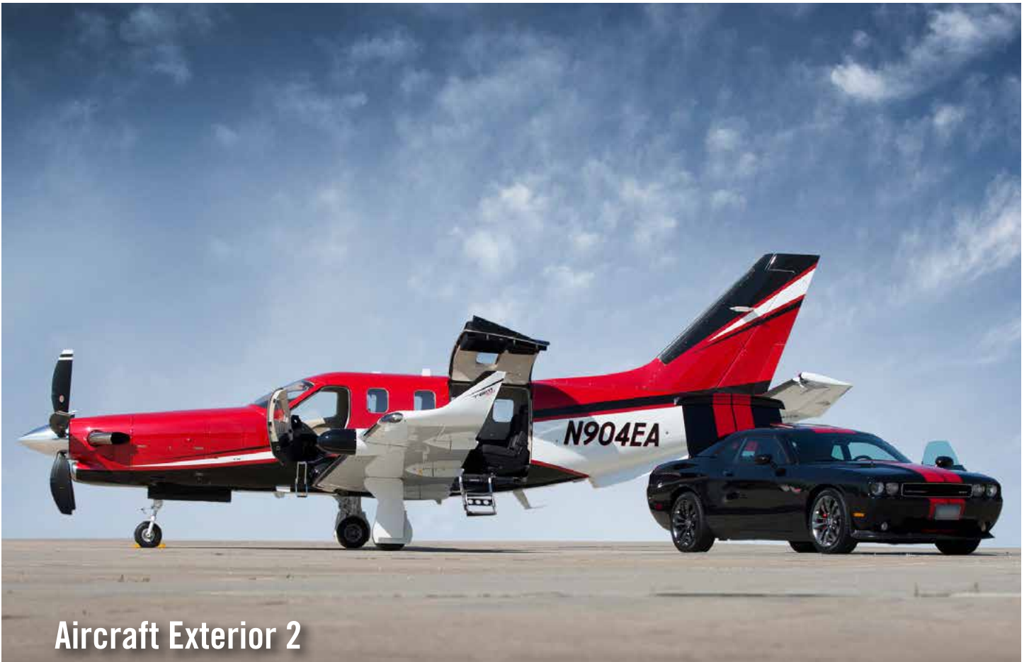
Aircraft Exterior 2