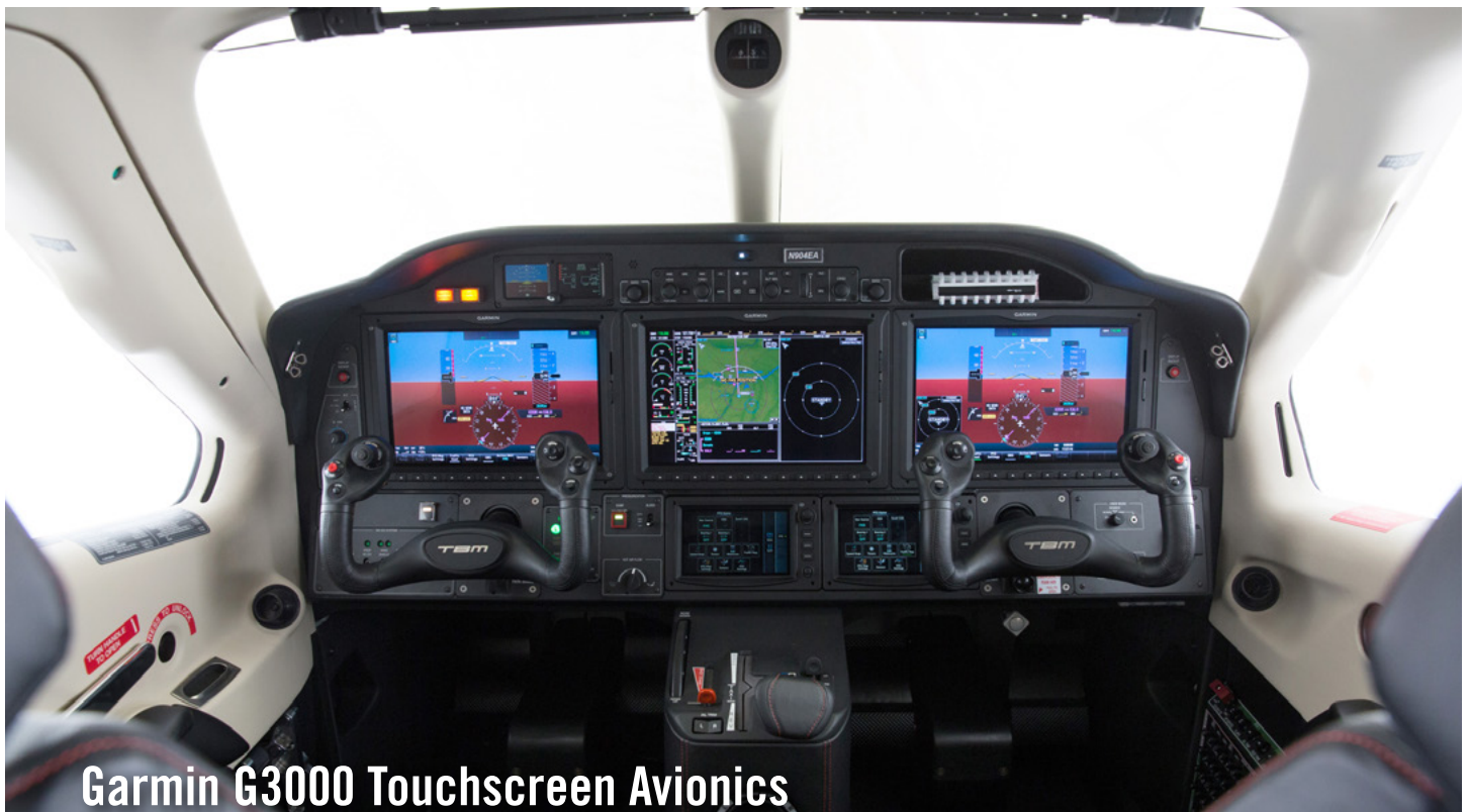
Garmin G3000 Touchscreen Avionics