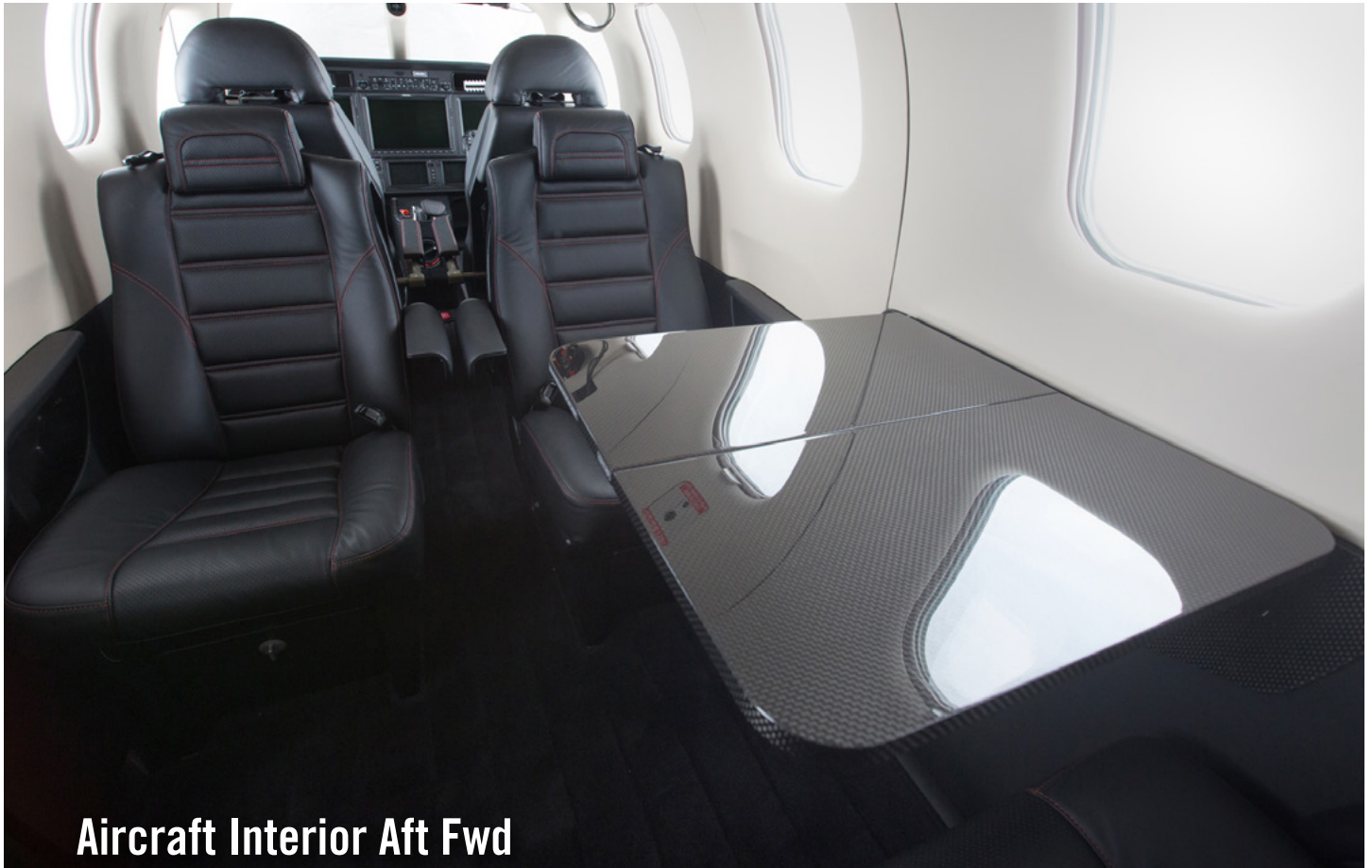
Aircraft Interior Aft Fwd