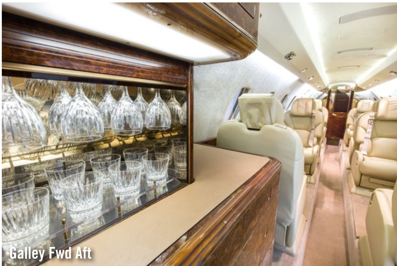
Galley Fwd Aft