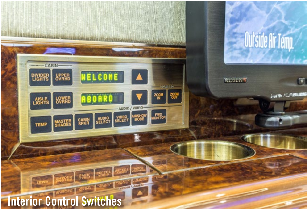
Interior Control Switches