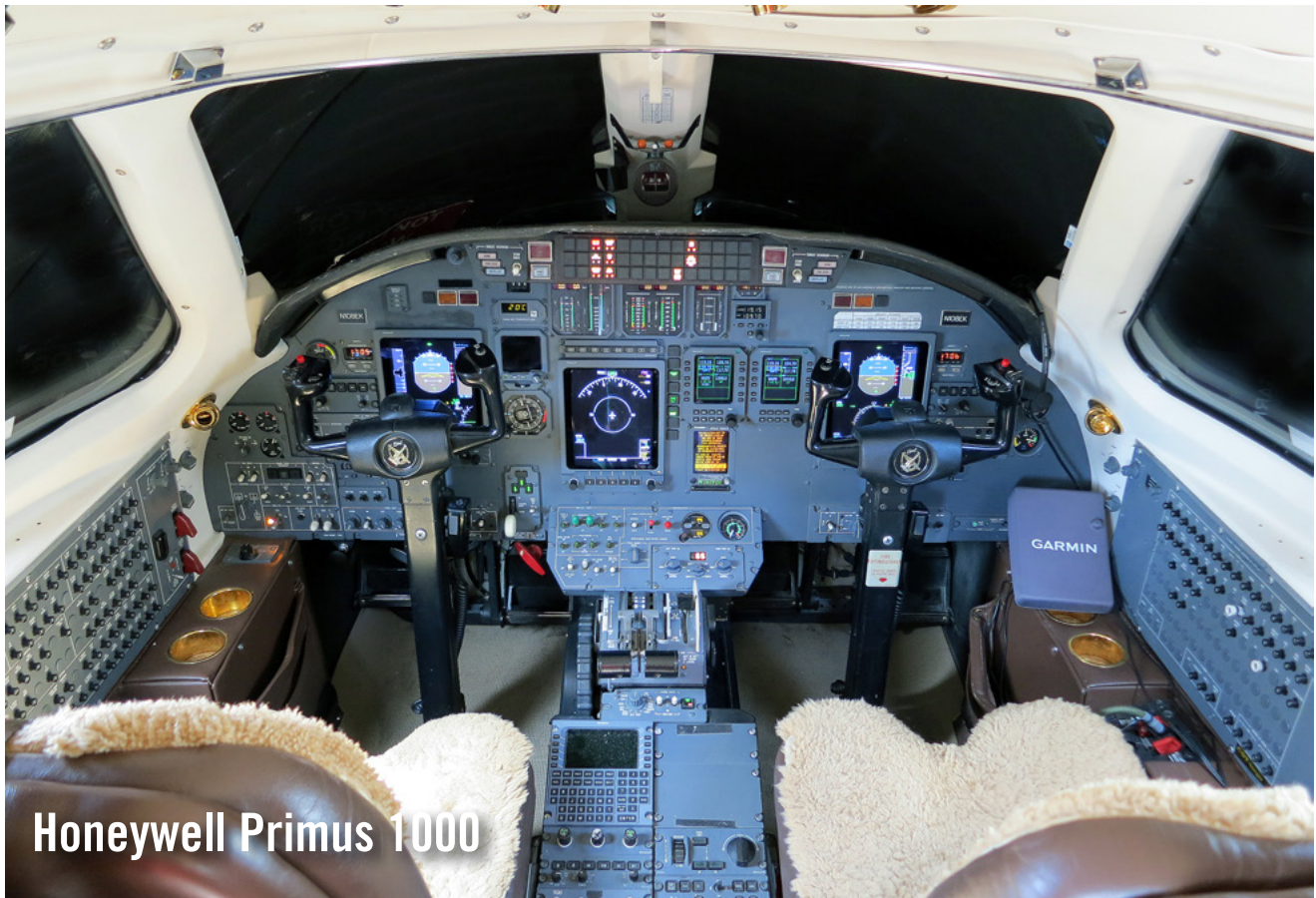
Honeywell Primus 1000