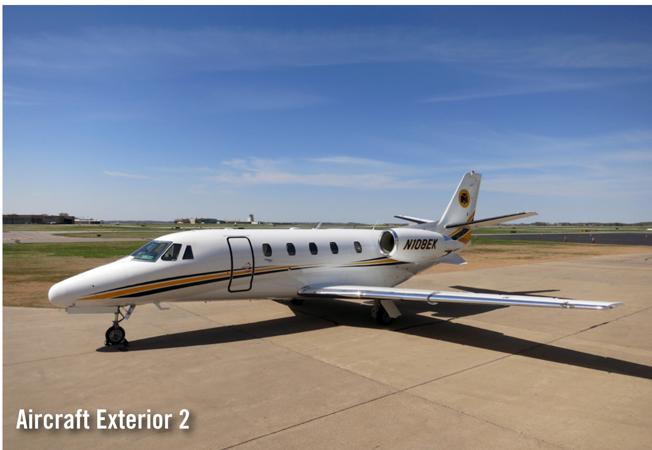
Aircraft Exterior 2