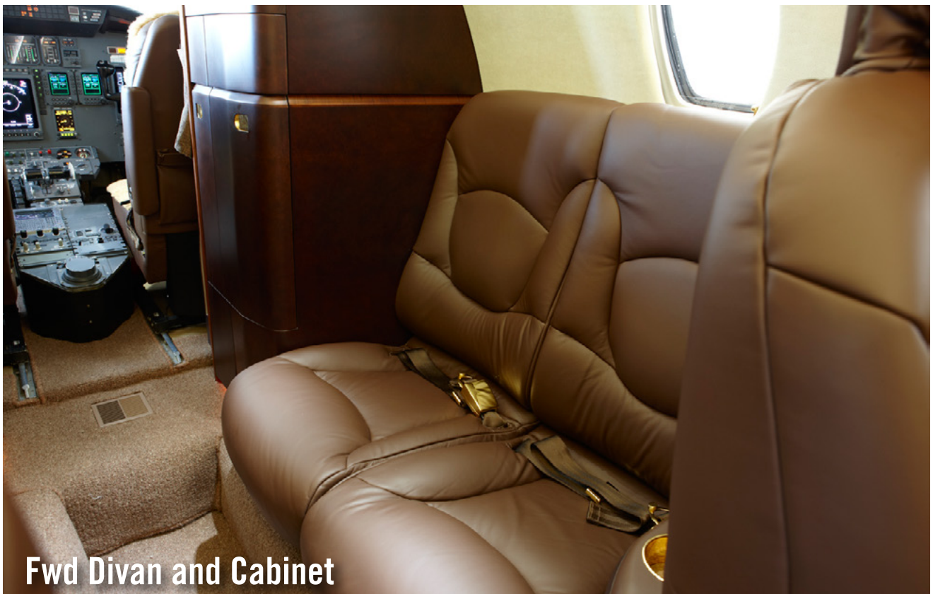
Fwd Divan and Cabinet