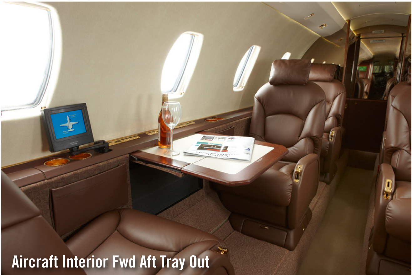
Aircraft Interior Fwd Aft Tray Out