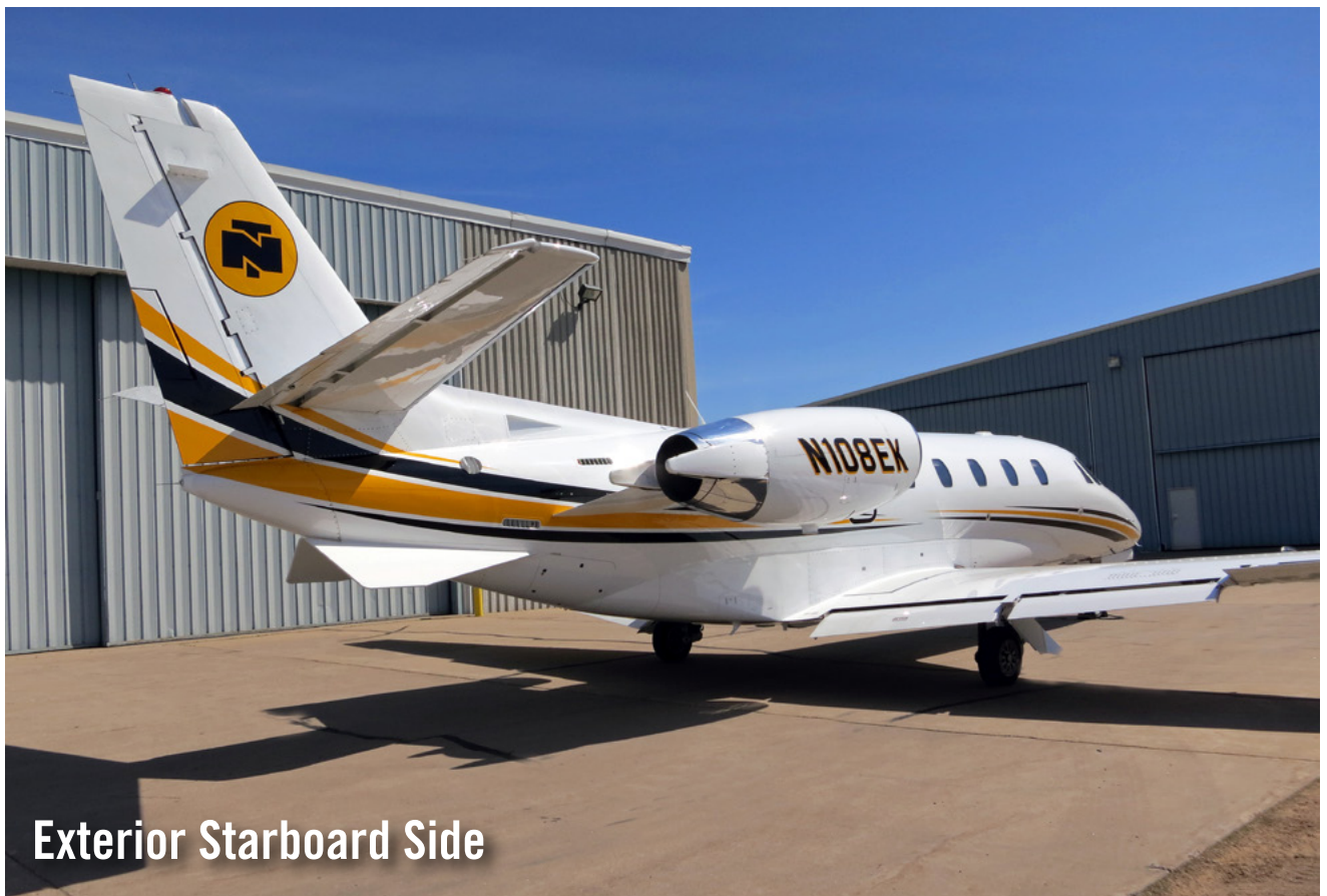
Exterior Starboard Side