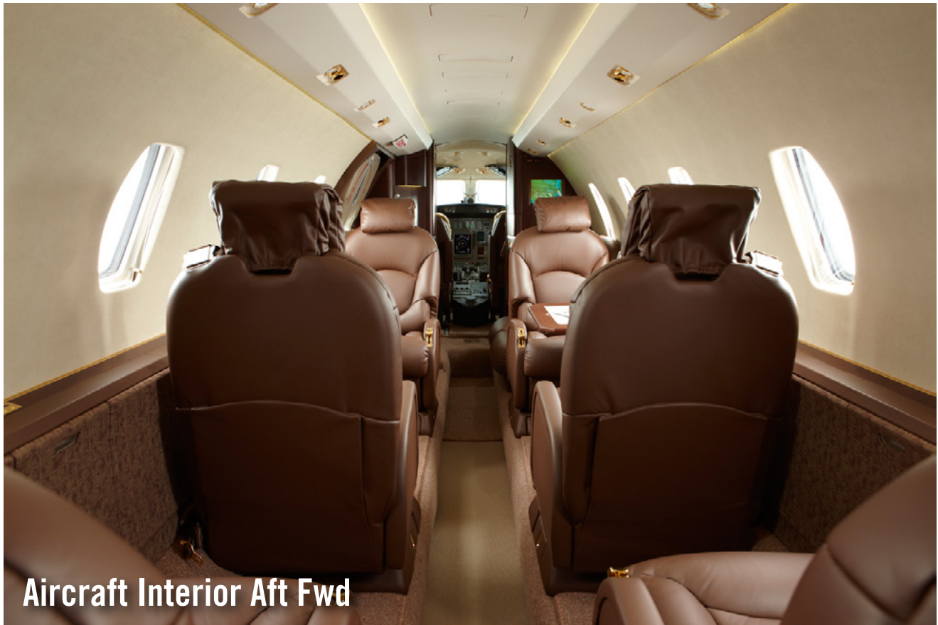
Aircraft Interior Aft Fwd