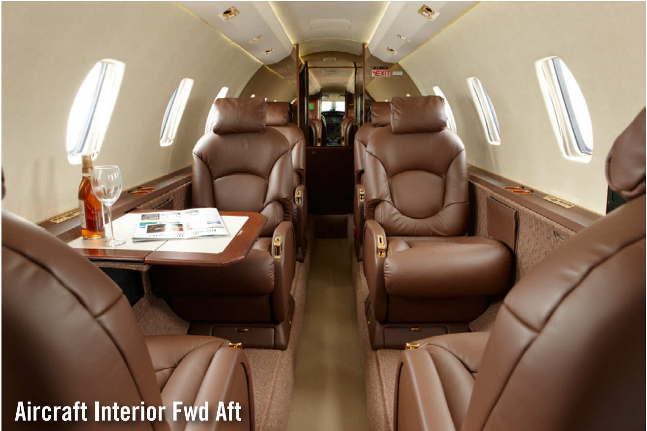
Aircraft Interior Fwd Aft