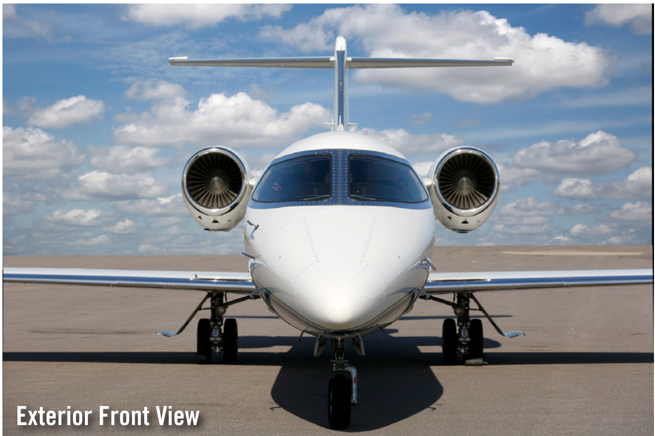
Exterior Front View