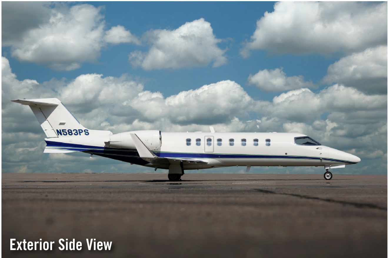
Exterior Side View