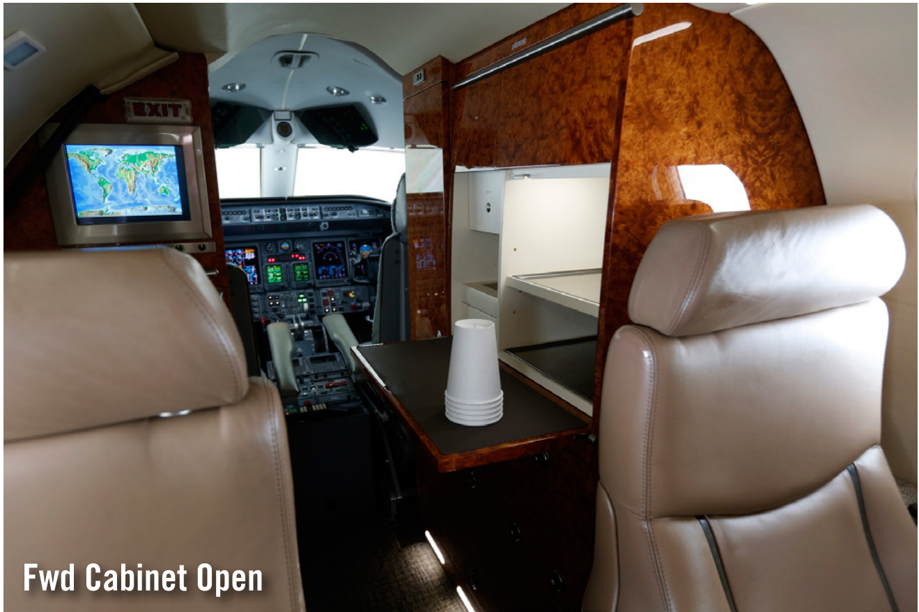
Fwd Cabinet Open