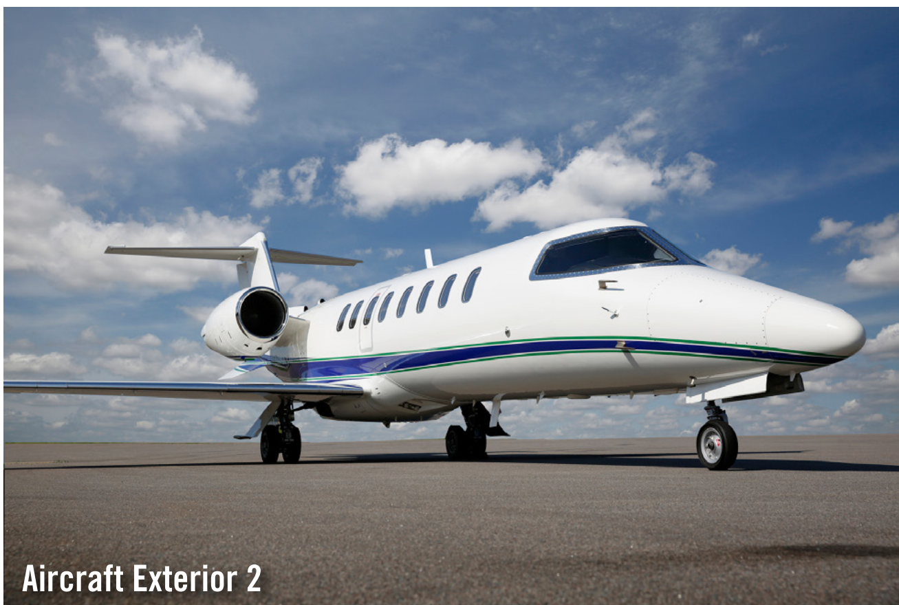
Aircraft Exterior 2