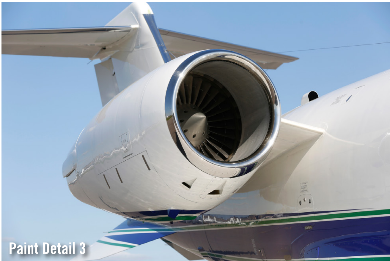
Paint Detail 3