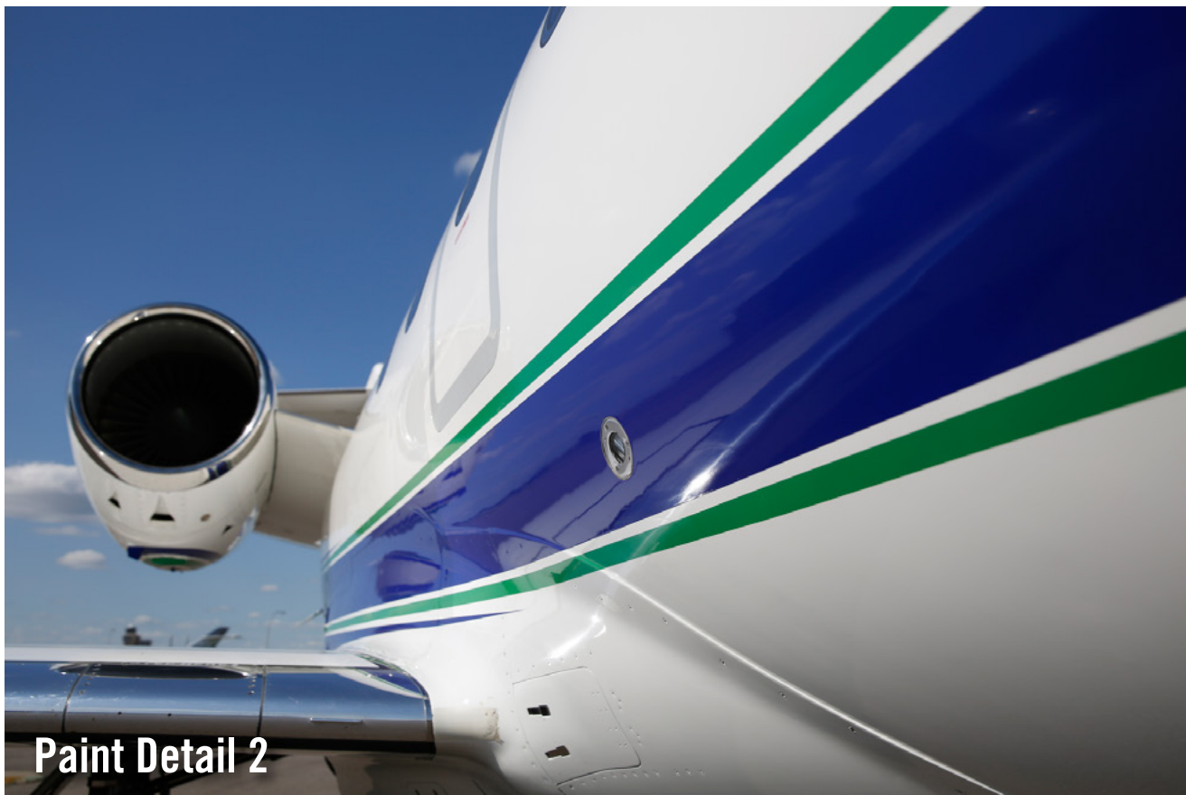
Paint Detail 2