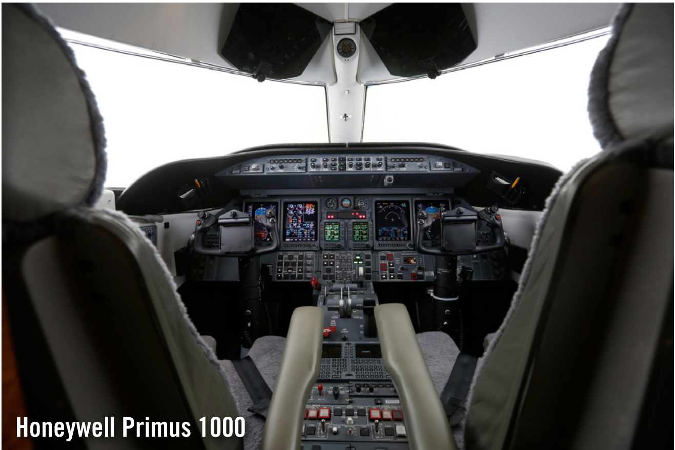
Honeywell Primus 1000