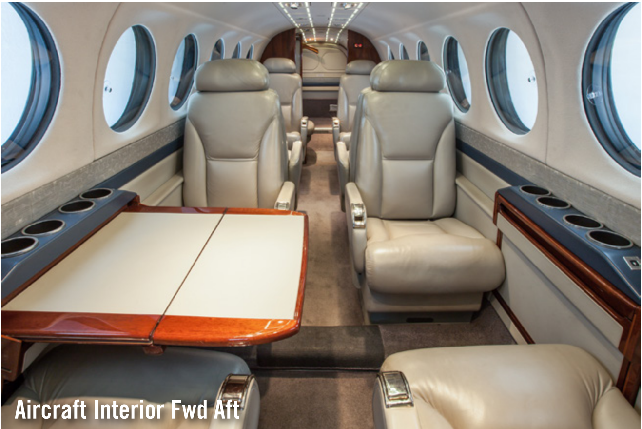
Aircraft Interior Fwd Aft