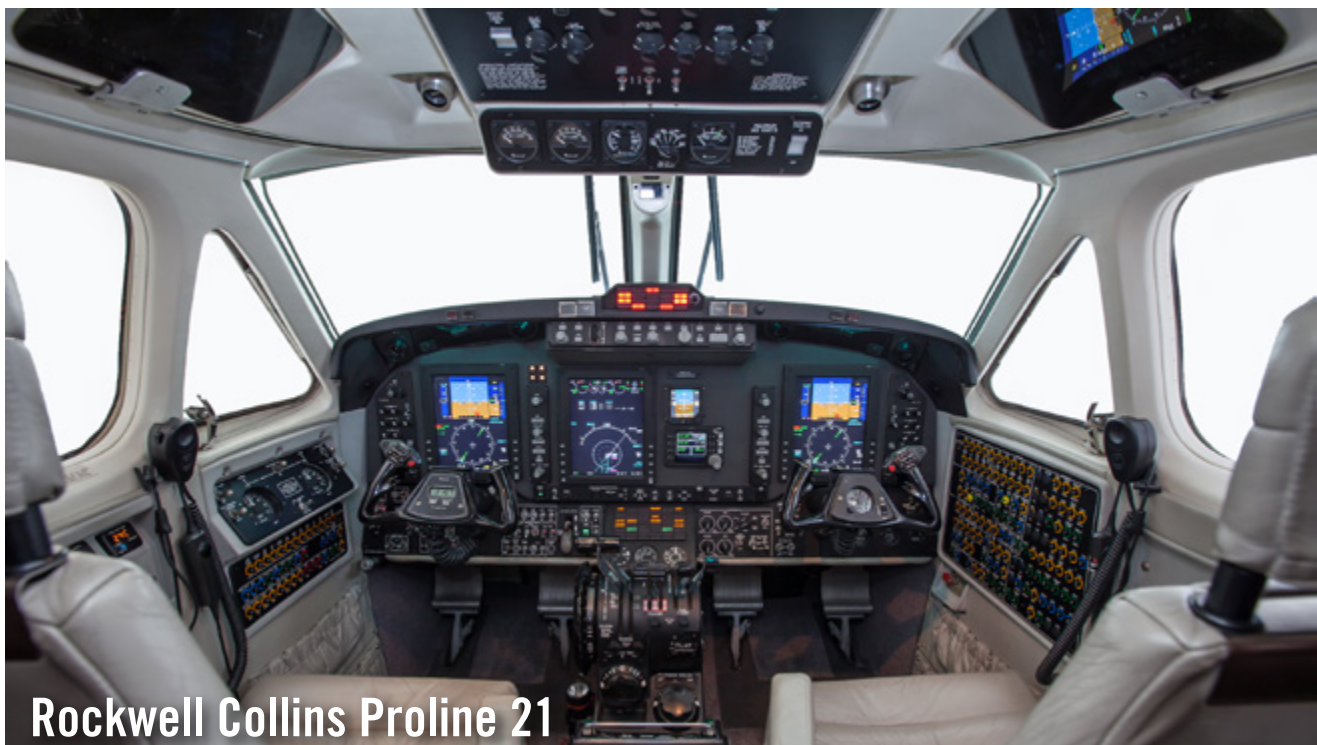
Rockwell Collins Proline 21