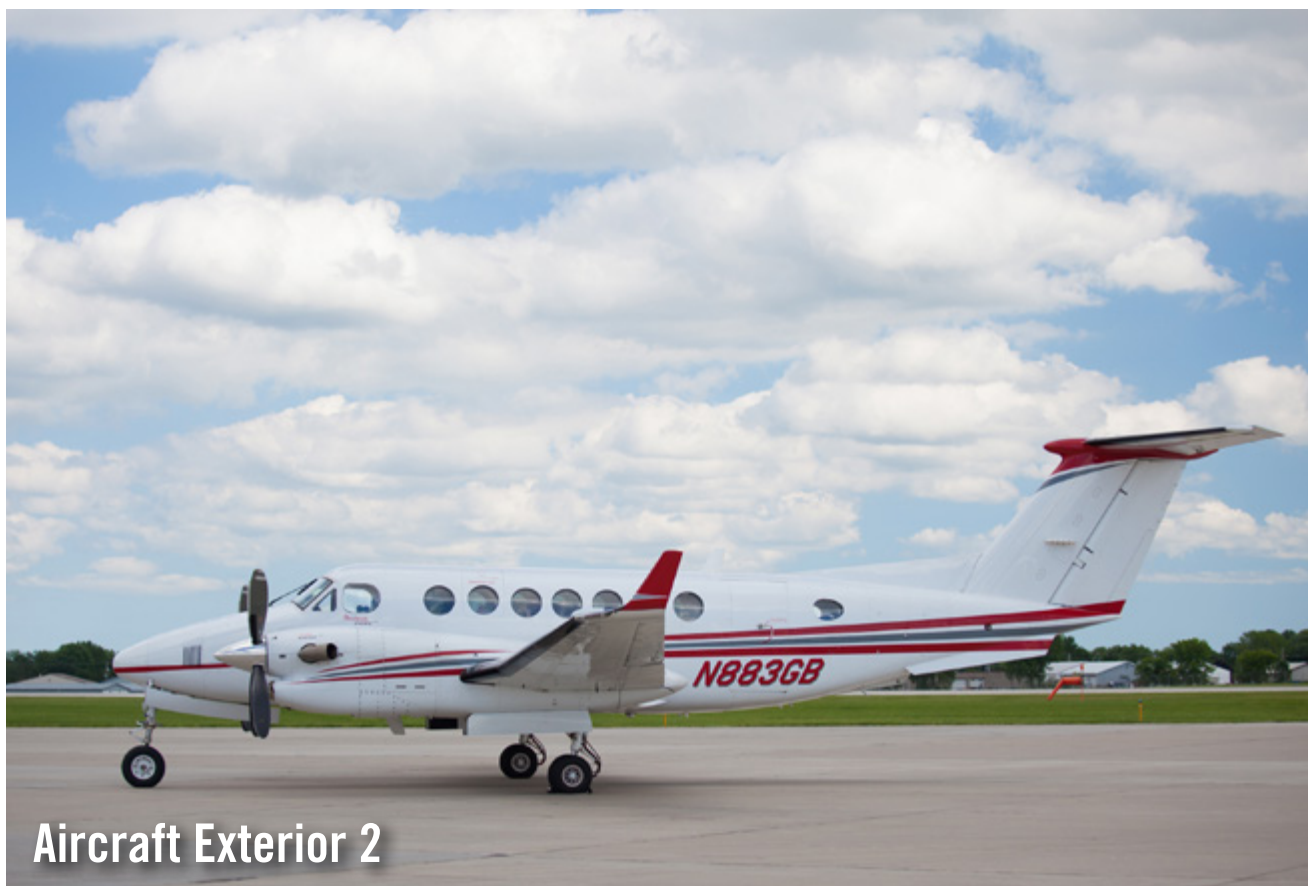
Aircraft Exterior 2