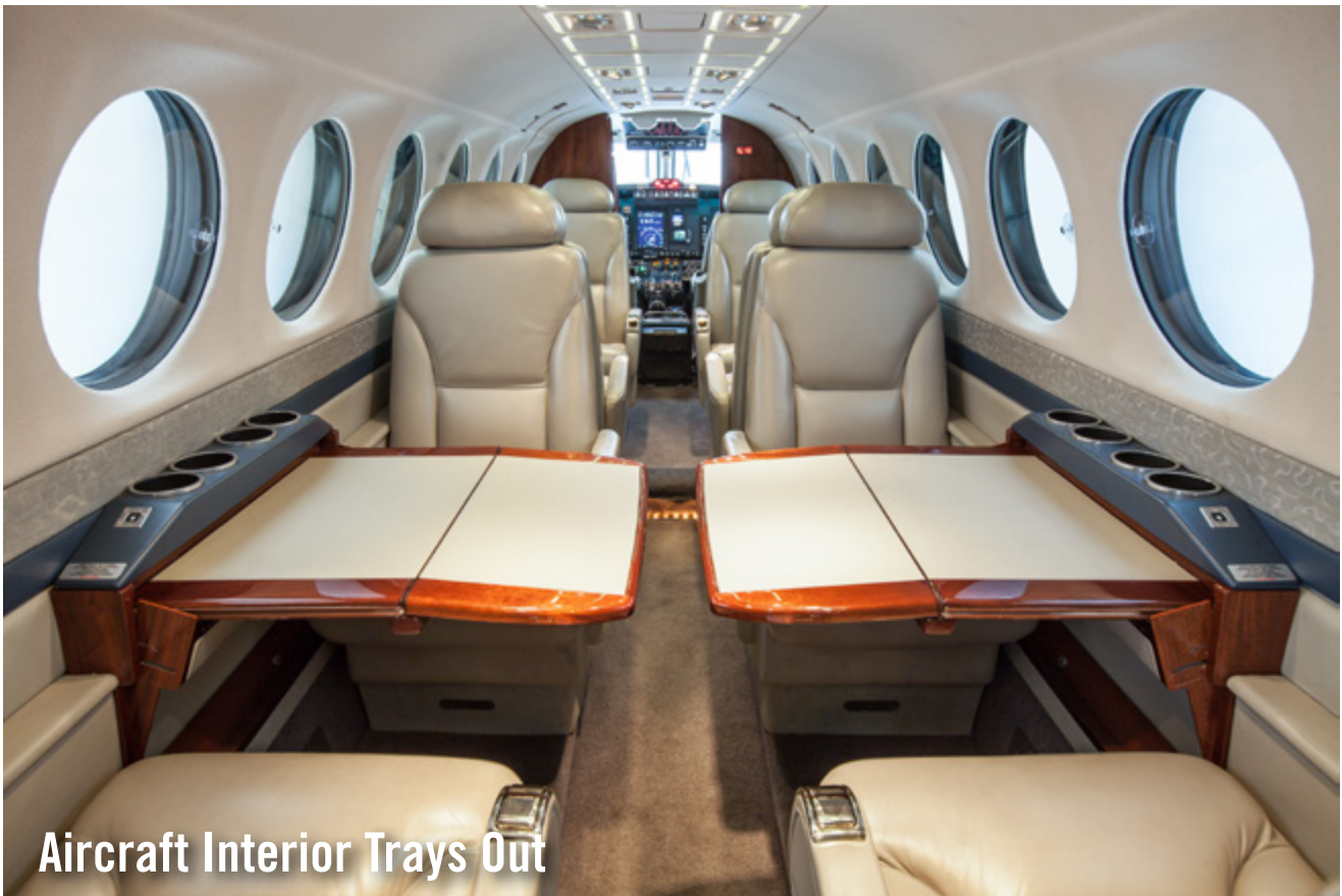
Aircraft Interior Trays Out