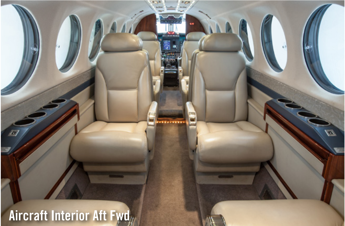
Aircraft Interior Aft Fwd