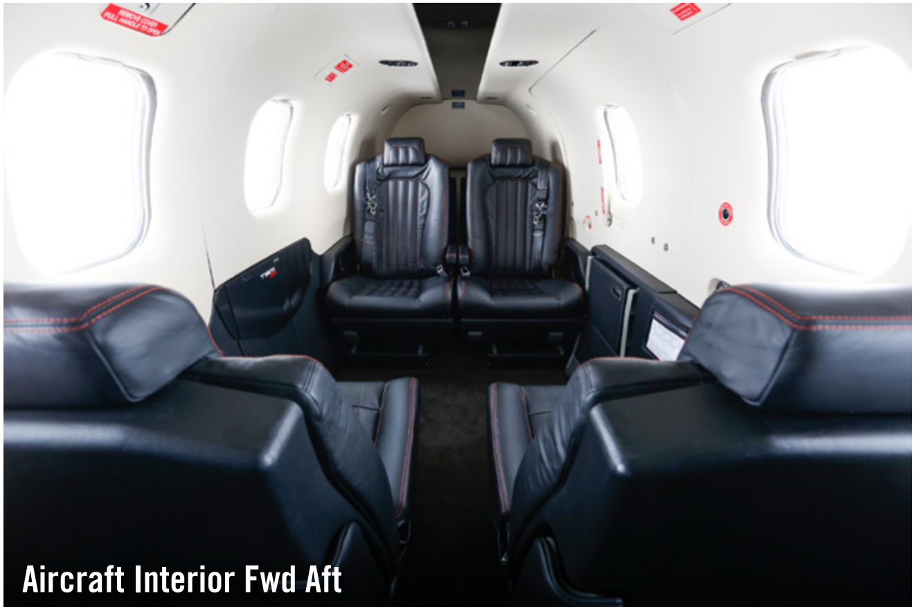
Aircraft Interior Fwd Aft