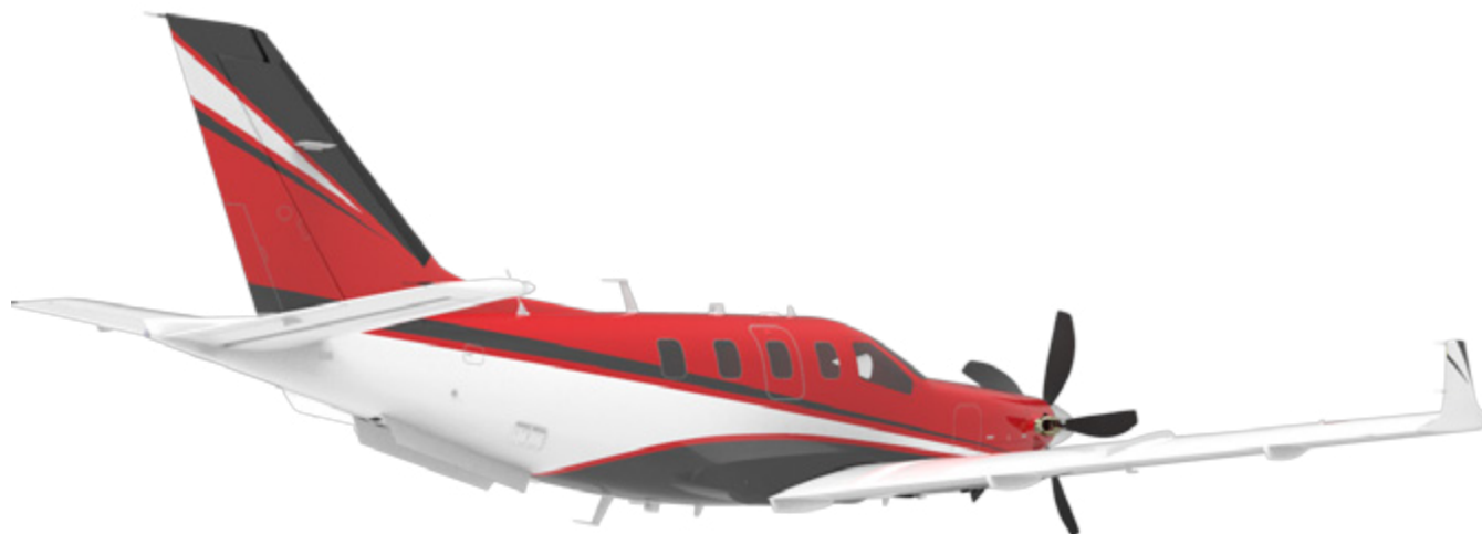
Aircraft Exterior 2