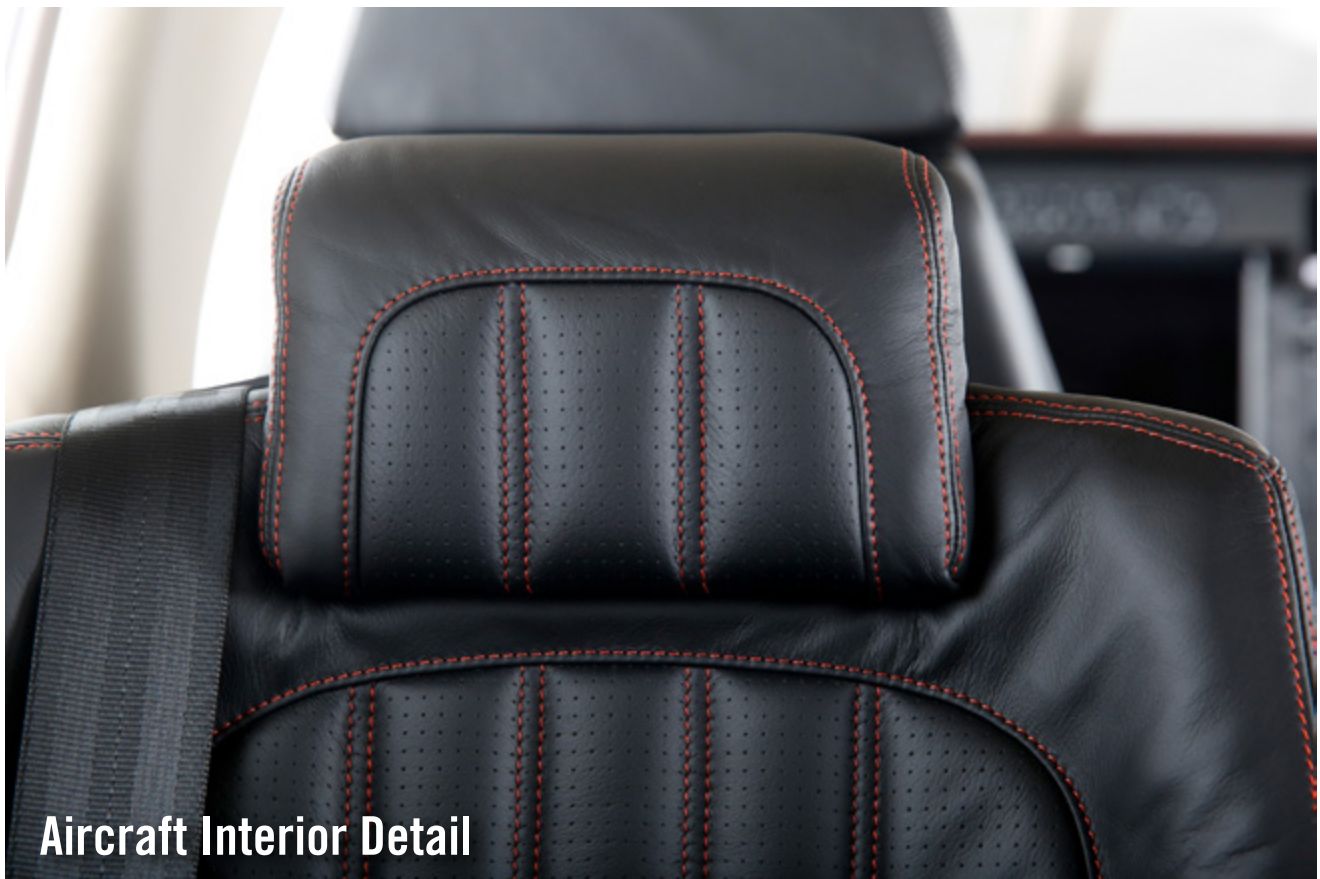
Aircraft Interior Detail