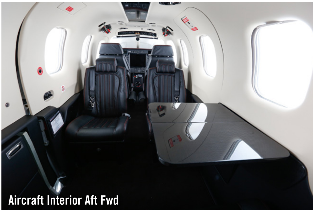
Aircraft Interior Aft Fwd